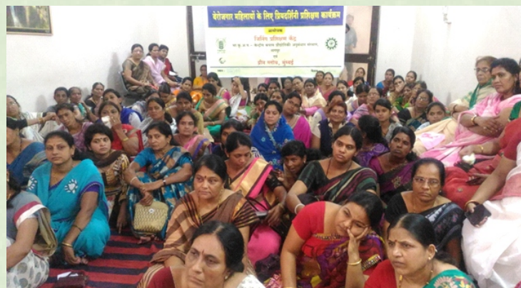
Training program for women organized at Amravati on September 28, 2016