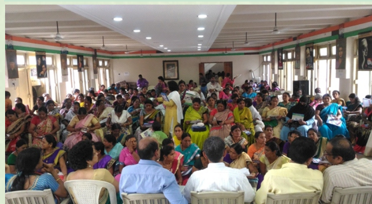
Training program for women organized at Nagpur on September 29, 2016