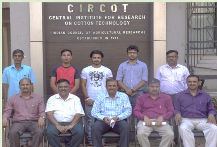
Group photo of a training programme on Quality Evaluation of Cotton organized during September 26-30, 2016

In line with the skill development initiative of the Govt of India, a five day training programme on “Quality Evaluation of Cotton” was organized during Sept. 26-30, 2016 at Mumbai for participants from the Cotton Trade and Industry. This programme focussed on basics of cotton grading, quality evaluation & its importance in trade. Practical classes and demonstrations on cotton quality assessment, cotton grades, spinning and yarn testing were also conducted. In addition, a visit to Cotton Association of India was arranged to expose the participants to commercial grading of cotton.