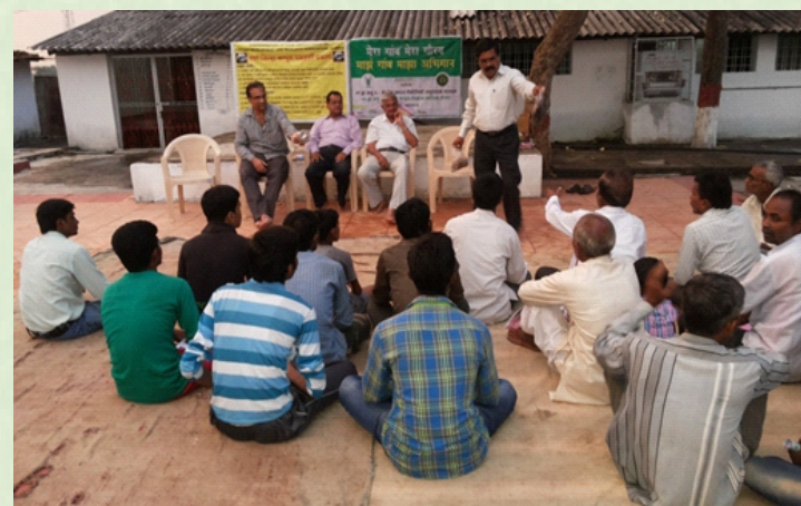
Mera Gaon Mera Gaurav programme at Sonegaon, Wardha on September 26, 2016