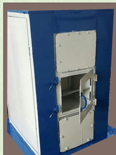
Cotton lint opener

Cotton lint samples from densely packed bales should be properly opened and cleaned for accurately measuring the fibre quality parameters using High Volume Instruments. Presently, testing laboratories either employ human labour or use trash analyzer for the purpose of opening cotton lint samples for testing. In both these methods, the extent of lint opening is not uniform or optimum and the speed is also very slow. Therefore, a new device has been designed to give uniform and desired lint opening at faster rate without any damage to the cotton fibres. The research prototype of the lint opener has been fabricated and tested for performance evaluation.