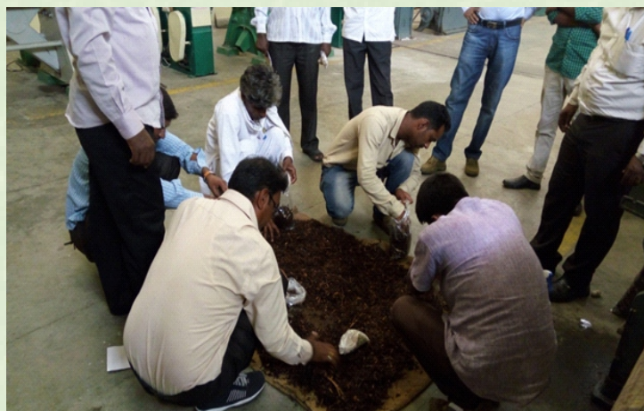
Participants during hands-on-training on oyster mushroom seed bed preparation at GTC, Nagpur

A demonstration cum training programme on oyster mushroom production and preparation of pellets from cotton stalks was organized at GTC, Nagpur on September 17, 2016. The programme started with the interaction of farmers with team of experts from GTC of ICAR-CIRCOT. The production of oyster mushroom using cotton stalks and other agro-wastes was illustrated to the farmers. Demonstration was conducted with respect to spawn production and cultivation of mushroom using cotton stalks. Farmers were also demonstrated about preparation of pellets from cotton stalks.