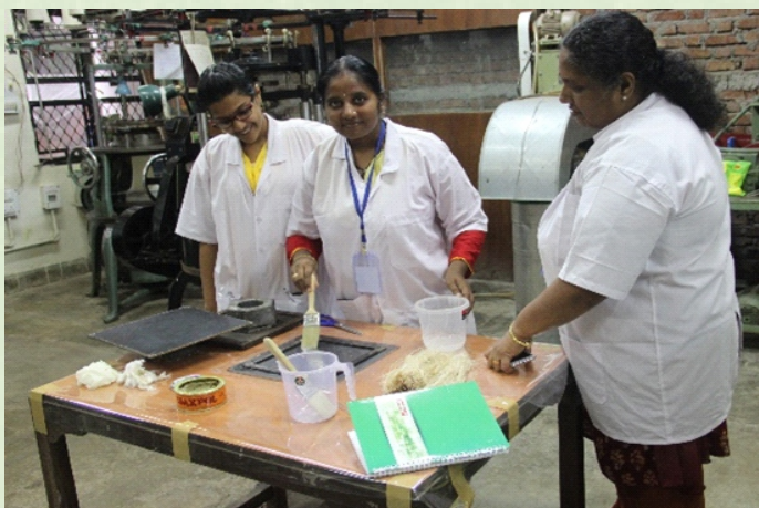
Hands-on practical training on preparation of nano composites