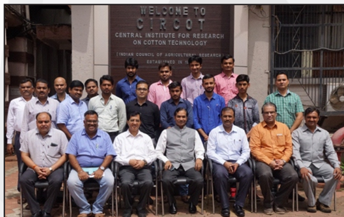
Participants of “Quality Evaluation of Cotton” training with Secretary DARE & DG, ICAR

The course was aimed to understand the basics of cotton grading, quality evaluation and its importance in trading, fibre attributes and their impact on yarn quality, contamination in cotton, marketing and commercial aspects of cotton, ginning & mechanical processing and its effect on cotton economics, harvesting and storage practices and global importance of Indian cotton. Hands-on training and demonstrations on fibre properties (length, fineness, maturity and tenacity), cotton grades, spinning and yarn testing were conducted. Both theoretical and practical knowledge about cotton fibre quality testing using High Volume Instrument (HVI) and Advanced Fibre Information System (AFIS) was given to trainees. The participants also visited Cotton Association of India (CAI), Cotton Green, Mumbai to get exposure about commercial grading of cotton. There were twelve participants representing ginning industry, cotton trade and Cotton Corporation of India.