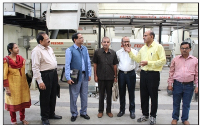
The QRT members visiting the Pilot plant facility at GTC, Nagpur