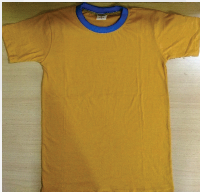
Cotton/Bamboo/PLA blended garment

The product has the functionalities of improved smoothness and softness with better moisture wicking ability suitable for use as high end casual wear.