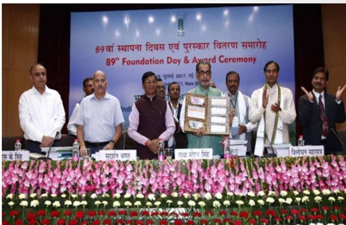
CIRCOT Paper Pulp Technology released during the ICAR Foundation Day Celebrations on July 16, 2017