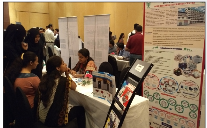
ICAR-CIRCOT stall at Indo-Global Education and Skill Expo-2017