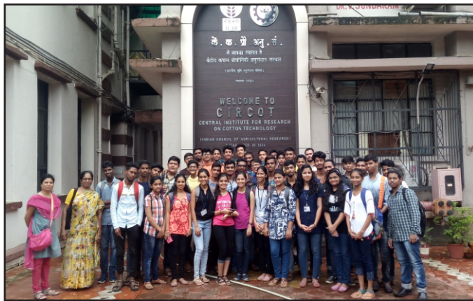
Students from SASMIRA at ICAR-CIRCOT, Mumbai on July 21, 2017

A visit to Mechanical Processing Division, Yarn and Fibre Testing section was arranged for sixty students from Synthetic & Art Silk Mills' Research Association (SASMIRA), Worli, Mumbai on July 21, 2017 in order to understand the spinning process and various yarn and fibre testing methods. They were also briefed about the various other institute activities.