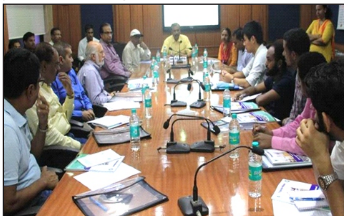
Inaugural function of training program on “Value Addition to Cottonseed” at ICAR-CIRCOT on July 20, 2017