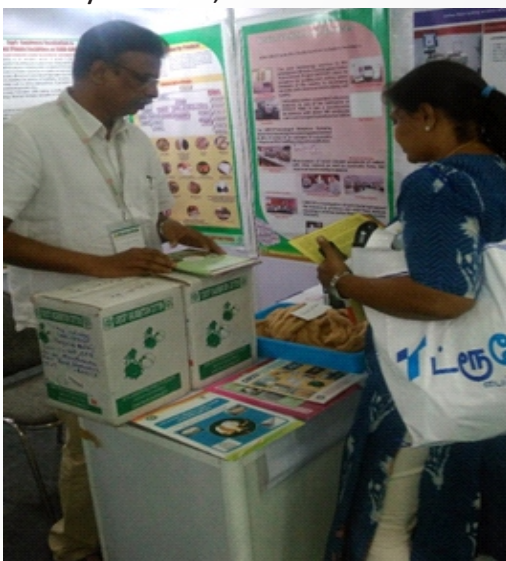
ICAR-CIRCOT stall at AGRI INTEX-2017