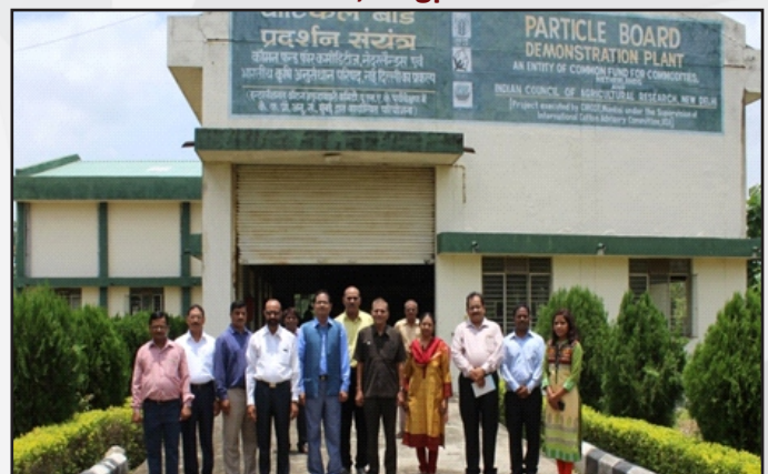
The QRT members along with GTC scientists at the particle board plant