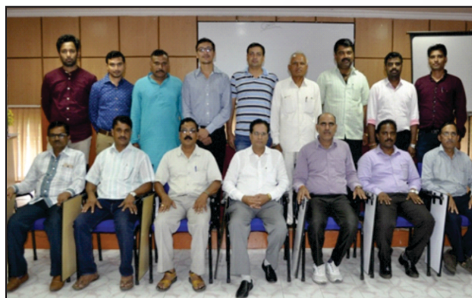
Participants of the training program on “Double Roller Ginning Technology and Basics of Cotton Grading” during July 10-15, 2017 at GTC, Nagpur

Ginning Training Centre, Nagpur organized a one week training program on “Double Roller Ginning Technology and Basics of Cotton Grading” during July 10-15, 2017. Nine participants representing ginning industries from Maharashtra, Gujarat, Madhya Pradesh and Haryana attended the training program. The training course covered various aspects such as fibre quality assessment like fibre length, strength, fineness and maturity, cotton trading and marketing, DR ginning technology, automation & ginning settings, repairs and maintenance of ginning and pressing machinery, humidification in ginning system, cotton by-product utilization etc. Guest lectures on cotton trading, cotton marketing, pre-engineered building structures for cotton and bale storage were delivered by invited experts. The trainees were taken for industrial visits to M/s Bajaj Steel Industry & M/s Sri Bhagirath Textiles Ltd.