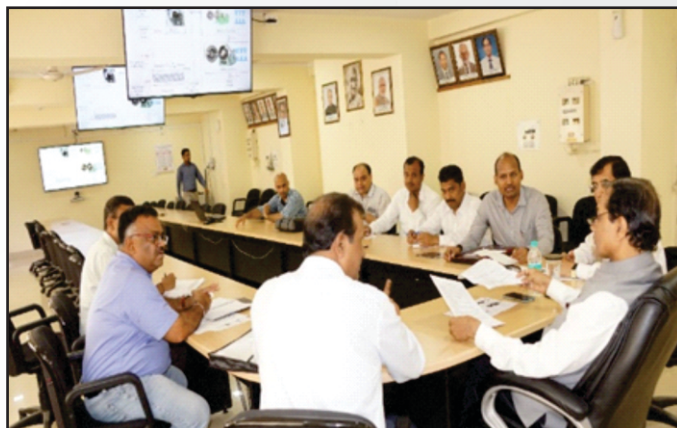
Dr. Trilochan Mohapatra, Secretary, DARE & DG, ICAR interacting with scientists of ICAR-CIRCOT regarding Paper Pulp Technology