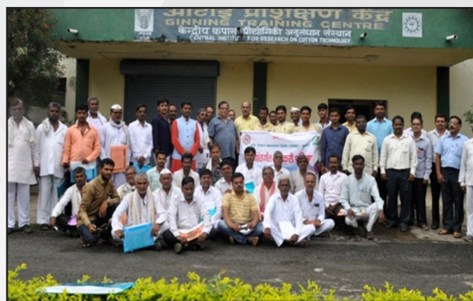
Farmers from Jalna, Maharashtra attending the training at GTC, Nagpur during July 17-20, 2017

In this line, two batches of farmer's coordinated through ATMA, were trained in the area of “Production and Post-harvest Processing of Cotton”. Thirty Eight farmers from Jalna, Maharashtra and fifty five farmers from Jalna and Buldhana, participated in the training programs held during July 17-20 and July 24-27 respectively. The training programs were designed in a manner so as to provide first-hand information on recent techniques to enhance cotton productivity and remunerate additional income in cotton cultivation. The training module dealt with best cotton production management practices, biological inputs in cotton farming, pest and disease management techniques, cotton marketing, fibre quality parameters and by-products utilization. The farmers were taught about the value-addition to biomass for additional income generation. The training also covered practical sessions on compost preparation and production of oyster mushroom using cotton stalks. Trainees were also taken to CCRI, Nagpur, M/s Neem Foundation, Gondkhairy, Tehsil- Kalmeshwar, Nagpur and M/s Ankur seeds Pvt. Ltd., NERI farms.