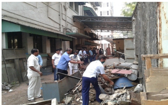
Segregating scrap for auction as part of the cleanliness drive

As a part of the implementation of the Swachh Bharat Mission, a cleanliness drive was arranged in the Institute premises on January 9, 2018 in which scrap articles kept near the pump house for condemnation/disposal were segregated into plastics, metals, machineries parts etc. and stored for further auction. The work was done by forming a human chain where all the staff members enthusiastically participated in the cleaning programme.