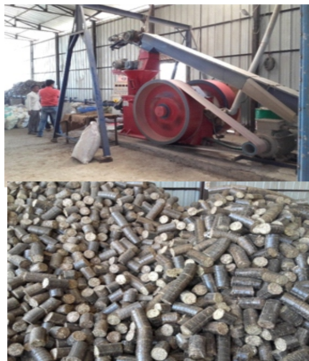
Briquetting Unit at Anji, Wardha

being high in calorific value, is a promising alternative to soybean/red gram stalks for briquetting.