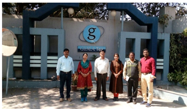
ICAR- CIRCOT Scientists Visit to Gima Tex, Hinganghat, Wardha (Maharashtra)