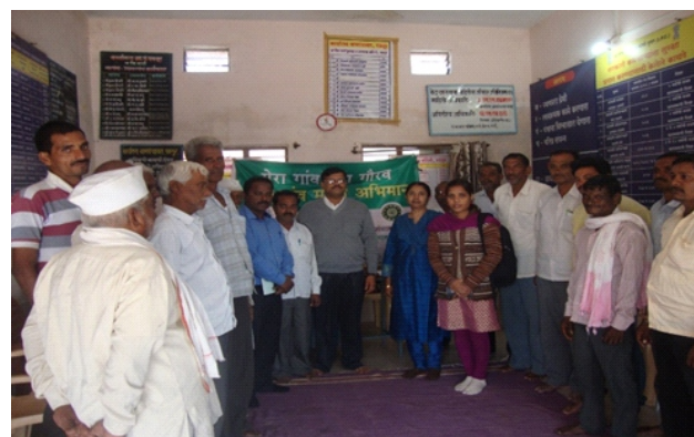
MGMG Programme at Pavnoor village, Wardha