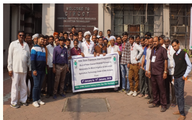
Group photo of farmers from Farmers Training Centre, Patan (Gujarat)