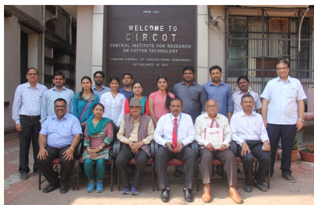
Group Photo – Training Programme on “Advances in Microscopy” during January 17-19, 2018