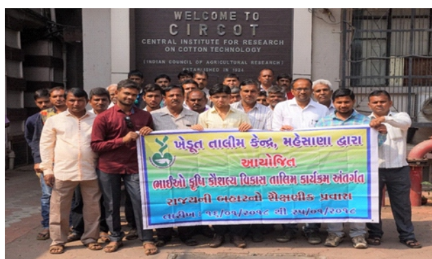
Group photo of farmers from Farmers Training Centre, Mehsana (Gujarat)