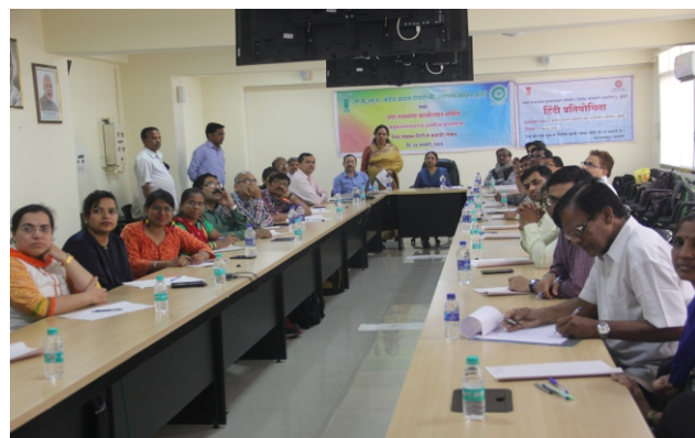
Hindi Story writing competition on shown picture

To promote use of official language, ICAR-CIRCOT Mumbai in collaboration with Town Official Language Implementation Committee conducted a competition "Story writing in Hindi on shown picture" on January 24, 2018. Twenty six participants from member offices participated in this event.