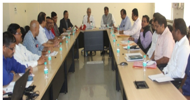
Internal review meeting of CRP on Natural Fibres at ICAR-CIRCOT