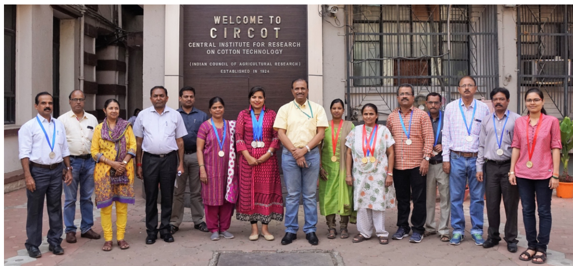
Medal Winners of ICAR Sports Tournament (West Zone) – 2017

Institute sports contingent participated in the ICAR Sports Tournament (West Zone)–2017 held at ICAR-CAZRI, Jodhpur from January 16-20, 2018. A team of 51 participants consisting of 43 men and 8 women players participated in various events- Volley ball, Table Tennis, Badminton, Carrom, Chess, Kabaddi, Basket Ball and Athletic events such as High jump, Long jump, Shot put, Javelin throw, Discus throw, races (100 mtr, 200 mtr, 400 mtr, 800 mtr, 1500 mtr) and Relay race. ICAR-CIRCOT stood 5 th amongst total 16 participating institutes with 4 gold and 9 silver medals. Director congratulate all Medal winners of the ICAR Sports Tournament (West Zone)–2017.