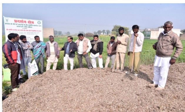
Farmers being demonstrated on “Preparation of bioenriched compost from cotton plant residue” at Shahpur Begu, Haryana