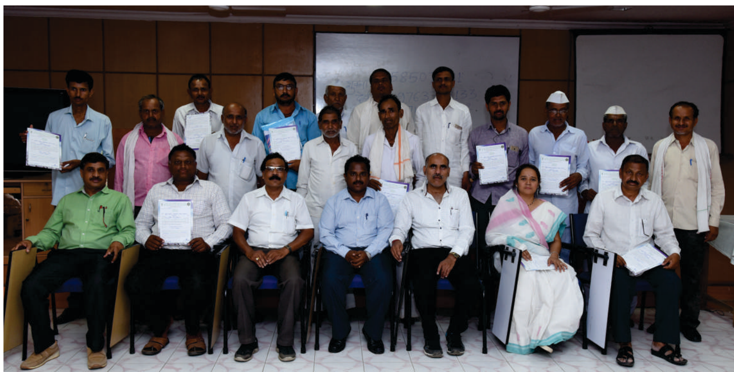
Training programme on “Increasing Farm Income through Increase in Production and Processing of Cotton at Village Level”

strategy for control of pink boll worm, biological inputs in cotton farming, pest and disease management techniques, cotton marketing, fibre quality parameters and by-products utilization. The training also covered practical sessions on pellets, compost and oyster mushroom production using cotton stalks and demonstration of Ginning, oil extraction and particle board preparation. Trainees were also taken for visits to ICAR-CCRI, Nagpur, M/s Neem Foundation, Gondkhairy, Tehsil- Kalmeshwar, Nagpur and M/s Ankur seeds Pvt. Ltd., NERI farms.