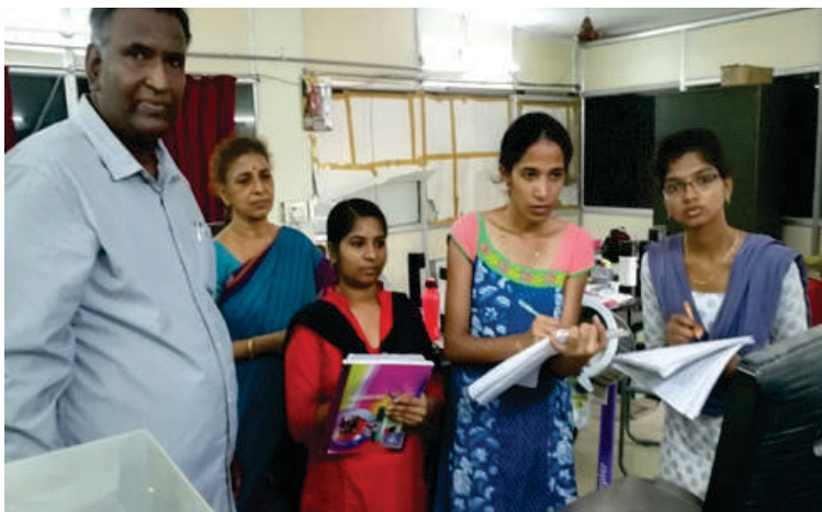
Students of Home Science College, ANGRAU visited CIRCOT's QE unit at Guntur