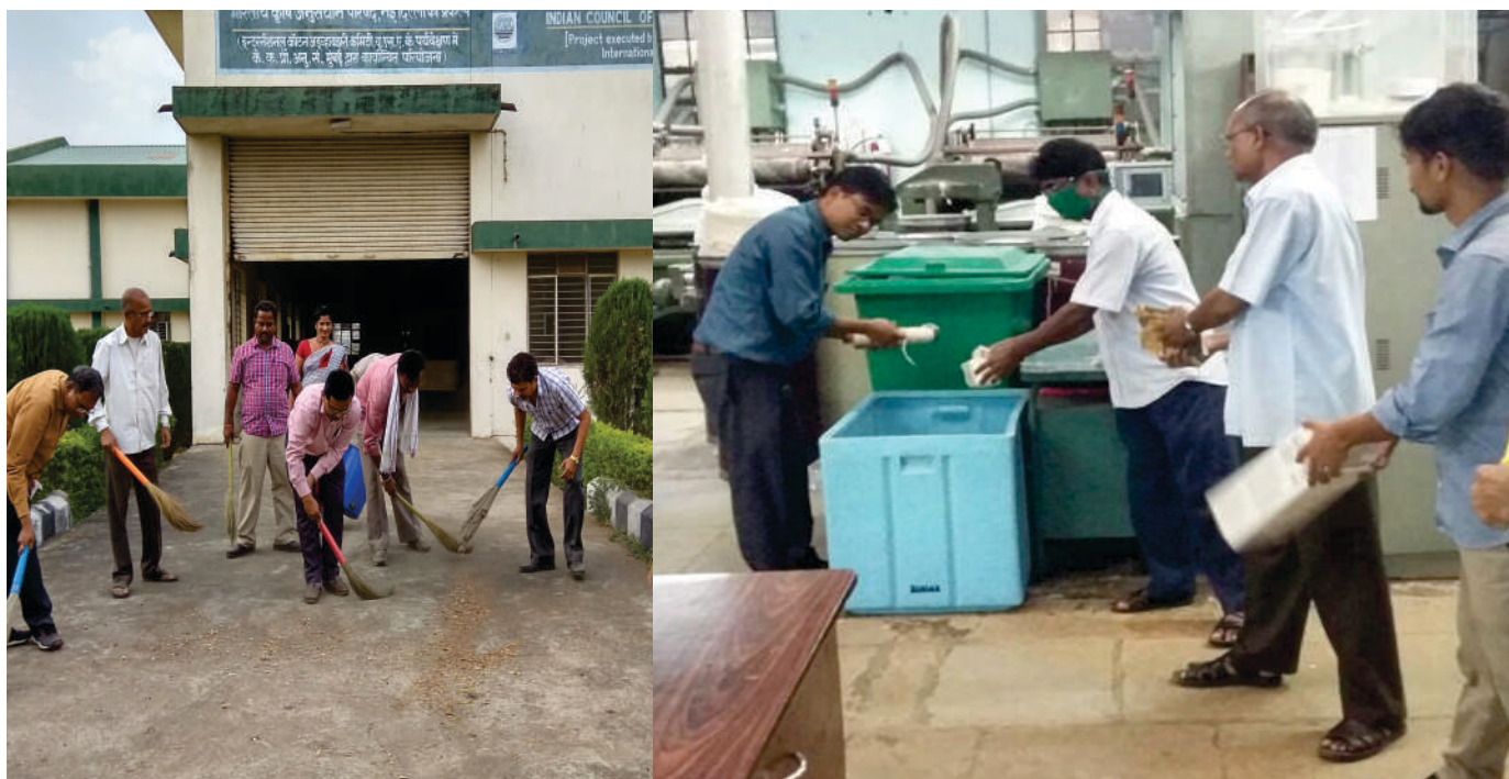
Cleanliness programme at GTC, Nagpur & MPD, ICAR-CIRCOT, Mumbai