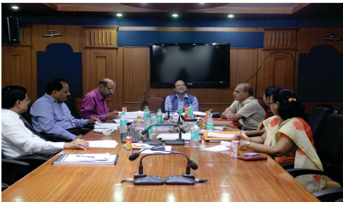
9 th QRT meeting being held at ICAR-CIRCOT