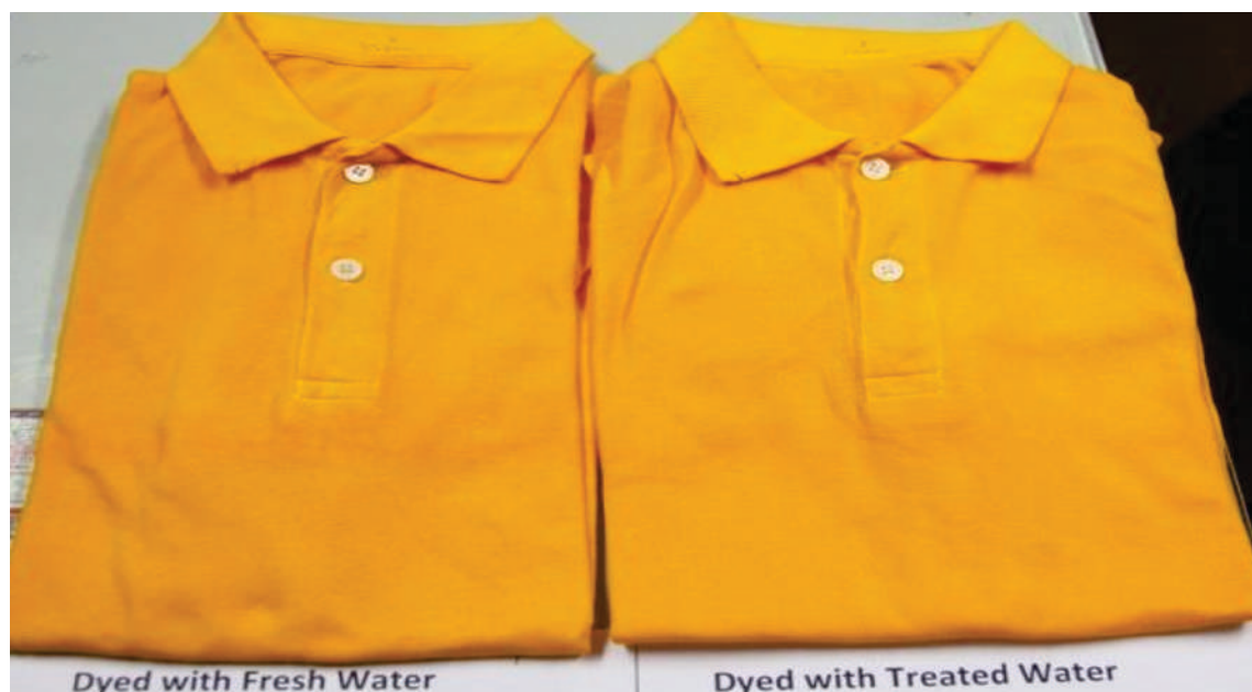
Fabrics dyed with treated and fresh water

along with a control dyeing using fresh water. The k/s value of the dyed fabric using treated water was 16.2 whereas that of fresh water dyed fabric was 18. There is no significant difference between the treated water and fresh water in terms of colour coordinates. The activated carbon based process can be used for removing the residual colour of the reactive dye effluent and the treated water can be reused for dyeing leading to water saving in textile dyeing process.