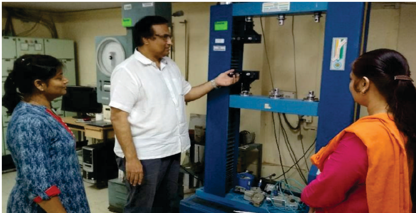
Trainees being demonstrated textile testing instruments