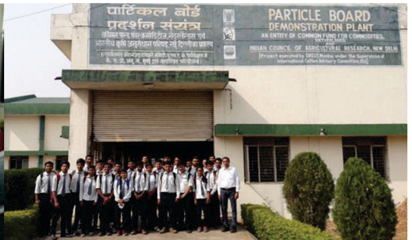
Students of S. B. Jain Institute of Technology, Management and Research visited GTC, Nagpur