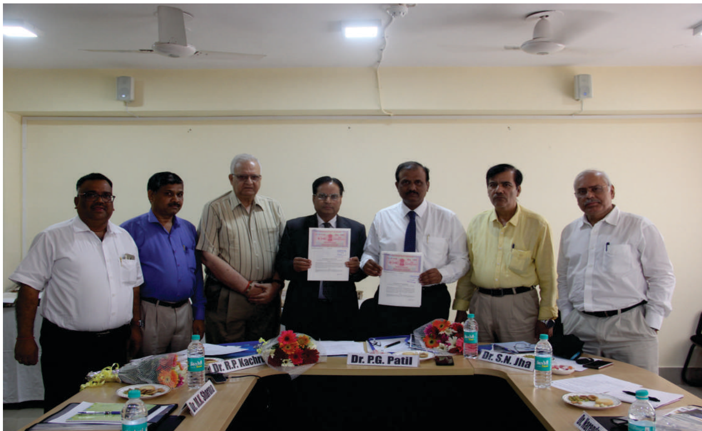
MoU signing with M/s Bajaj Steel Industries Limited, Nagpur

research on “Development of trash handling system for control of pink bollworm in cotton ginneries” on April 12, 2018.