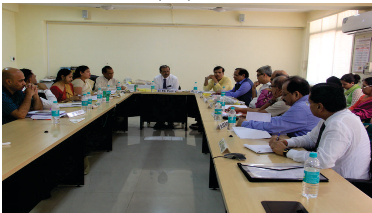
Joint meeting of QRT and IMC members at ICAR-CIRCOT