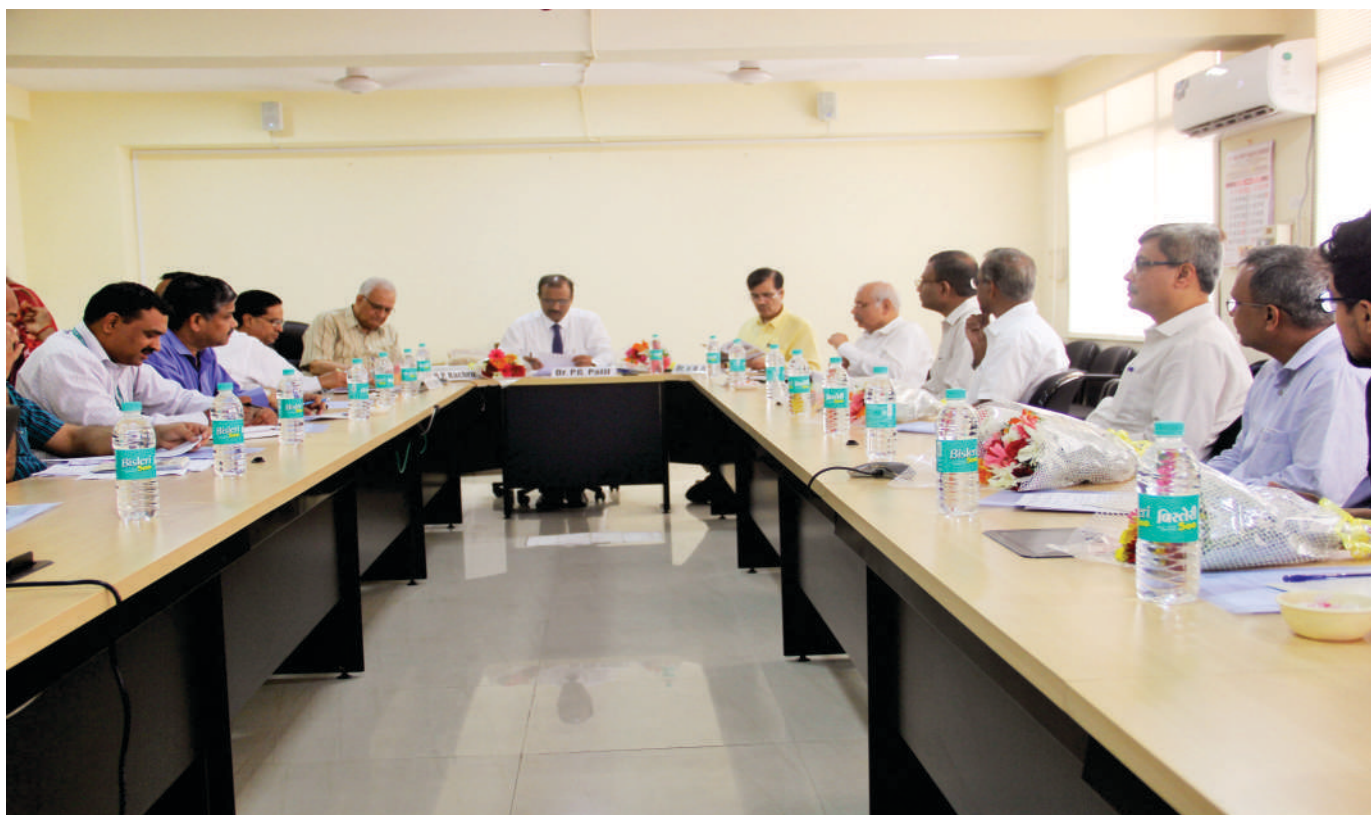
Second advisory meeting of ABI Centre at ICAR-CIRCOT

support received from the institute and their future plans.