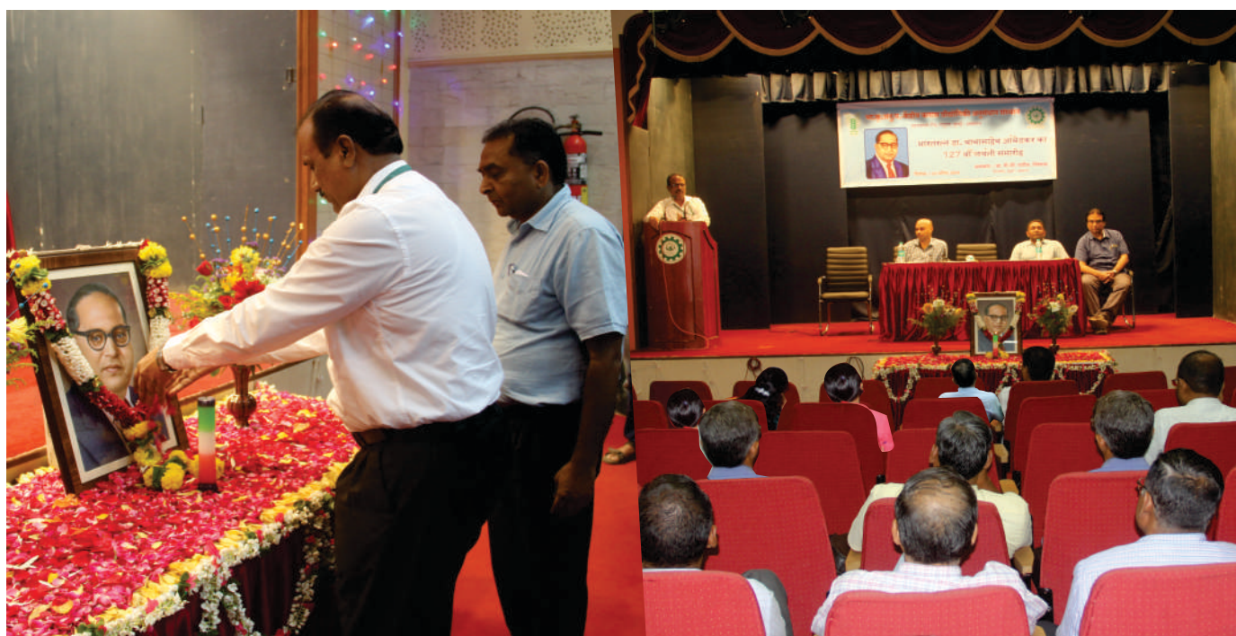
Dr. B. R. Ambedkar Jayanti Celebration at ICAR-CIRCOT