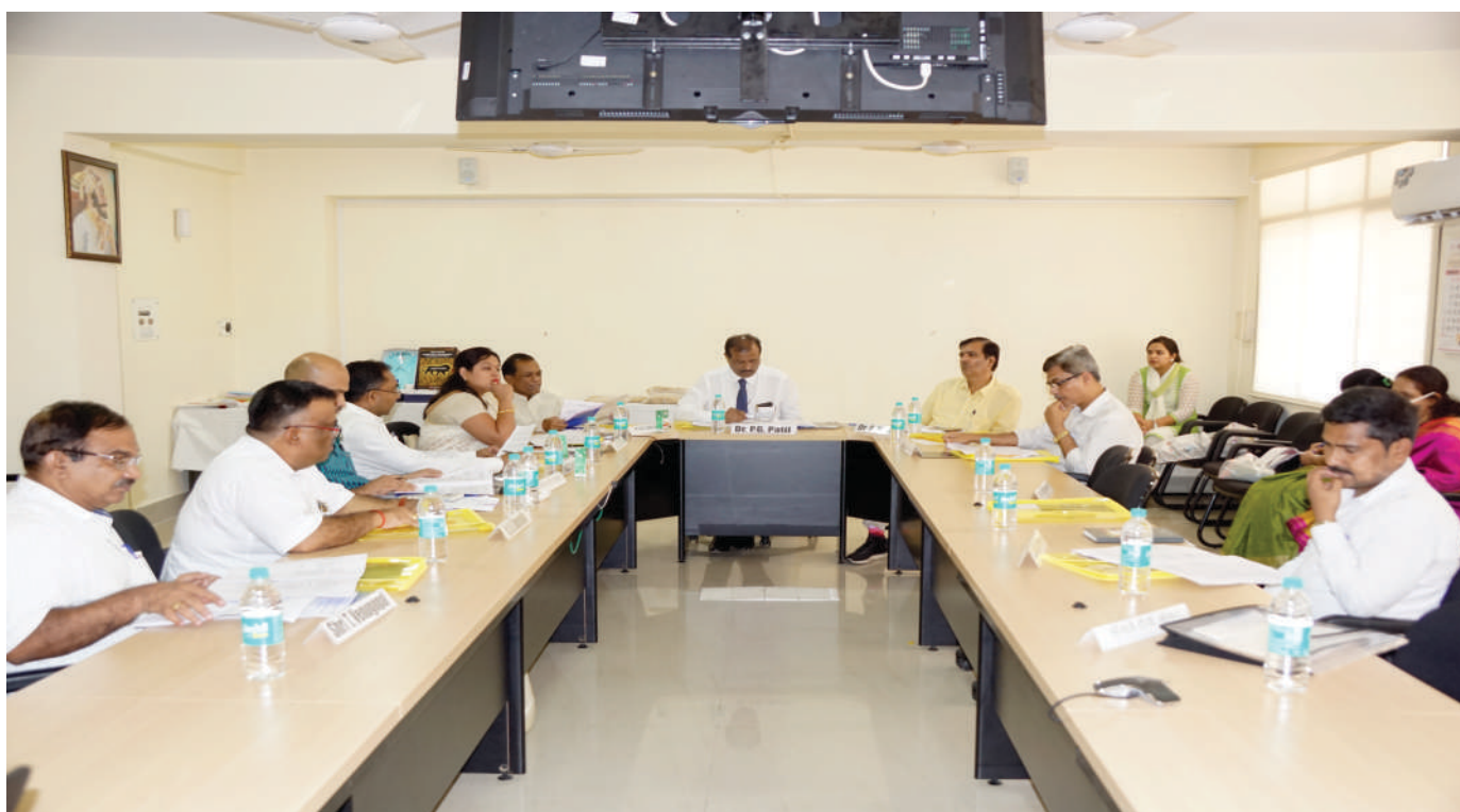
77 th IMC meeting being held at ICAR-CIRCOT

demand for additional fund for the year 2018-19, condemnation of old vehicles, approval of IMC for nomination of the Grievance Committee, approval of the IMC for Hospitals and report on the official implementation were discussed in the meeting.