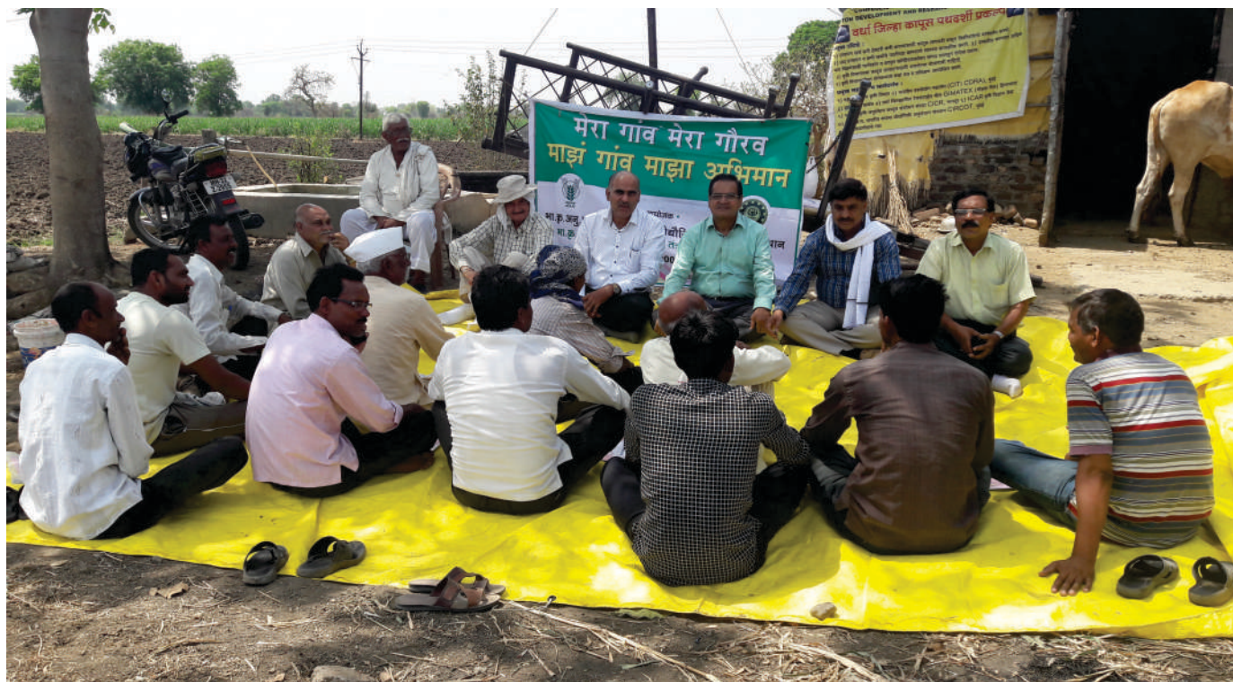
Kisan Gosthi organized at village Rehaki, of Wardha district

Yojana, Pradhan Mantri Krishi Sinchayee Yojana (PMKSY), Pradhan Mantri Ujjwala Yojana, etc.