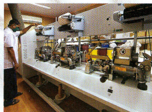
DREF Spinning Machine