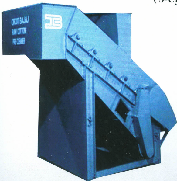
CIRCOT-BAJAJ Inclined Pre-cleaner (5-Cylinder)