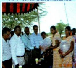
Seabass seed distribution to the WSHGs beneficiaries