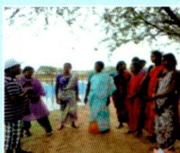
Motivating the WSHGs beneficiaries