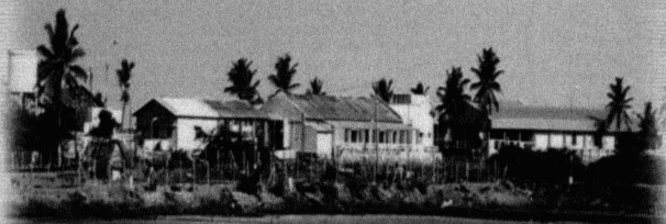
Muttukadu Experimental Station of CIBA