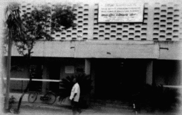
Kaddwip Research Centre of CIBA