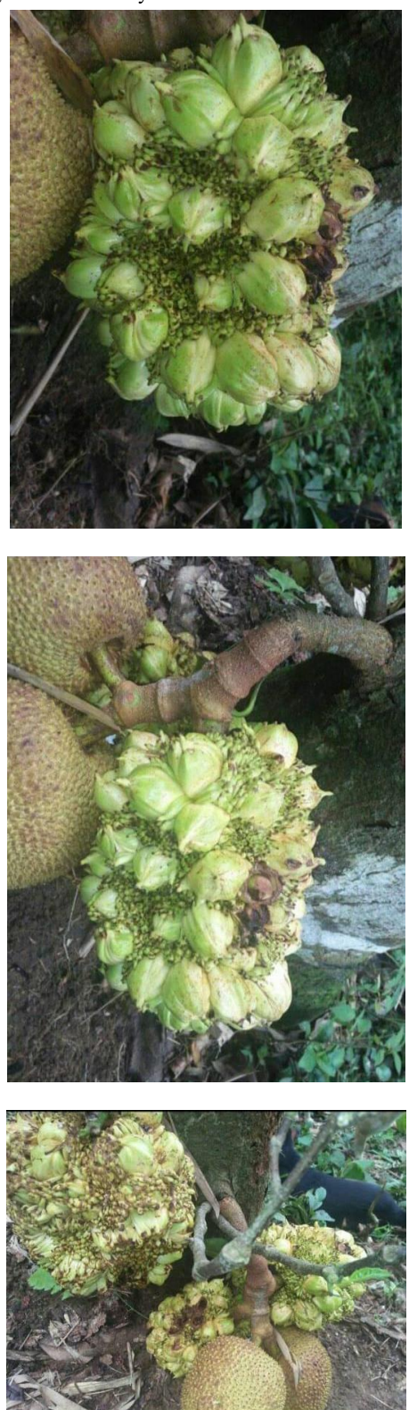
Plate 1. Malformation in fruits of jackfruit

availability to the plants, there may be an adverse effect on endogenous hormones such as auxin, leading to hormonal stress (Vanneste and Friml, 2013). Therefore, plants are required to adjust their size, shape, and number of organs for coping and survivability.