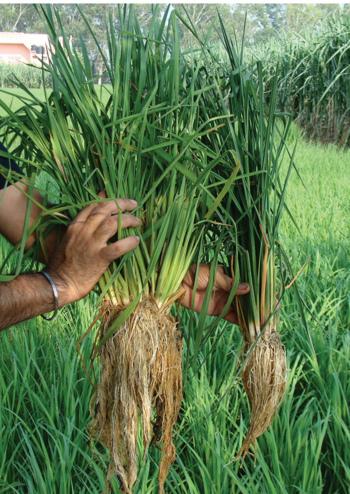
The pair of rice plants grown with the system of rice intensification (SRI) on the left vs. conventional methods on the right side