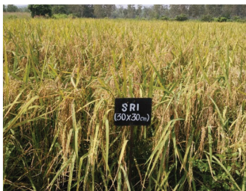
Only 7-9% of lodging in SRI after the storm