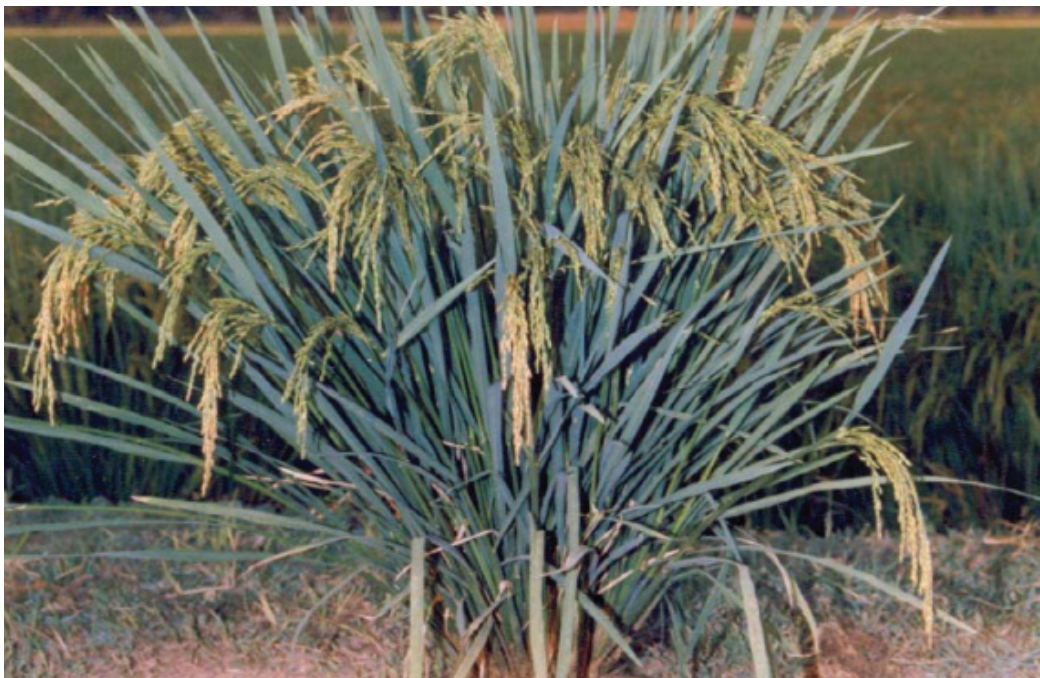
'Swarna' variety grown with SRI produced 84 Panicles in AP, India

farmer's practices (Thakur et al., 2023; Fig. 1). Assessment of large-scale evaluations in eleven countries revealed an average increase of 54% in grain yield under SRI management compared with recommended and farmers' practices, with a reduction in production inputs resulting in higher net income (Thakur et al., 2023).