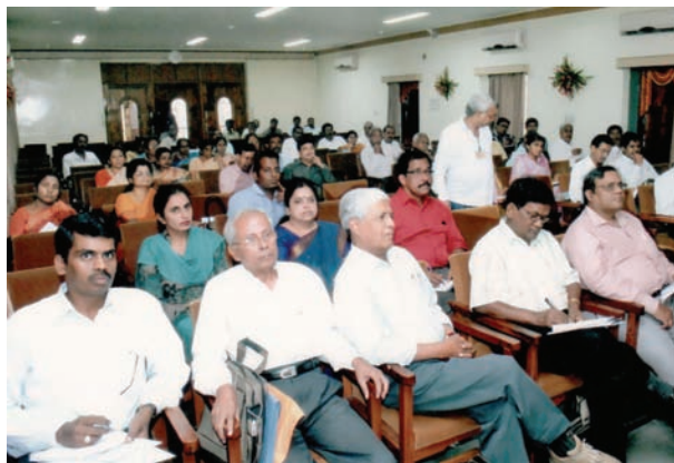
Participants of the XX Group Meeting of AICRP