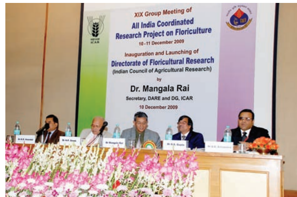
Inauguration and Launching of Directorate of Floricultural Research