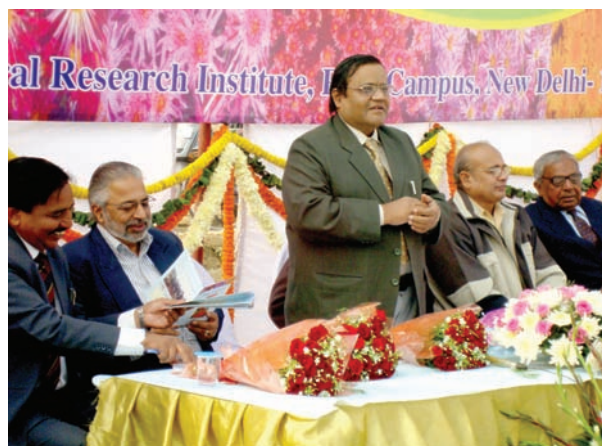
Chief Guest Dr. U.C. Srivastava, ADG (Hort-II), ICAR addressing the foundation day gathering

opportunities, it is vital to have a strong R & D in floriculture sector. It is in this direction, the Directorate of Floricultural Research has been established in XI Five Year Plan under Indian Council of Agricultural Research and formally launched on 10 December, 2009. It is indeed good that floriculture is not only an option of crop diversification but a means in itself for higher returns per unit area and increased (round the year) employment. Also, in these modern days where not only the youth, but the traditional farmers are preferring to white-collar jobs, floriculture, under protected conditions, value addition in the form of essential oils, dry flowers, etc. is not less than any officer job. The Directorate of Floricultural Research celebrated foundation day on 10 December, 2010, to commemorate its first year of establishment. Dr. U.C. Srivastava, ADG (Hort-II), ICAR was the Chief Guest of the function. The function was attended by former Project Coordinators (AICRP, Floriculture), Directors of various institutes, Heads of the Divisions (IARI), Scientists, Technical staff, Students, Press & Media. The Chief Guest appreciated the efforts made by the director within a short period of his