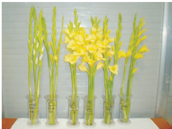
Spikes of gladiolus cv. Jacksonville Gold in vase for evaluation of keeping quality

(Kahikuchi), White Prosperity (Srinagar) and Phule Neelrekha (Pune). S2 stage (when 5-6 florets showed colour) were more suitable for storage.