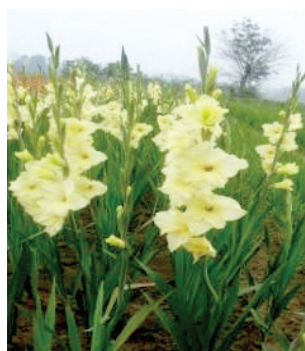
Punjab Lemon Delight