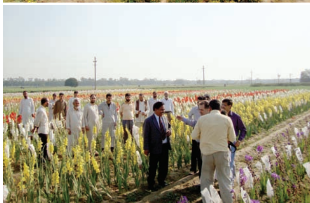
Farmers & Officials of Jammu & Kashmir visiting research farm during Pusa Krishi Vigyan Mela