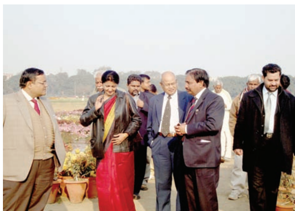
Members of maiden RAC meeting of Directorate of Floricultural Research