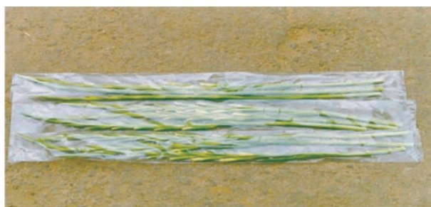
MA storage of cut spikes of gladiolus