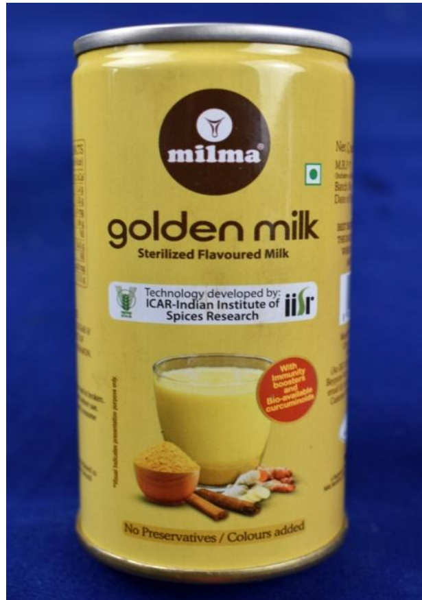
Fig. 1 Turmeric enriched spice flavoured dairy milk - Golden Milk Commercialised by MILMA