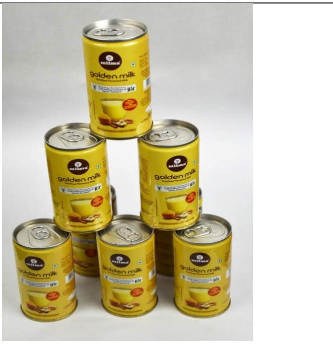
Marketed 'MILMA Golden Milk' in cans