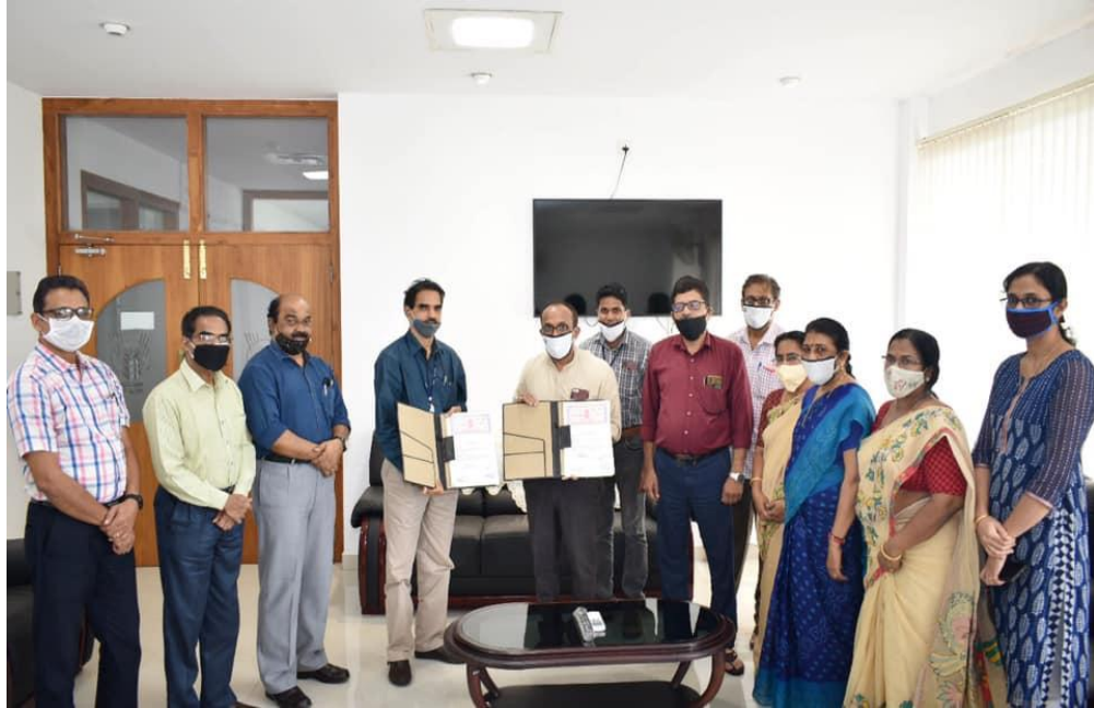
Fig. 2 Signing of MoU with Malabar MILMA on 21-8-2020 for transfer of technology