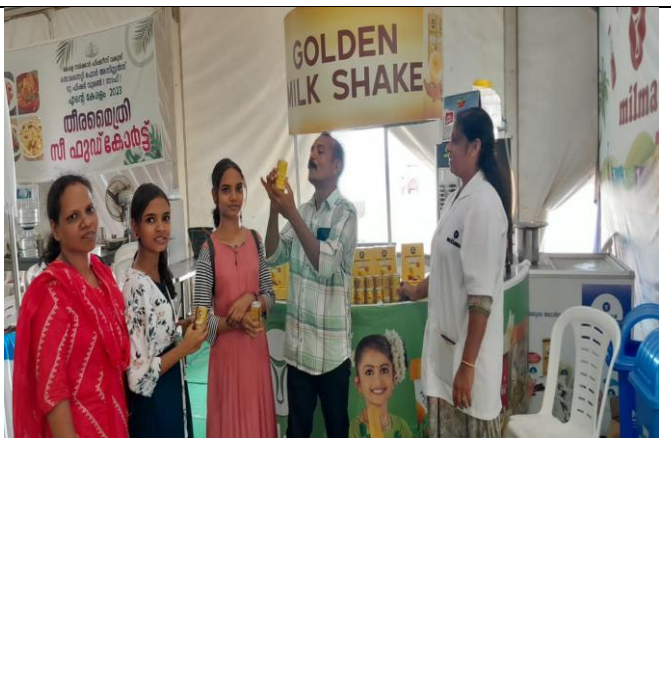
Public enjoying the drink during an exhibition 'Ente Keralam-2023' at Kozhikode on 19 -5-2023