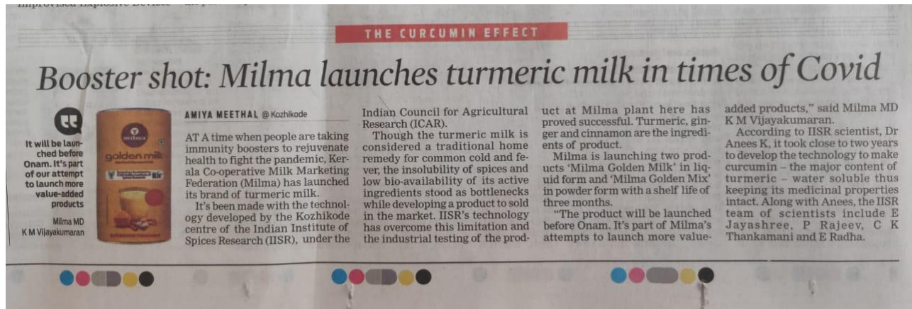
Fig. 4 Indian Express report on 23-8-2020