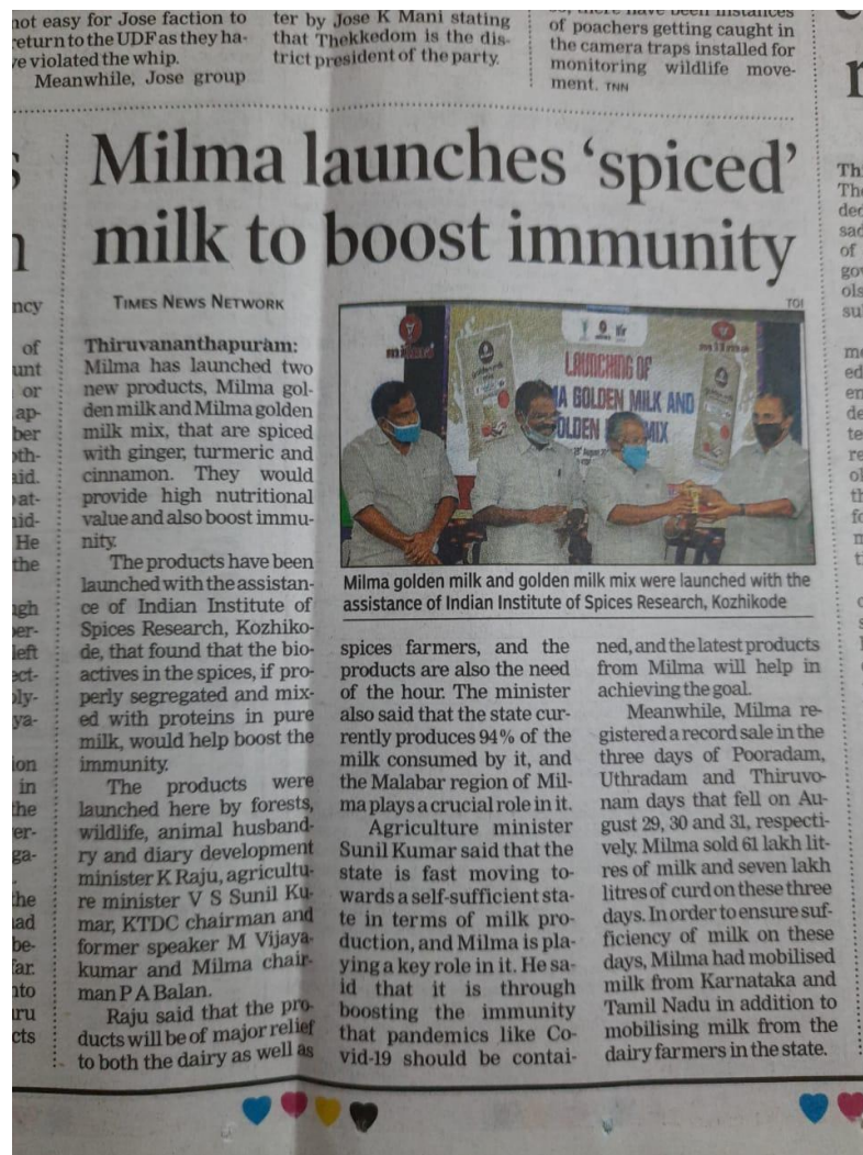
Fig. 5. Report in the Times of Indian 23-8-2023