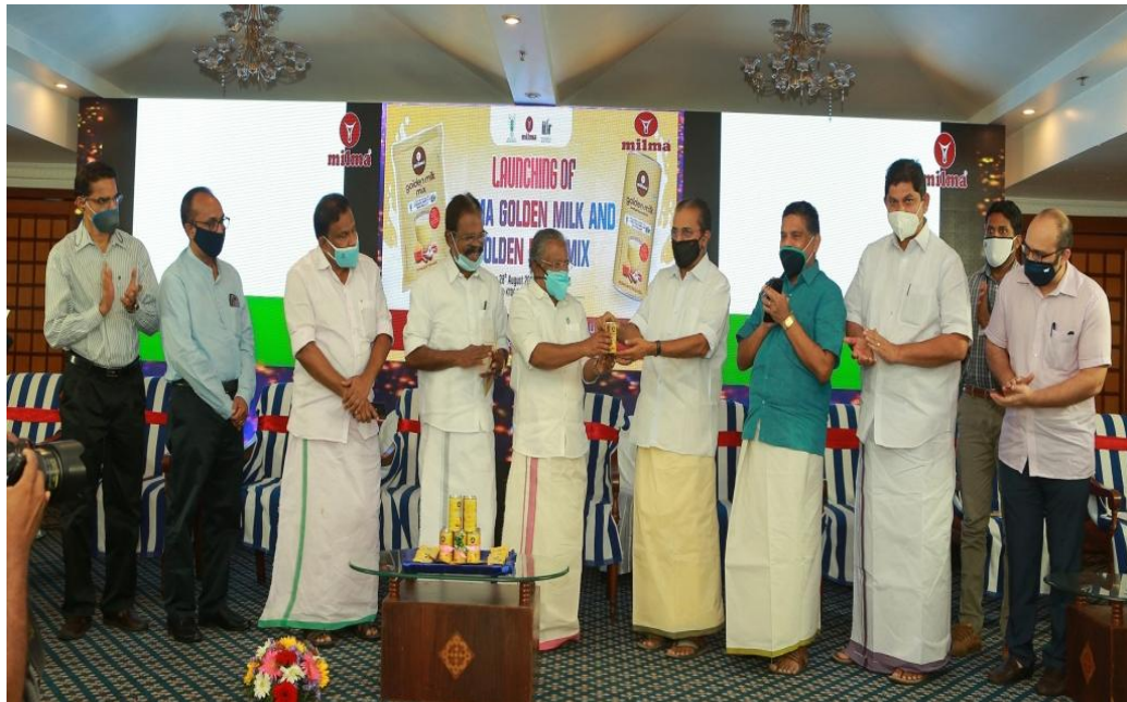
Fig. 3 The product was launched on 28 Aug 2020 at Thiruvananthapuram by Adv. K. Raju, Hon'ble Minister for Dairy Development, GoK in the virtual presence of Adv. V.S Sunil Kumar, Hon'ble Minister for Agriculture, GoK and Dr. A.K Singh, DDG (Hort. Sci.)