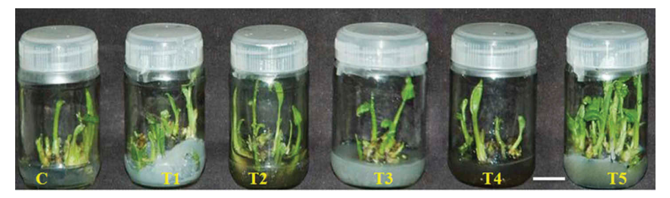
Figure 1. Effect of single use or combinations of low-cost gelling agent(s) on the number of shoots produced per explant in the banana cultivar 'Rasthali'. Sample C, control [0.70% (w/v) agar alone]; T1 [10.0% (w/v) sago]; T2 [3.0% (w/v) Isabgol]; T3 [9.0% (w/v) sago plus 0.04% (w/v) agar]; T4 [3.0% (w/v) Isabgol plus 0.08% (w/v) agar]; and T5 [5.0% (w/v) sago plus 1.5% (w/v) Isabgol].

In 'Grand Naine', the maximum number of shoots per plant (6.0) was produced in treatment T1 followed by the control (T6; 5.0), which agreed with the findings of <u>Nene and Sheila (1996</u>), who showed that sago performed better, except for the opaqueness of medium which reduced visibility to check for fungal growth under in vitro conditions. Lower concentrations of Isabgol (2.5 g l<sup>-1</sup>) produced fewer shoots per explant in all three varieties tested. This might be due to the reverse osmosis of carbohydrates from the explants to the gel rather than diffusion of nutrients and growth regulators from the gel to the