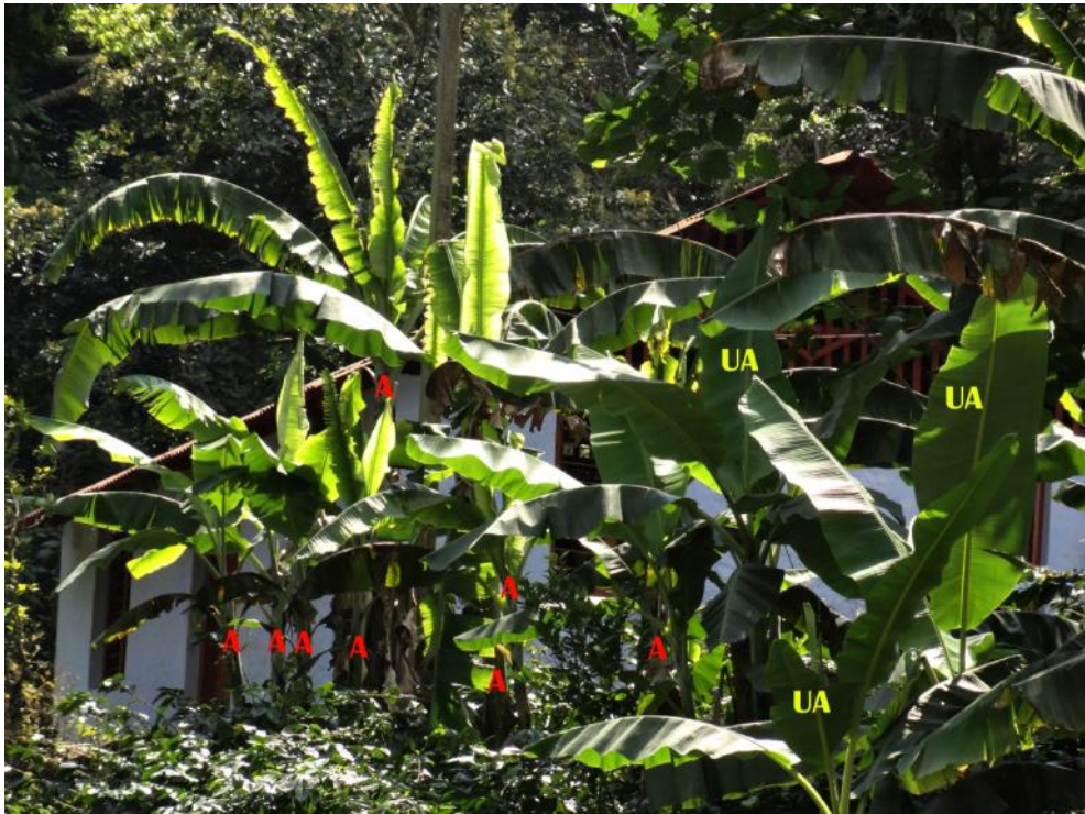
Figure 3. Typical symptom of banana bunchy top disease in Hill banana, BBT affected plant (A) and un-affected plant (UA) (BBTD).