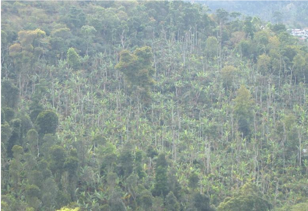
Figure 2. Banana bunchy top disease incidence in hill banana aerial field view at lower Pulaney hill range Western Ghats of Tamil Nadu in India.