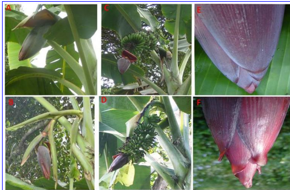
Figure 5. Reproductive stage of BBTV expression (A, C, E healthy plant and B, D, F infected plant with BBTV expression). (A) Normal and healthy bunchy emergence (B) Abnormal bunch emergence (C) Normal fruit development and growth of bunch (D) Small size fruit and slender growth of bunch (E) Male bud having compact bract (F) Loosen and bird mouth shape of the bract. Source: Elayabalan, 2010