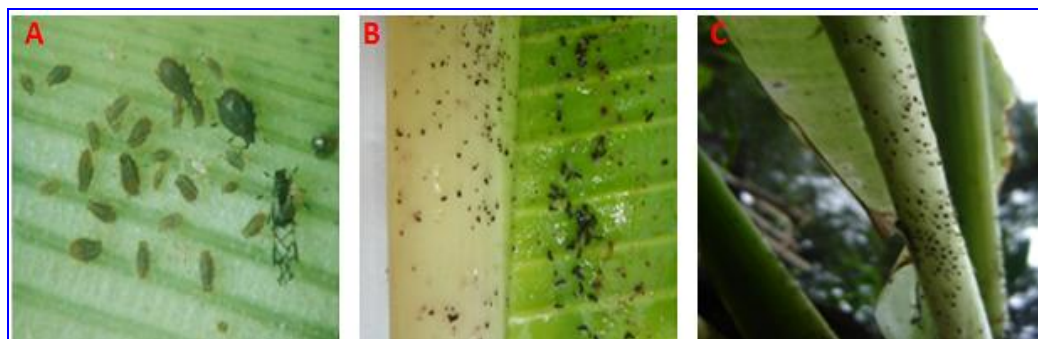
Figure 6. Banana aphid ( Pentalonia nigronervosa ). (A) Aphids colony's –Nymph, Adult and winged aphid (B) Aphids with honey dew and ants (C) Aphids on the cigar leaf and leaf sheath.