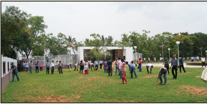
As a part of Swacchh Bharat Mission, cleanliness drive was organized at ICAR-NIVEDI campus during 22-28 th July, 2015.