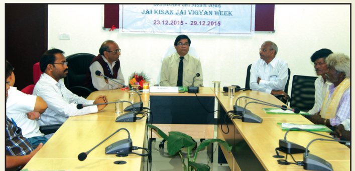
Farmers-Scientists Interaction meet was organised at ICAR-NIVEDI as part of Jai Kisan Jai Vigyan week celebration on 29 th December, 2015.