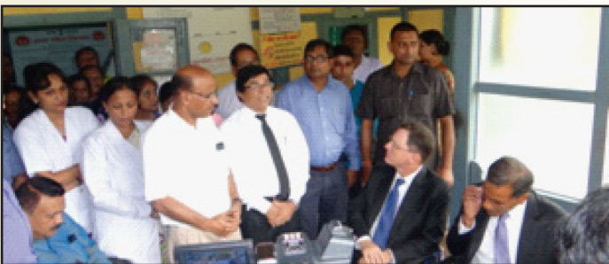
His Excellency Mr. Richard Verma, Hon'ble US Ambassador to India interacting with Medical and Veterinary Officers, and Farmers about the brucellosis in Guwahati, Assam on 1 st September, 2015.