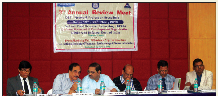
Third Annual Review meet of DBT Network Project on Brucellosis was organized at Defence Food Research Laboratory, Mysuru during 19-20 th November, 2015.