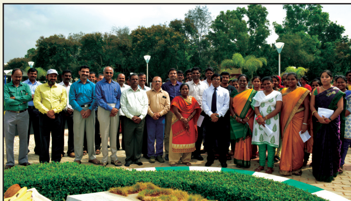
Kannada Rajotsava was celebrated on 2 nd November, 2015 at ICAR-NIVEDI and various competitions were organized during the occasion.