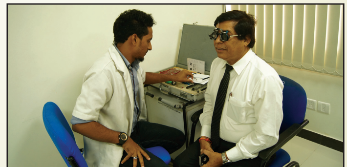
Insite Foundation Day of ICAR-NIVEDI was celebrated on 1 st July, 2015 and various events were organized for the staff members. An eye camp was organized for ICAR-NIVEDI Staff from Dr. Agarwal's Eye Hospital on the occasion.