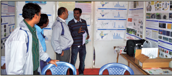
ICAR-NIVEDI, participated in the Krishimela organized at UAS, GKVK, Bengaluru during 19-22 nd November, 2015 and exhibited the technologies for the benefit of farmers and other stakeholders.