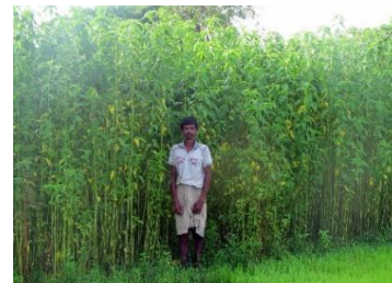
Fig. 4. Jute field of tribal farmers at Dakshin Dinajpur

Improved microbial retting of jute by 'CRIJAF Sona' With an aim to get better quality jute fibre, improved microbial retting technology using 'CRIJAF Sona' was introduced among the tribal jute farmers of the studied 3 blocks of Dakshin Dinajpur. The retting technology could able to complete the jute retting within 11-13 days, which was about 6-8 days less than the conventional jute retting