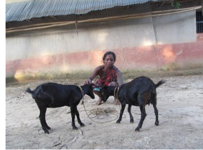
Fig. 17. Destitute tribal farm women are happy with her goats provide under TSP activity