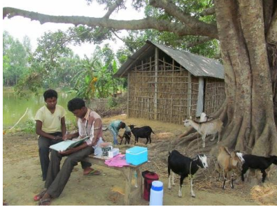
Fig. 16. Local tribal youths were educated on animal health management