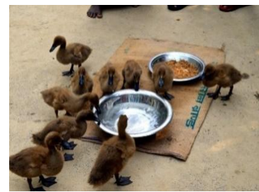
Fig. 15. Khaki Campbell breed of ducks was introduced