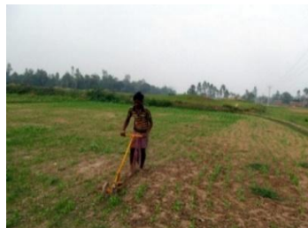
Fig. 3. Weed management in line sown jute by CRIJAF nail weeder at Tapan block