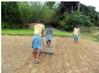
Fig. 2. Sowing of jute in line by seed drill at Dakshin Dinajpur

higher than farmers' practice (Rs. 8,028/ha). Unlike pre-intervened period, the jute crop totally escaped stem rot disease, might be due to application of Zn and B in soil which are deficient in the soils of Dakshin Dinajpur district.