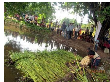
Fig. 7. Demonstration on improved microbial retting of jute

As the paddy productivity of the district (2.8 t in Aus , 4.2 t in Aman and 4.9 t in Boro ) are very close to states average (3.5 t for Aus , 3.9 t for Aman and 5.1 t for Boro ) and the farmers are already following improved production technologies for paddy crop, so paddy was not considered under this programme for the district. After harvest of jute and paddy, farmers of Dakshin Dinajpur prefer to grow mustard in rabi season as their main source of vegetable oil for their own use and for sale. To continue their economic progress from cultivation, improved production technology of mustard was provided to the farmers of Dakshin Dinajpur. Very essential inputs like certified seed of mustard, fertilizers and plant