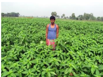
Fig. 5. Luxuriant jute crop in a tribal farmer's field at Kumarganj block

method. The jute fibre so obtained was at least 1-2 grade higher and the farmers earned additional amount of Rs. 1350 per bigha (i.e., Rs. 10,090/ha) by selling the quality fibre in the local market. Analysis of the farmers' feedback data revealed that about 90% of the farmers were satisfied with the efficiency and ease of the improved retting technology.