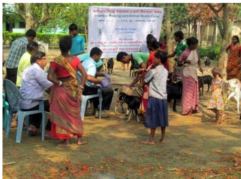
Fig. 11. Goat vaccination camp at Tapan block

farm families as the same given the highest NRPRI (3.84).