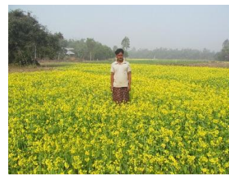
Fig. 10. Mustard field of tribal farmer at Hili block