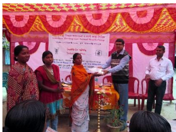
Fig. 13. Distribution of mineral mixture among the tribals for their cattle

participation of tribal farm women. In addition to ducks, poultry birds (RIR breed) were also provided to other sets of tribal farm women. To keep the poultry birds healthy, all the growing chicks of the improved rural breed were vaccinated against Rani Khet disease with F-strain live vaccine. To empower the tribal women in this line, they were also trained number of times about poultry vaccination schedule, dose and its application. From such small scale duck rearing activity the tribal farm women added the family income by Rs. 3495. The family members consumed about 193 eggs from their own produce. The NRPRI was quite high (3.56) in case of duck rearing by the tribal farm women.