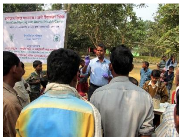
Fig. 14. Animal health camp and vaccination camp