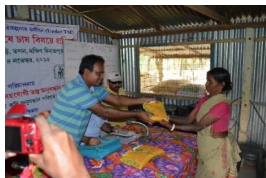
Fig. 9. Distribution of certified seed of mustard among the tribal farmers of D. Dinajpur