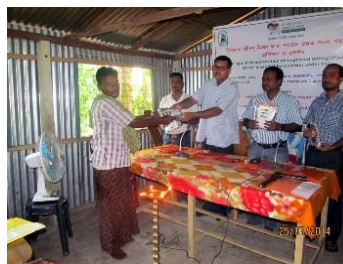
Fig. 6. Training on improved microbial retting by 'CRIJAF Sona'