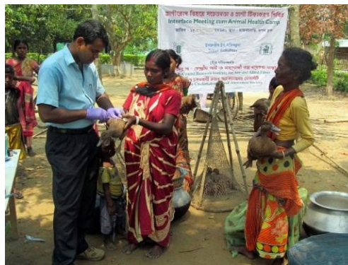
Fig. 12. Duck vaccination and educating the tribal women about vaccination