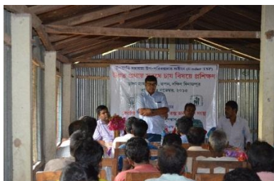
Fig. 8. Training of tribal farmers on improved mustard production technology