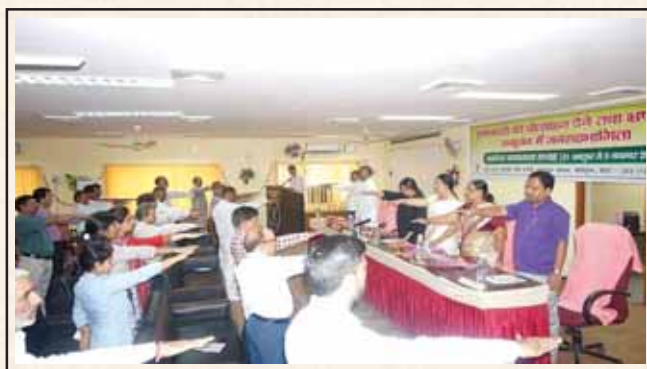
Photo: Guests and employees of ICAR-IIFSR administering pledge on vigilance

were organized during the week. The concluding programme was held on 5 November 2016 in which certificates were distributed to awardees and participants of various programmes. Based on the activities and commitment made by ICAR-IIFSR in the form of pledges, sensitization workshops and various other activities, Central Vigilance Commission (CVC) has issued Certificate of Commitment to ICAR-IIFSR.