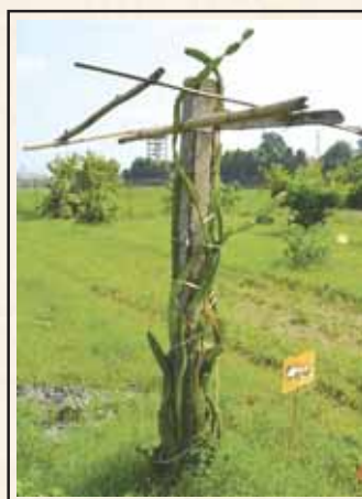
Photo: A full grown plant of dragon fruit