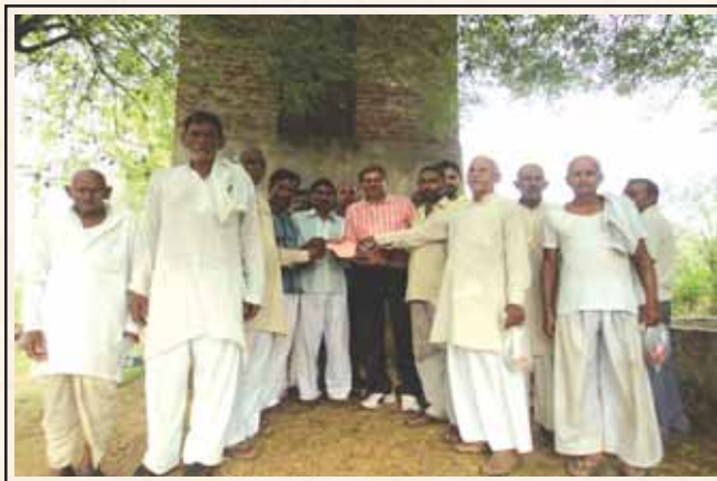
Photo: Scientists of IIFSR training farmers for release of Trichocards

in sugarcane, wheat, pulses, oilseeds, vegetables and other crops. More than 250 farmers were advised for improved cultural practices for improving the profitability from their fruit orchards.