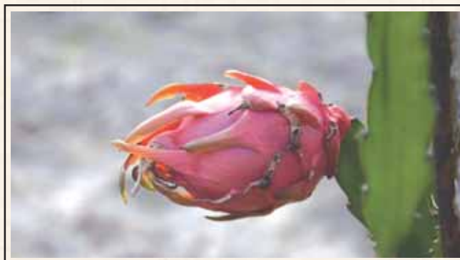
Photo: Mature fruit of Dragon fruit

fruit crop at experimental farm of our Institute. Two type of germplasms (white pulped and red pulped) of this fruit crop were introduced from Maharashtra. Rooted cuttings of 8-10 inch length were planted with the support of cemented pillar during August 2014.