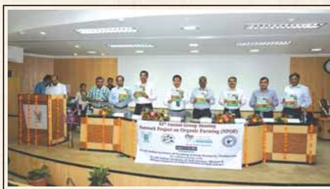
Photo: Release of publications by dignitaries during NPOF group meeting

During the first two days, review of on-going programmes and modification of technical programme was taken up beside a round table discussion on researchable issues in IOFS. On 19 August 2016, interface meeting of NPOF and selected AICRP on IFS centres with ICAR-Directorate of Weed Research, Jabalpur was held