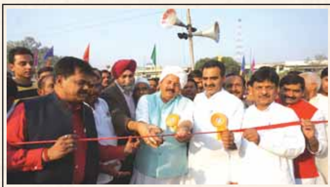
Photo: Inauguration of Krishi Kumbh-2016 by Hon. Minister Dr. Sanjeev Kumar Balyan and other dignitaries

ICAR-Indian Institute of Farming Systems Research, Modipuram, Meerut (Uttar Pradesh) organized a three days Regional Agriculture Fair ( Krishi Kumbh-2016 ) from 28-30 November, 2016 in the ground of Government Inter College Muzaffarnagar, U.P. The programme was inaugurated by Hon. Minister of State for Water Resources, River Development and Ganga Rejuvenation, Govt. of India, Dr. Sanjeev Kumar Balyan on 28.11.2016 in the presence of progressive farmers and farmer leaders. About 10000 farmers from seven states viz. U.P., Uttarakhand, Punjab, Haryana, Gujarat, Jammu and Kashmir and Telangana participated in the Fair. Dr. J.S. Sandhu, DDG (Crop Science), ICAR, New Delhi, Chaudhary Naresh Tikait, President, Bhartiya Kisan Union , Shri Ghashiram Nain, Hon. M.P. Shri Raju Shetty, Shri V.M. Singh and Hon. MLC Shri Kapildev were Guests of Honour during the inaugural function. In his inaugural speech, Hon. Minister Dr. Sanjeev Kumar Balyan expressed his pleasure for organizing such a big farmers fair in the agriculturally prosperous district of Muzaffarnagar