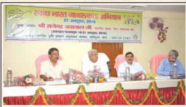
Photo: Hon. M.P., Meerut Sh. Rajendra Agrawal and other dignitaries during Swachh Bharat Jagarukta Abhiyan organized by ICAR-IIFSR

The Institute also organized a mega event on cleanliness campaign in the institute premises on 27 October, 2016. In this event, about 200 students from different schools of Meerut participated in the Clean India Awareness Camp. For the school children, a painting competition on the theme 'Clean City Clean India' was organized and prizes were given to the four best paintings adjudged under different categories of the students. In this event the Hon. M.P. from Meerut Sh. Rajendra Agrawal was the Chief Guest. The school children along with the staff members of the IIFSR and the chief guest participated in general cleanliness activities on the national highway adjoining the IIFSR campus. The chief guest himself took the broom and inspired others for maintaining cleanliness in the surroundings. In his keynote address Sh. Rajendra Agrawal highlighted the need for proper disposal and treatment of city garbage so as to make the city clean and green. He praised the efforts made by IIFSR, Modipuram towards implementing the Clean India Mission on a wider scale.