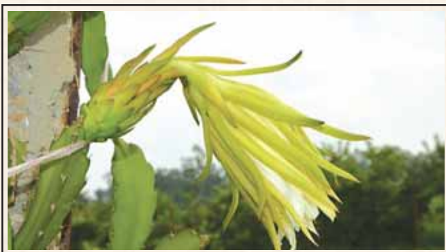
Photo: Flower of Dragon fruit