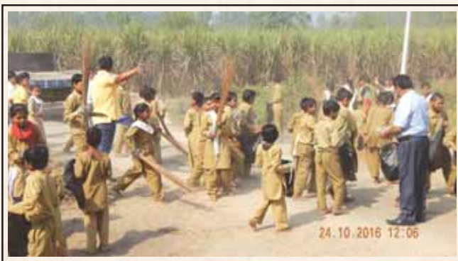
Photo: Participation of School childrens and villagers in Swachhta campaign organized by ICAR-IIFSR

The Institute also organized a mega event on cleanliness campaign in the institute premises on 27 October, 2016. In this event, about 200 students from different schools of Meerut participated in the Clean India Awareness Camp. For the school children, a painting competition on the theme 'Clean City Clean India' was organized and prizes were given to the four best paintings adjudged under different categories of the students. In this event the Hon. M.P. from Meerut Sh. Rajendra Agrawal was the Chief Guest. The school children along with the staff members of the IIFSR and the chief guest participated in general cleanliness activities on the national highway adjoining the IIFSR campus. The chief guest himself took the broom and inspired others for maintaining cleanliness in the surroundings. In his keynote address Sh. Rajendra Agrawal highlighted the need for proper disposal and treatment of city garbage so as to make the city clean and green. He praised the efforts made by IIFSR, Modipuram towards implementing the Clean India Mission on a wider scale.