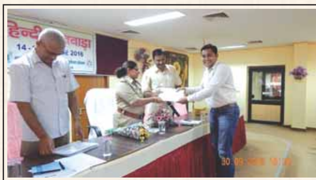
फोटो: हिंदी पखवाड़े के दौरान माननीय निदेशक एवं मुख्य अतिथि द्वारा विजयी प्रतिभागियों का सम्मान