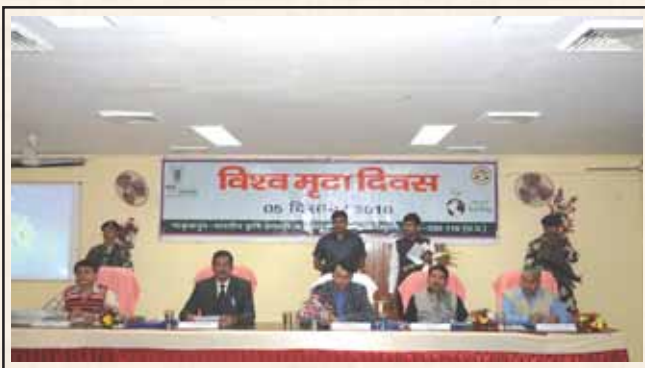
Photo: Hon. MLA. Sh. Sangeet Som during World Soil Day organized by ICAR-IIFSR, Meerut

improving its physical, chemical and biological properties by the application of organic matter, proper use of resources and control on pollution. On this occasion, 200 Soil Health Cards were distributed to farmers by the chief guest. Deliberations were also made by other scientists on the importance of soil health for our life and proper ways for maintaining the soil health. It was very interactive session and students, teachers and farmers shown their keen interest.