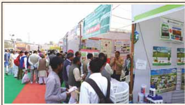
Photo: Visit of stalls by the Farmers in Krishi Kumbh-2016