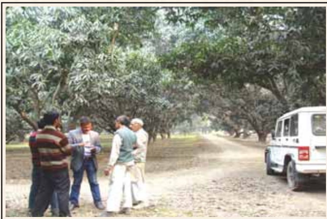
Photo: Scientists of IIFSR visiting Mango orchards of local farmers