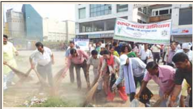
Photo: Dignitaries and other participants cleaning market and residential areas

that the message could be easily disseminated on account of already developed rapport with the villagers. The AICRP-IFS centres of the Institute also organized 'Swachhata Pakhwara' during the period and extended the message of Swachh Bharat Abhiyan to their local areas. By this way, ICAR-IIFSR extended cleanliness campaign to almost wider parts of the country.