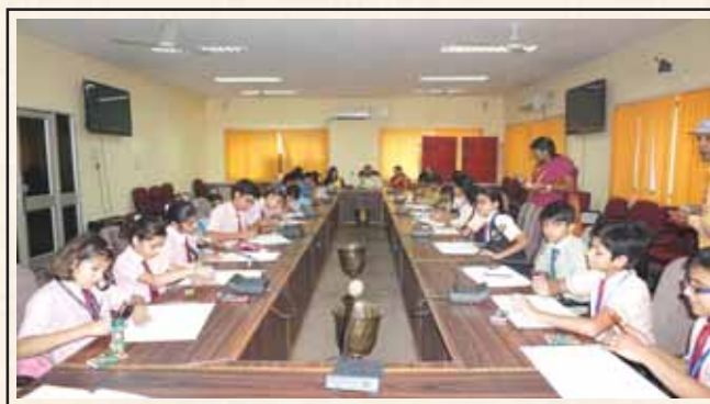
Photo: Painting competition organized for School childrens at ICAR-IIFSR during Swachhta Pakhwara

The Institute also organized a series of cleanliness drive in the adopted villages. For this purpose the village schools were selected as key site where the school children were involved in the programme in consultation with the school principal and village pradhan and a painting competition for school children on the topic 'Swachh Gaon Swachh Bharat', cleaning of school premises and surroundings was organized besides gothi on general cleanliness. Ten prizes were given for best paintings in each school. Besides, each school was donated a dustbin, 20 brooms and cleaning material by IIFSR in order to motivate the students and teachers towards maintaining cleanliness. In this series the first programme was organized in Assa village of Mawana block, Meerut district on 24 October, 2016 followed by similar programmes on 28 October, 2016 in Jaitpur village of Budhana block, Muzaffarnagar district, Palri village of Barnauli block, Baghpat district and Mohamandpur village of Narsan Block, Haridwar district. In each of these programmes about 200 school children and about 100 villagers participated and the team of scientists from IIFSR Modipuram guided in maintaining general cleanliness in school and villages.