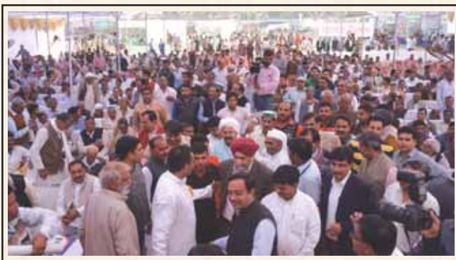
Photo: Hon. Minister Dr. Sanjeev Kumar Baliyan interacting with farmers during Krishi Kumbh-2016