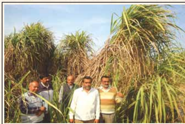
Photo: Farmers of Mandawali village with their healthy sugarcane crop and scientists from IIFSR in the field

recommended one (150kg/ha). Application of phosphorus was more or less in the range of recommended range (60kg/ha). However, there was almost nil application of potash and micronutrients (sulphur, zinc, and iron). Imbalanced use of fertilizers was also linked with heavy infestation of insect-pests and diseases in sugarcane. The major insect-pests of sugarcane were early shoot borer ( Chilo infuscatellus ) and top borer ( Scirpophaga excerptalis ) were responsible for heavy damage of crop and ultimately the yield losses to the tune of 20-30%. Recently a new emerging disease of sugarcane known as Pokkah boeng was also noticed in many fields of sugarcane. Farmers of the village were helpless in managing the pests and were dependent on local pesticide dealers whose major intension was to make profit by providing substandard quality of pesticides without giving any recommended advisory. This also led to the heavy application of