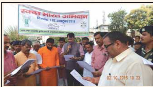
Photo: Swachhta pledge by Hon. MLA Sh. Sangeet Som, employees of ICAR-IIFSR and other participants

As a part of activities the Institute organized 'Swachhata Pakhwara' during 16-31 October 2016. In this Pakhwara a series of cleanliness activities were organized to create awareness among different sections of the society. These activities included cleanliness drive in the Institute premises, surroundings and adjacent area, cleanliness drive in the local market, residential area, schools in the city and adopted villages, cleanliness campaign at national level through AICRP-IFS centres located in all Agro-climatic zones and a mega event in the institute. In all the activities public representatives/ local leaders were involved to ensure the spread of cleanliness message among wider sections of the communities.