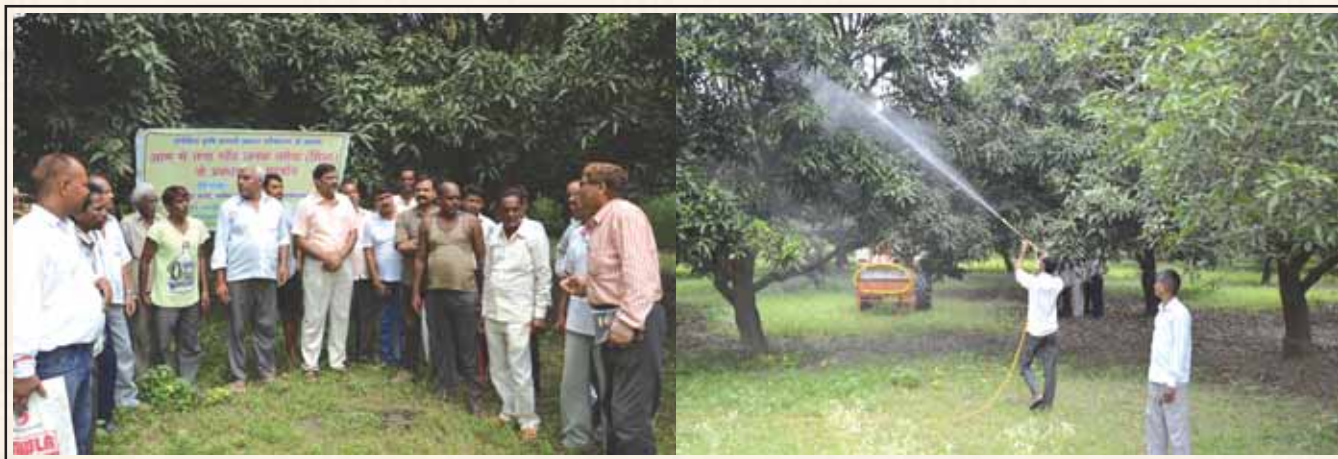
Photo: Training and demonstration on management of mango shoot gall psylla to orchard owners and contractors by ICAR-IIFSR

of shoot gall psylla; integrated nutrient and pest management in mango by the experts of the Institute. A live demonstration for the safe use of pesticides for managing mango shoot gall psylla was also organized during the training.