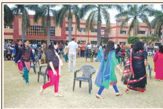
Photo: Employees of IIFSR and their family members participating in sport events during independence day

ments of the institute during past year and appealed the officials to raise the institute to a new height and serve the nation through our new research in the arena of integrated farming systems. It was emphasized that food and nutrition security at household level especially small, marginal and landless farmers has to be achieved. The message of cleanliness and hygiene was also the point of emphasis. Different recreational activities like Tambola, tug of war, musical chair, volleyball etc. were also arranged during the occasion which was largely enjoyed by staff and their family members.