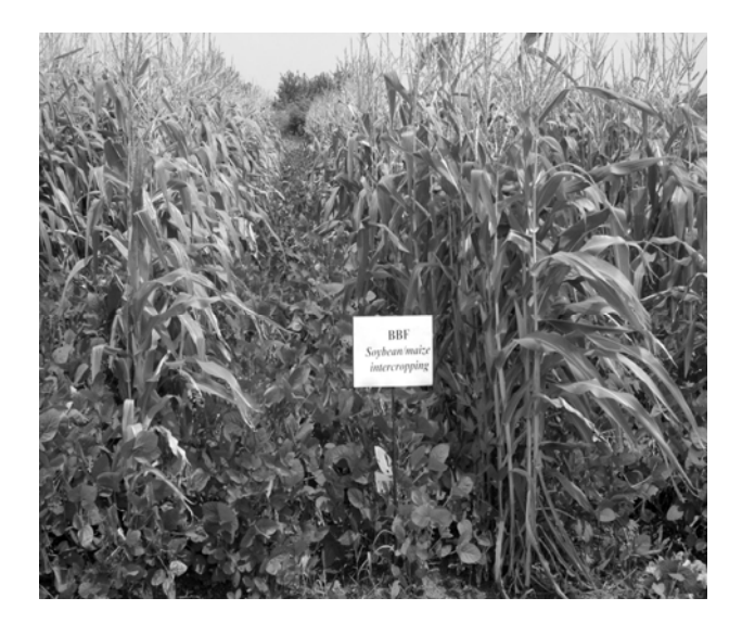
Plate 1. Soybean-maize intercropping on broad-bed and furrow (BBF) system.