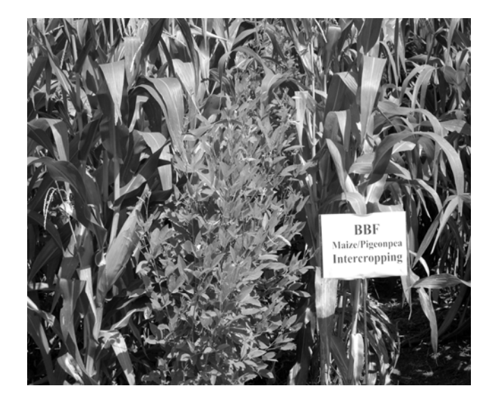
Plate 2. Maize-pigeonpea intercropping on broad-bed and furrow (BBF) system.

maize was also greater in BBF than FOG. In 2003-04, though maize population in soybean/maize intercropping was similar to the sole maize, maize yield was reduced in intercropping by 203 and 244 kg ha<sup>-1</sup> in BBF and FOG, respectively. For other years, maize yield in soybean/ maize intercropping was lower than the sole maize because of reduced plant population, almost half of the sole maize population. In maize/ pigeonpea intercropping, maize population was similar to the sole maize, as pigeonpea was intercropped with maize in the additive series (Plate 2). This trend was observed in every year since 2004-05. Better crop growth in terms of leaf area index (LAI) was observed in BBF. LAI of maize reached its maximum at 2.68 in soybean/maize intercropping under BBF and 2.55 in the same intercropping under FOG (Figure 3); LAI of maize was greater in soybean/ maize than maize/pigeonpea intercropping and sole maize, probably because of the less inter-plant competition across and within crop rows of maize. Again, pigeonpea, due to its slow growth in the early stages, did not compete with the fast growing maize. Thus, LAI of maize in maize/pigeonpea intercropping was also greater than sole maize. The growth of maize in soybean/maize intercropping was better than other treatments, because in this treatment maize was sown with 4:1 (soybean: maize) row ratios and experienced least competition.