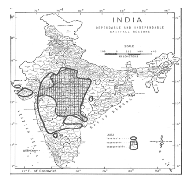
Figure 1. Map of India showing distribution of vertisols soil with dependable and undependable rainfall.

In India, vertisol soils occupy a total area of 70.3 million ha, constituting 22% of the total geographical area of the country, of which 34.3 and 30.2% are in Maharashtra (western India) and Madhya Pradesh (central India), respectively. Other Indian states having significant areas under this soil are Andhra Pradesh (13.4%), Karnataka (8.0%), Gujarat (7.0%), Tamil Nadu (4.0%), Rajasthan (1.5%) and Uttar Pradesh (1.6%). These soils occur in the locations lying between 8° 45' and 26° 0' N latitude and 66° 0' and 83° 41' E longitude (Murthy et al., 1982). Based on annual rainfall and probability of their occurrence. Vertisol region is sub-divided into two categories-vertisols of dependable rainfall areas and vertisols of undependable rainfall areas (Figure 1, Virmani et al., 1988). The areas under the former category are characterized by a reliability of rainfall occurrence at short intervals and average annual rainfall exceeds 750 mm and is located in the flood plains, valley bottom and plateau; whereas the vertisols of undependable rainfall areas receive annual rainfall of 500-750 mm and are characterized by erratic onset, distribution and withdrawal of rainfall. Moreover, frequency of occurrence of dry spells in these low rainfall areas is very high and a large proportion of the annual rainfall is received in the months of September and October only; these areas are primarily located in the rain shadow region in the states of Maharashtra and Karnataka.