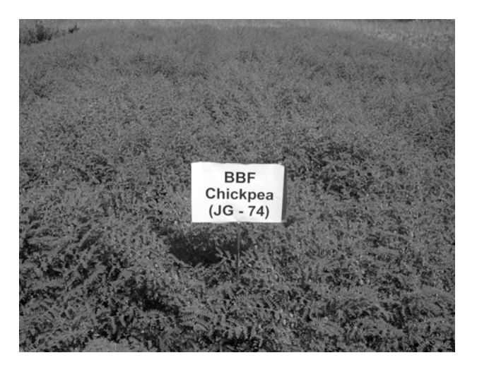
Plate 4. Chickpea crop grown under maize-chickpea cropping system with two irrigation on broad-bed and furrow (BBF) system.