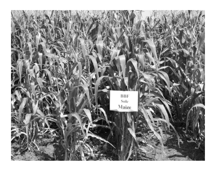
Plate 3. Maize crop under maize-chickpea cropping system on broad-bed and furrow (BBF) system.

* During the year 2003-04, there was pigeonpea sole crop in place of maize/pigeonpea intercropping.