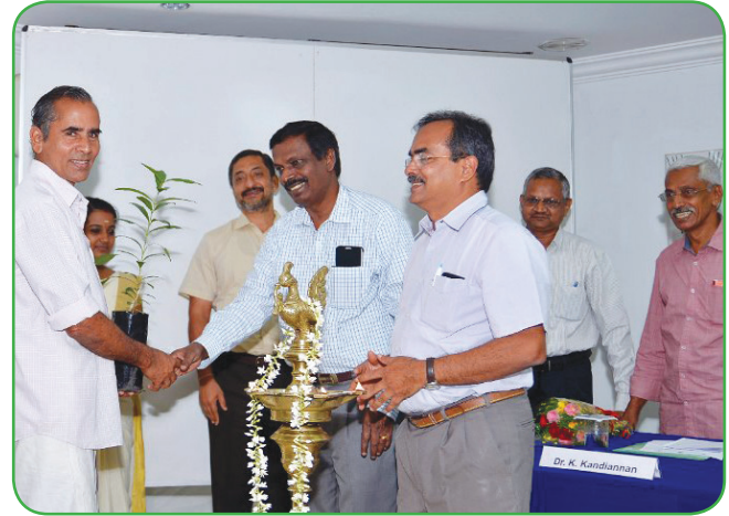
Distribution of spice saplings to farmers during district level seminar