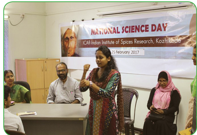
National Science day celebration at ICAR-IISR

In tune with the National Science Day theme-Science and Technology for the differently abled, twenty differently abled students of Rahmaniya Higher Secondary School, Kozhikode were given a study visit, motivational talk besides administering a quiz (test) at ICAR-IISR Kozhikode on 25 February 2017. The active participation of the two differently abled persons in the pay roll of the Institute added additional value to the program.