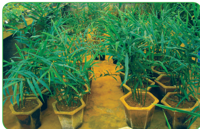
Ginger plants untreated (left) and treated (right) with apoplastic bacteria

Solarization of sick soil followed by ginger seed treatment and soil application of apoplastic bacteria, Bacillus licheniformis (IISR GAB 107) (seed treatment and soil application at the time of planting and at 30, 45 and 60 days interval) for the management of bacterial wilt resulted in 100% inhibition of bacterial wilt in the sick field as well as 81.73% inhibition of bacterial wilt under challenge inoculated conditions indicating the potential of GAB 107 for bacterial wilt management.