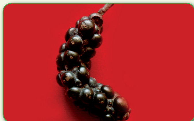
An unique wild Piper species collected from Arunachal Pradesh