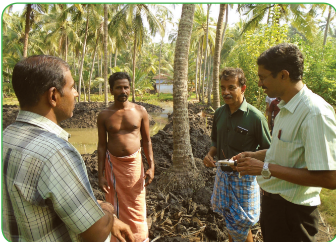
OFT on milk fish farming