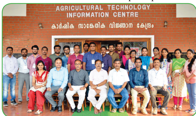
Participants of the Short-term training programme with ICAR-IISR faculty

The Bioinformatics Centre (DISC) organized a short-term training on “Bioinformatics for Transcriptome Analysis” during 22-25 March 2017. Sixteen participants from various ICAR institutes, agricultural universities and other institutions participated in this