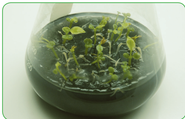
Virus free somatic embryogenesis derived plantlets of black pepper

Cyclic somatic embryo obtained from the micropylar region of matured seeds obtained from PYMoV infected black pepper plants of six varieties namely, IISR-Malabar Excel, IISR-Shakthi, IISR-Thevam, Panniyur 1, Sreekara and Subhakara were regenerated and hardened in green house. When total DNA isolated from 227 somatic embryo-derived plants belonging to six varieties were subjected to PCR, 65 plants showed positive reaction indicating that 28% of plants are infected with PYMoV while rest of the plants (72%) were free from PYMoV. Variety wise data indicated 55 to 100% virus elimination in different varieties. Complete elimination of PYMoV from black pepper could be achieved when somatic embryogenesis was combined with treatment with antiviral agent, ribavirin.