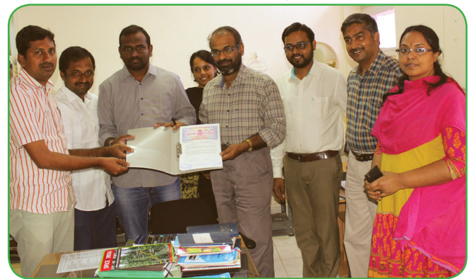
M/s. Nature agro producers, on 2 Feb 2017 For IISRPragati