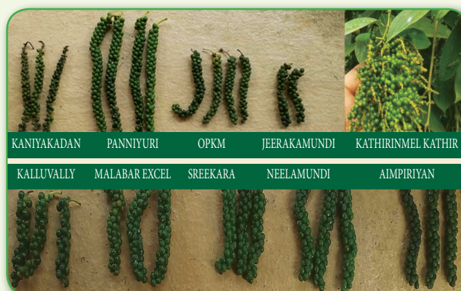
Spike setting of different accessions/cultivars at Chettalli