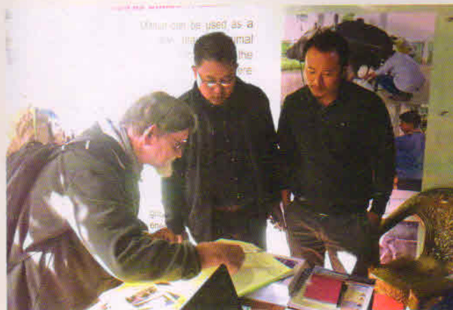
Visit of Foreign guests to Institute stall at Hornbill Festival