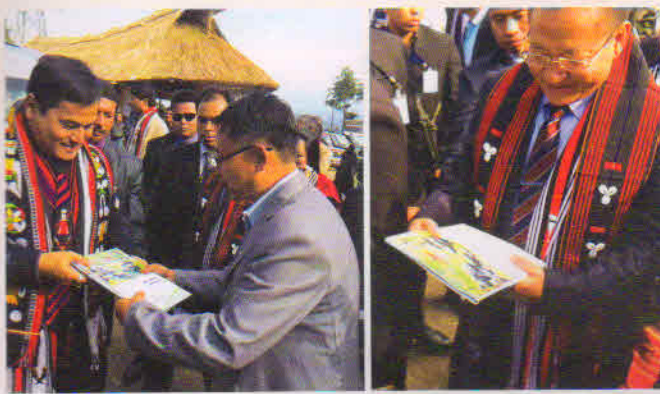
Visit of Shri. Sarbananda Sonowal, Hon'ble Chief Minister of Assam and Shri T. R. Zeliang, Hon'ble Chief Minister of Nagaland at the Institute stall in Hornbill Festival