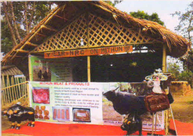
Institute stall displaying the technologies at Hornbill Festival