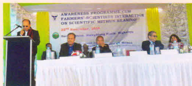
Awareness programme cum farmer-scientist interaction at Mawphlang, Meghalaya