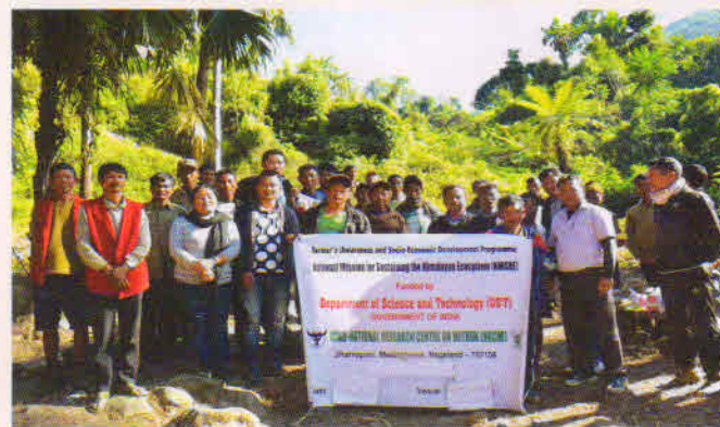
Mithun owners along with NRCM and KVK team

An animal health camp cum awareness programme was jointly organized by ICAR-NRC on Mithun, Medziphema and KVK, Longleng district at Yimchong village under Longleng district of Nagaland on 16 th December, 2016 under Tribal Sub-Plan. A total of 70 mithun farmers participated in the programme. The scientists performed health examination for 24 mithuns and farmers were supplied inputs such as Foot & Mouth Disease (FMD) vaccines, mineral mixture, anthelmintics and veterinary medicines.