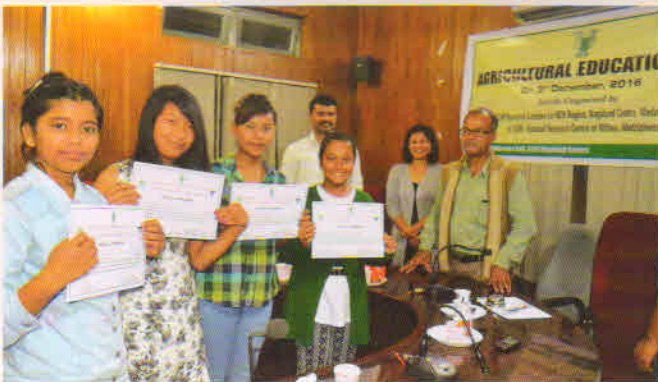
Participation of school students in various events & Prize distribution during Agriculture Education Day