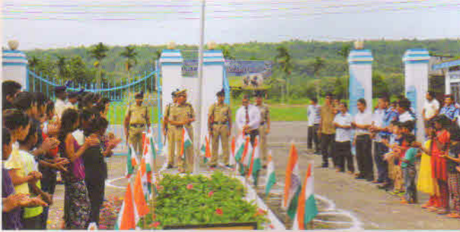
Celebration of 70 th Independence Day at the Institute