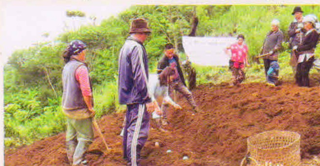
FLD on Potato