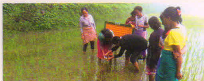
Training under Jai Jawan-Jai Kisan at Phek OFT on Trichogramma spp for paddy management