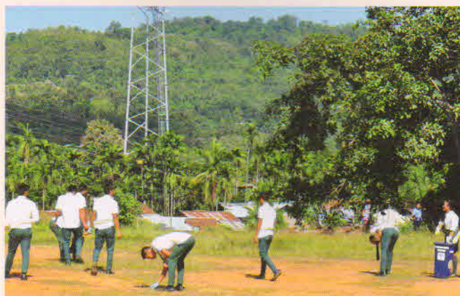
Cleanliness drives launched at Government Higher Secondary School, Medziphema