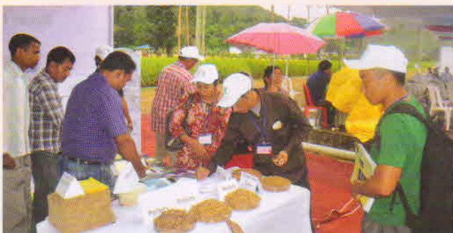
Institute stall at Field Day Cum Farmers-Scientist Interaction held at Medziphema

The Institute participated and displayed the farmers friendly technologies in the Field Day Cum Farmers-Scientist Interaction organized by Nagaland Centre of ICAR-Research Complex for NEH on 27 th October, 2016.