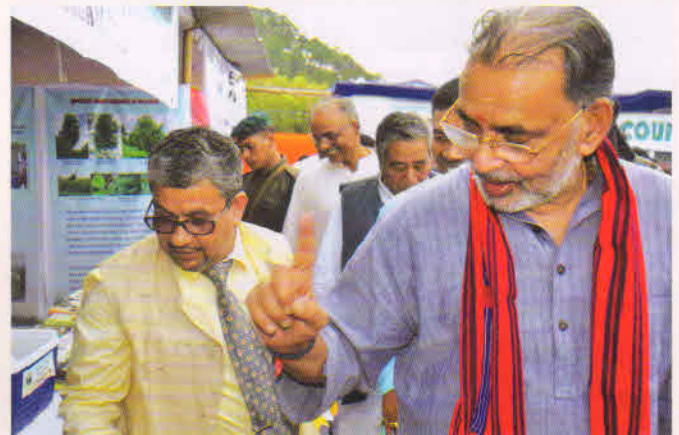
Visit of Shri Radha Mohan Singh, Hon'ble Union Minister of Agriculture and Farmers Welfare at the Institute stall