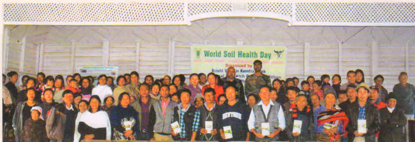
Celebration of World Soil Health Day on 5 th December, 2016