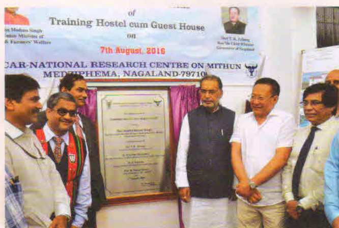
Laying of Foundation Stone of Farmers' Hostel by Hon'ble Minister of Agriculture & Farmers Welfare

On 7 th August 2016, Shri Radha Mohan Singh, Union Minister of Agriculture and Farmers' Welfare, Government of India laid the foundation stone of 'Training Hostel-cum-Guest House' facility at