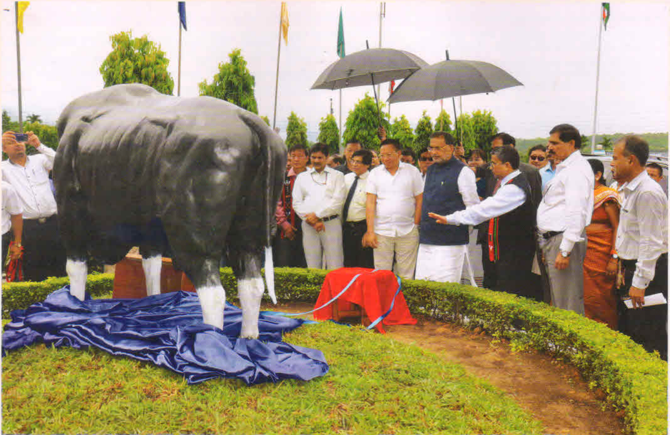
Shri Radha Mohan Singh, Hon'ble Union Minister of Agriculture & Farmers' Welfare unveiling a statue of Mithun on 7 th August, 2017