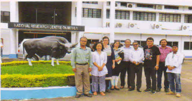
Officials of IFAD &amp; UNDP visiting the Institute