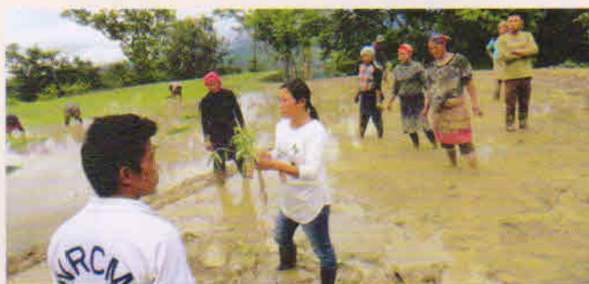
Training under NICRA Project at Thipuzu village

The Krishi Vigyan Kendra, Porba, Phek conducted a total of 56 trainings, four vocational trainings, nine trainings under NICRA and six training under Mera Gaon Mera Gaurav. The KVK officials also organized FLD, OFT, farmers-scientist interaction and distributed soil health cards. A total of 3205 farmers have been benefitted.