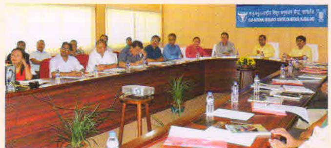
Brain storming workshop on bankable scheme for mithun husbandry