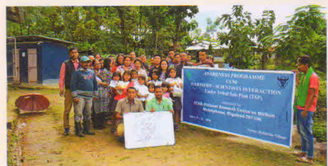
Awareness programme cum farmers-scientists interaction in Hekheshe village