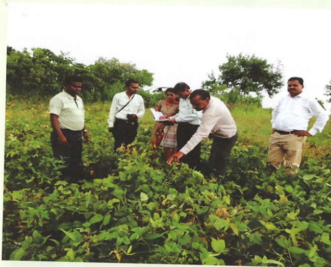
TSP-Pulses demonstration on Black gram

Chhattisgarh. 230 demonstrations were conducted in different pulse crops in an area of 92 ha with Black gram (PU-35, JU-3, JU-86) and Pigeon pea (JKM-189, TUT-501) varieties.