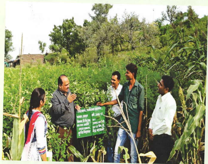
TSP-Pulses demonstration on Pigeonpea