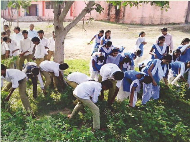
photo exhibition, farmer's meetings and demonstration on Parthenium management, student rallies, about nature of weeds, their hazards and its management.

Parthenium Awareness Week was organized from 16-22 August by Krishi Vigyan Kendras of ATARI, Jabalpur. During this awareness week KVKs organized various activities like awareness lecture,