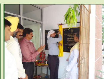
Release of Telephone Directory of ICAR-ATARI, Kanpur & inauguration of Annexe Admin building by DDG (AE)