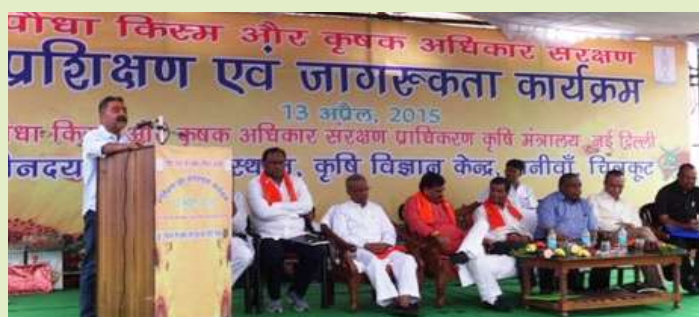
PPVFRA programme at KVK Chitrakoot