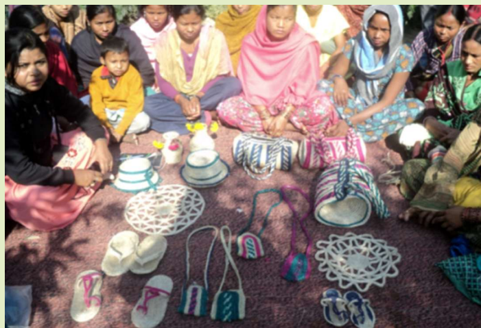
Handi craft made by tribals under TSP programme : LakhimpurKheri (U.P.)