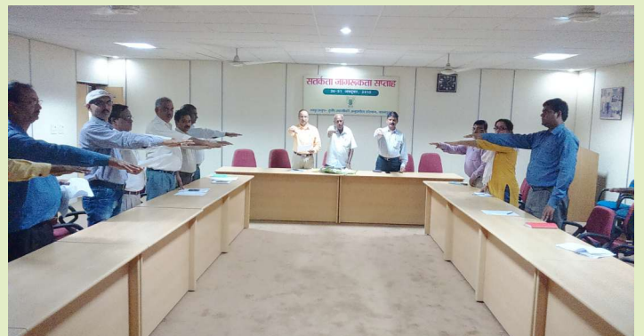
अटारी के कर्मचारी हिंदी चेतना मास एवं सतर्कता जागरुकता सप्ताह मनाते हुए

आईसीएआर-अटारी, कानपुर ने सतर्कता जागरुकता सप्ताह २६-३१ अक्टूबर, २०१५ के दरमियान मनाया गया। इस अवसर पर समस्त अधिकारी एवं कर्मचारियों ने संस्थान के निदेशक एवं आईसीएआर-आई.आई.पी.आर.के भूतपूर्व निदेशक के समक्ष शपथ ली।