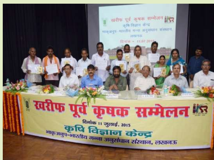
Pre-Kharif campaign organised at KVK Lucknow