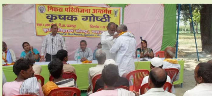
K. Goshi organised under NICRA Project at KVK Bahraich 5 th December, 2015