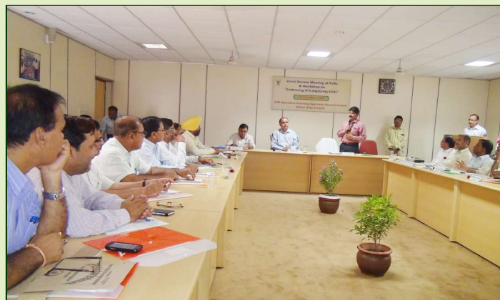
Interaction of DDG (AE) with the delegates

ICAR-ATARI organized one day review workshop for the Directors of Extension of Agricultural, Veterinary and Deemed Universities; representatives of ICAR institutes, NGOs and educational institutes having Krishi Vigyan Kendras in the states of Uttar Pradesh and Uttarakhand for reviewing the work progress of KVKs and also to deliberate upon to evolve the roadmap for digitizing the KVKs for ensuring online monitoring system on 07.09.2015.