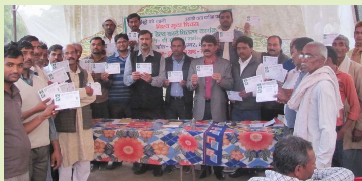
Distribution of Soil health card at KVK Kaushambi

KVKs of ICAR-ATARI, Kanpur organized the event "Soil Health Day" on 5th December, 2015. In this programme KVKs have distributed Soil Health Card to the farmers through local MP/MLA/other dignitaries. Total 16382 Soil Health Cards have been distributed by the KVKs of Uttar Pradesh (13808) and Uttarakhand (2574) on this day.