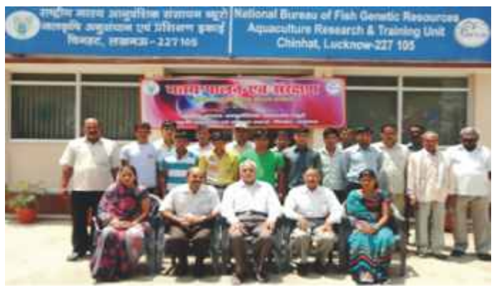
Trainee farmers with guest and staff of NBFGR

Three batches of short-term residential training programmes were organized for the aqua-farmers of Lakhimpurkhiri and Sonbhadra districts of U.P. during 14-16 May, 26-28 June and 2-4 July, 2013. Total 70 tribal aqua-farmers undergone training in these programmes. In these trainings aspects of aquaculture and conservation of endangered fish species were imparted through the expert faculty in the laboratories.