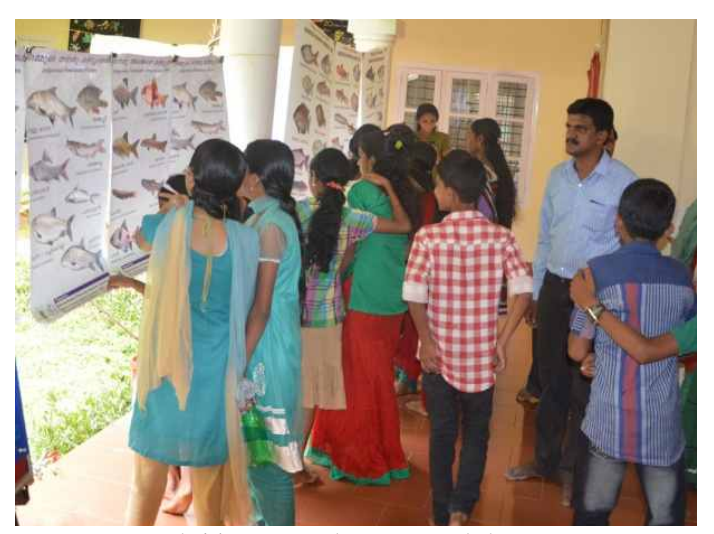
Children view the poster exhibition

A one-day awareness programme on "Fish Conservation and Tribal communities" was conducted at