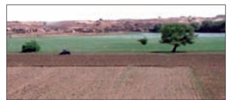
Fig. 2. Traditional Roopsi khadin (District Jaisalmer, Rajasthan)

1. The catchment may be classified on the basis of infiltration rate. In the areas where infiltration rate is less than 5 cm hr -1 may be