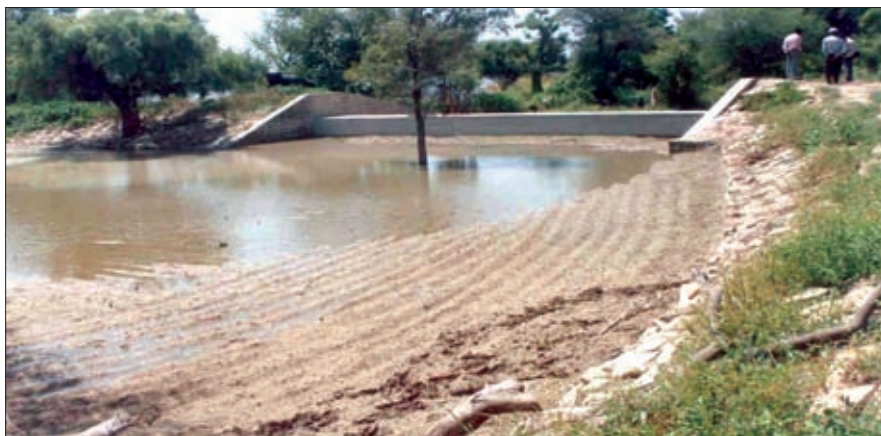
Fig. 3. Khadin , developed by CAZRI, at Baorali-Bambore watershed (Distt. Jodhpur)

productivity of the khadin can be further increased by diversifying cropping pattern in lower and middle reaches and integrated agri-horticulture system in upper reach of the khadin . Grafted ber ( Ziziphus mauritiana ) and Gonda ( Cordia dichotoma ) are suitable fruit species for the upper reach of the khadin . During drought years, moong bean (green gram) and guar (cluster bean) in middle reach and bajra (pearl millet) in lower reach may be grown successfully. Further, short duration variety of pearl millet can be grown in lowest reaches even if the rainfall received is 30-40 mm, and soil profile is charged with the water of about 200 mm/m in soil. The study further reveals that HHB-67 variety of pearl millet is suitable for late sowing and can yield grains even if sown up to 1 st week of September. During normal monsoon year, the ideal cropping pattern would be agri-horti ( Ber / Gonda + Guar ) in upper reach, mustard in middle reach and wheat in lower reach of the khadin bed area.