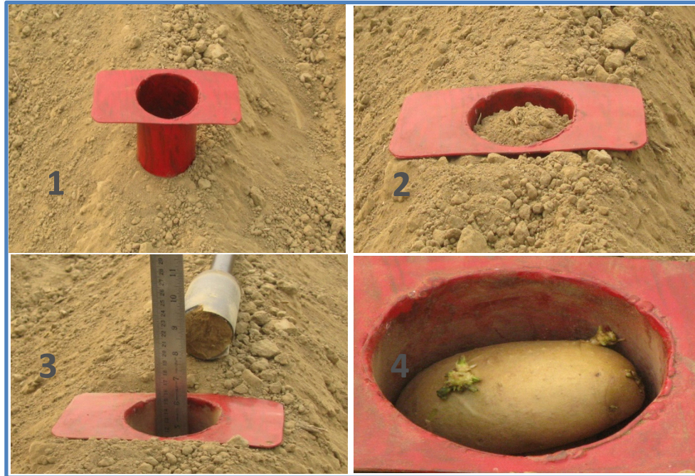
Fig. 2. Planting of seed tubers at different depth levels. 1, Positioning of collared pipe over the ridge; 2, inserting collared pipe into the ridge; 3, removing soil with auger and measuring depth of soil inside the pipe with scale; and 4, placing seed at longitudinal axis at desired depth after which tuber is covered with soil and pipe is pulled out gently

growers during those years) and the price for small-size potato tubers was taken as ₹3,000/t (the prevailing market price for that quality of potato tubers). Green tubers were considered as non-marketable. Data of each character collected from the experiments were statistically analyzed using standard procedures of variance analysis with the help of statistical software CROPSTAT 7.2 (IRRI, 2009). Critical difference (CD) values at P=0.05 were used to determine the significance of differences between means.