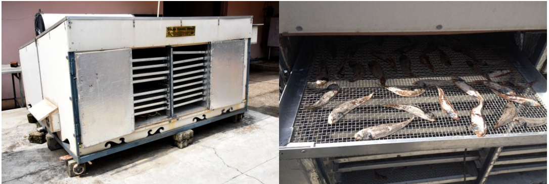
Fig.5. CIFT Solar-Cabinet Dryer with Electrical back-up

(e) Solar Cabinet dryer with electrical back-up: This offers a green technology supplemented by electrical back up in case of lacunae in solar radiation. The dryer consists of four drying chambers with nine trays in each chamber (Fig.5). The trays made of food grade stainless steel are stacked one over the other with spacing of 10 cm. The perforated trays accomplish a through flow drying pattern within the dryer which enhances drying rates. Solar flat plate collectors with an area of 7 m<sup>2</sup> transmit solar energy to the air flowing through the collector which is then directed to the drying chamber. The capacity of the dryer is 40 kg. Electrical back up comes into role once the desired temperature is not attained for the drying process, particularly during rainy or cloudy days.