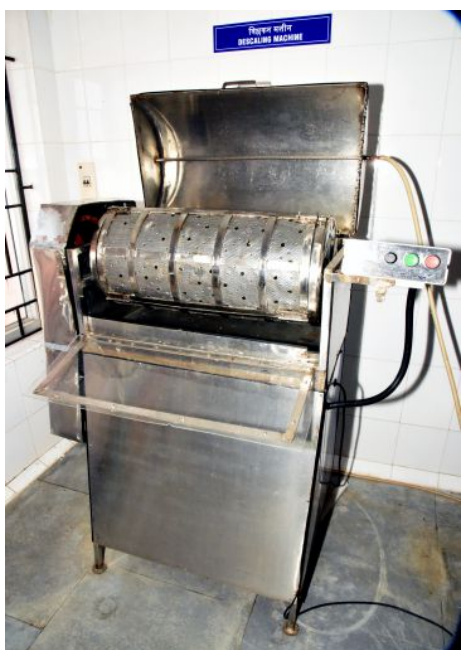
Fig.6 Fish de-scaling machine with variable drum speed

Fish descaling machine with variable drum speed: Fish de-scaling machine is designed and fabricated for removing the scales of fishes easily. This equipment can remove scales from almost all types/sizes/ species of fishes ranging from marine to freshwater species like Sardine, Tilapia to Rohu. The machine is made of SS 304 and has 10 kg capacity. It contains a 1.5 HP induction motor and a Variable Frequency Drive (VFD) to vary the speed of the drum depending on the variety of the fish loaded. The drum is made of perforated SS 304 sheet fitted in a strong SS Frame. Water inlet facility is provided in the drum for easy removal of the scales from the drum so that area of contact to the surface will be more for removal of scales. The water outlet is also provided to remove scales and water from the machine. An Electronic RPM meter was attached with the de-scaling machine which directly displays the RPM of the drum. Speed of the drum is a factor influencing the efficiency. The machine takes only 3-5 minutes to clean 10 kg fish depending on the size.