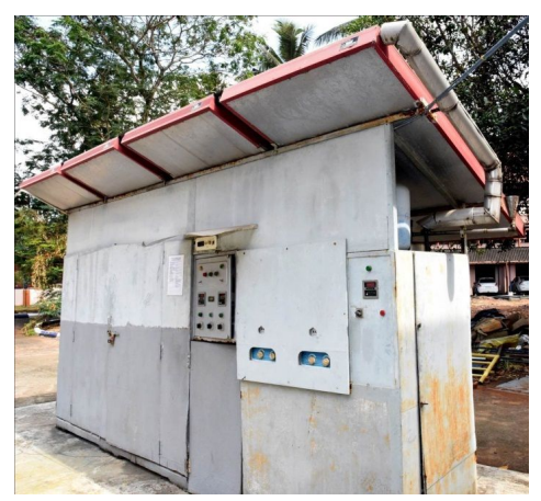
Fig.1. CIFT Solar-LPG Dryer

control of temperature, humidity and drying time. Solar drying reduces fuel consumption and can have a significant impact in energy conservation.