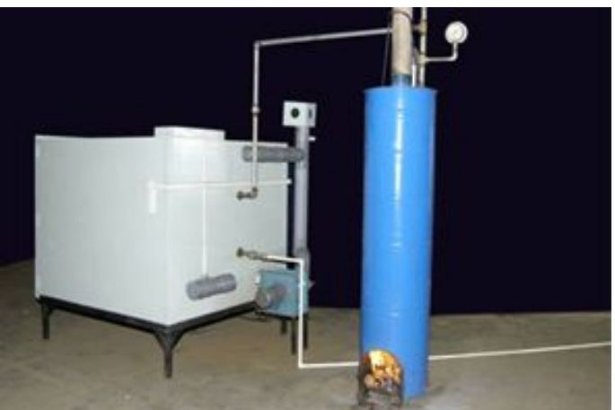
Fig.3 CIFT Solar-Biomass Dryer

(c) Solar-Biomass Hybrid dryer: A dryer working completely on renewable energy was designed and developed for eco- friendly operation. Solar Biomass Hybrid Dryer consists of well insulated and efficient solar airheating panels, drying chamber, SS mesh trays, photo-voltaic cells, fans and biomass heating system (Fig.3). Hot air is generated by virtue of solar energy inside the heating panels and passed into the drying chamber. Continuous flow of hot air is maintained with the help of Photo Voltaic cells and fans to enable drying process. During cloudy days when sufficient solar energy is not available to maintain required temperature within the dryer, an alternate biomass heating system is manually actuated. Thus a fully green technology for fish drying is achieved by this.