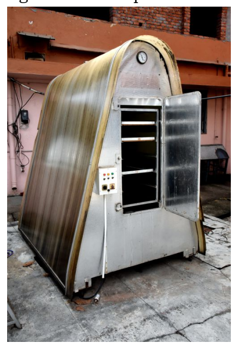
Fig.4 CIFT Solar-Tunnel Dryer

Apart from fishes, this dryer is also suitable for other agricultural products like fruits, vegetables and spices.