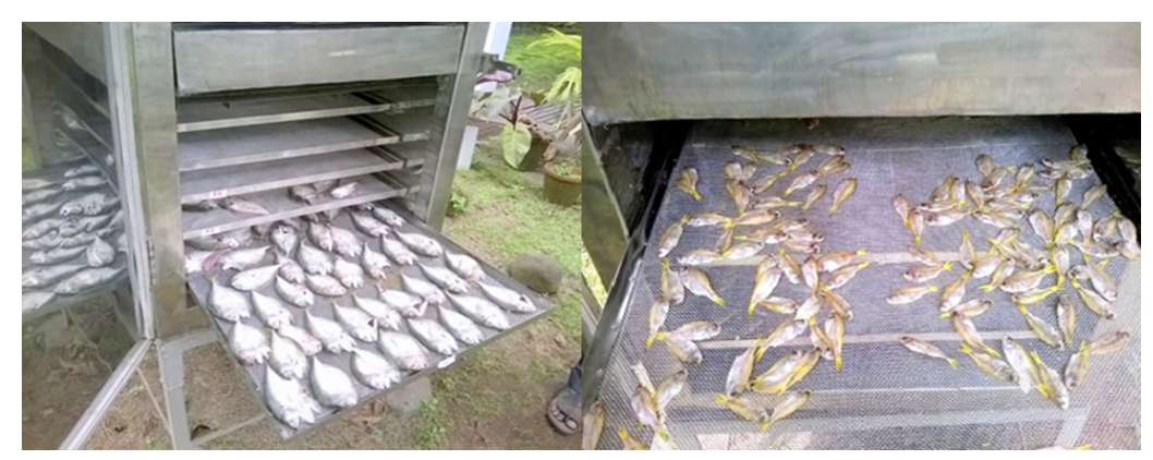
Fig.2 CIFT Solar-Electric Dryer

(c) Solar-Biomass Hybrid dryer: A dryer working completely on renewable energy was designed and developed for eco- friendly operation. Solar Biomass Hybrid Dryer consists of well insulated and efficient solar airheating panels, drying chamber, SS mesh trays, photo-voltaic cells, fans and biomass heating system (Fig.3). Hot air is generated by virtue of solar energy inside the heating panels and passed into the drying chamber. Continuous flow of hot air is maintained with the help of Photo Voltaic cells and fans to enable drying process. During cloudy days when sufficient solar energy is not available to maintain required temperature within the dryer, an alternate biomass heating system is manually actuated. Thus a fully green technology for fish drying is achieved by this.