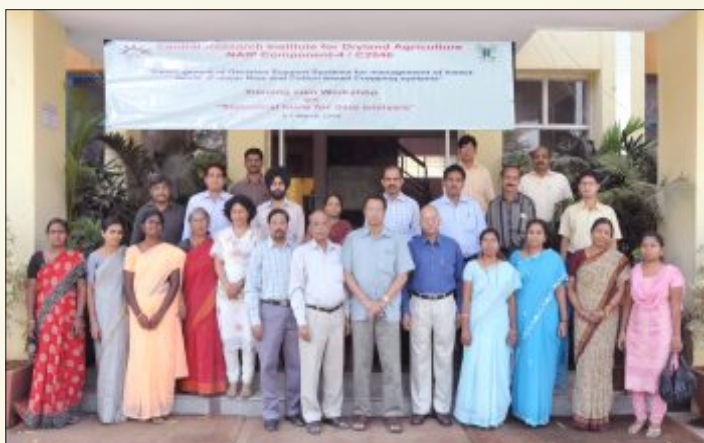
Trainees at workshop

A training course on “Technological advances in livestock production for higher productivity and efficient utilization of resources” was organized under the water productivity Scheme from 3-16 March, 2009 to familiarize the participants with advances in livestock production for quality produce and higher profitability, and efficient utilization of available resources. The programme was attended by 17 participants from 10 districts of Andhra Pradesh.