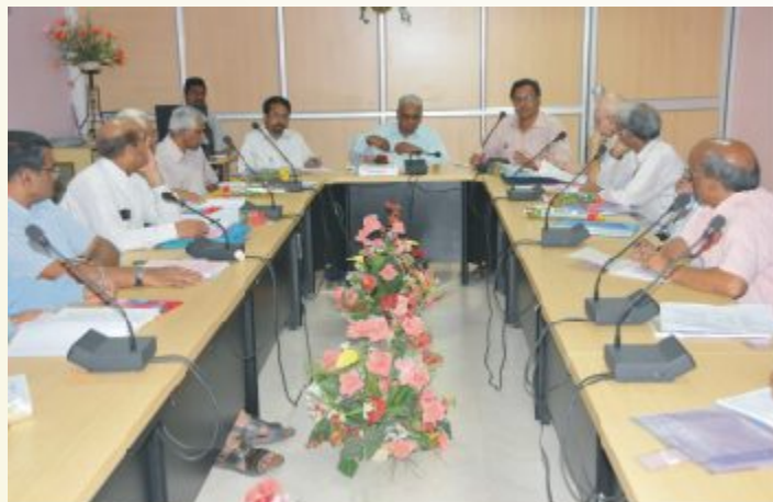
RAC meeting in progress

The IRC meeting was held from 13-16 May, 2009. A total of 98 projects (30 externally funded) were reviewed in the meeting. Eleven projects have been concluded and two projects were given extension. Fifteen new projects have been approved in priority areas. The new technical programme of the Institute can be seen at www.crida.ernet.in .