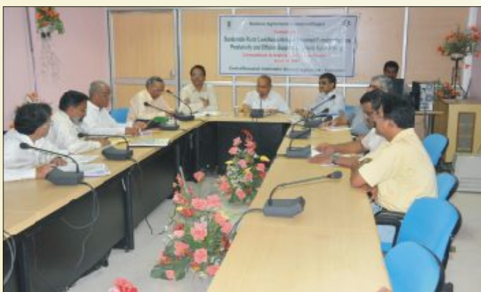
CAC meeting in progress

The Third CIC meeting was chaired by Director, CRIDA, and reviewed the project progress and sorted out administrative, financial and implementation issues. The meeting on 6 June 2009, was attended by the consortium partners: CICR, Nagpur, DRR, Hyderabad and SAC, Ahmedabad.