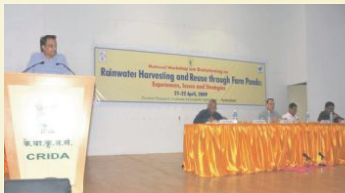
Director, CRIDA addressing the participants of workshop

of knowledge in water harvesting through small ponds in Vertisol, Alfisol regions in low to medium rainfall conditions and high rainfall hill and mountain regions was reviewed. Technologies and models which can be immediately adopted and gaps needing further research are identified. Recommendations made in three broad areas: i) design aspects of ponds, lining materials, storage and harvestable runoff, etc., ii) lifting, conveyance, efficient use, water productivity and choice of crops, etc. iii) policy, institutional and support systems for upscaling can be seen at www.crida.ernet.in / NAIP/NW-Sessions/nw.html .