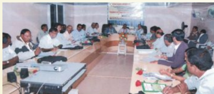
National Group Meeting at AICRPDA Centre, Rajkot, JAU on 6 - 9, January, 2009