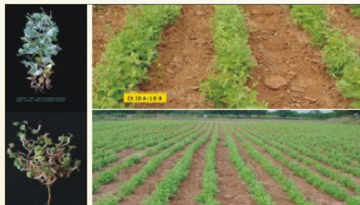
CRIDA-18R , Single Plants (Left) and Field View (Right)

P.R. Reddy Principal Scientist, (Plant Breeding)