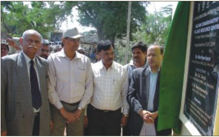
VRC building inaugurated at B. Yerragudi village