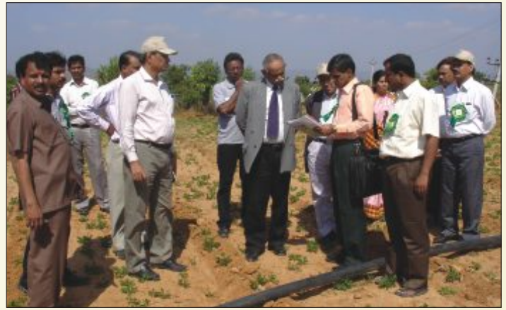
The CPI explaining custom hiring approach of sprinkler irrigation