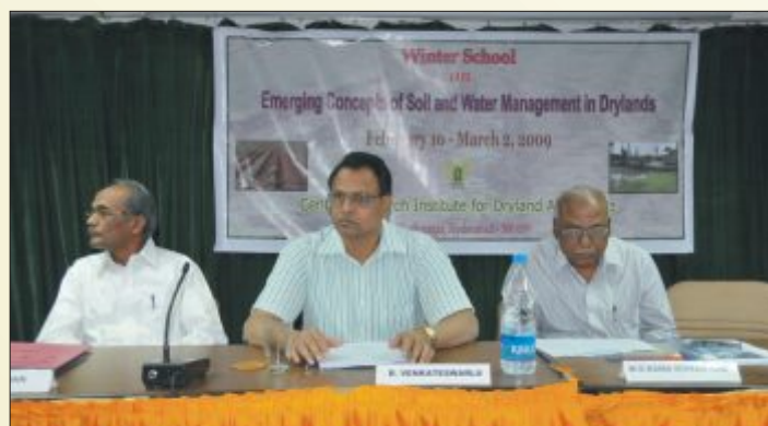
ICAR winter schools at CRIDA