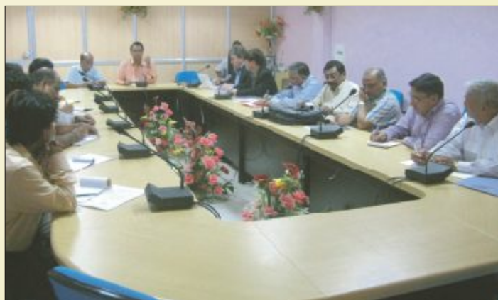
U.S. experts interact with CRIDA Scientists