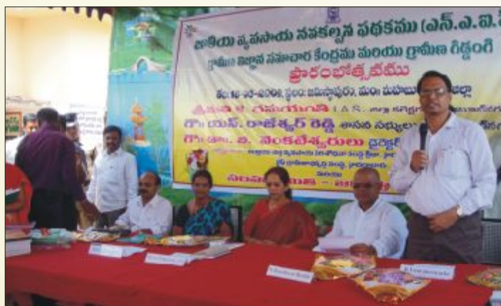
Director, CRIDA explaining project activities to MLA and district collector in a meeting with villagers