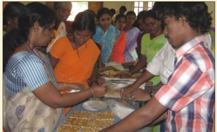
Training women on value addition in groundnut