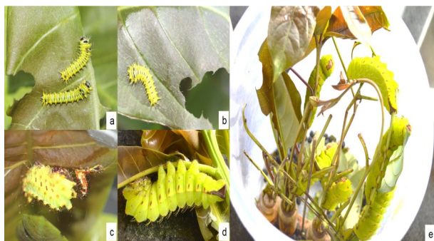
Fig. 3. Rearing of A. mylitta : a. 2 nd instar larvae on cashew b. 2 nd instar larvae on T. paniculata c. 4 th instar larva just moulted, d. 5 th instar larva on cashew e. 5 th instar larvae on T. paniculata under rearing set up.

incidence of tasar silkworm, A. mylitta was recorded initially on young cashew plants from June onwards, more during July-September but noticed up to February on old trees as well. Singly (rarely two) laid creamy flat-ellipsoidal eggs were seen on either upper or lower side of semi mature cashew leaves and a part of chorion was invariably eaten away by larvae upon hatching (Fig. 1a and b). Later, the larvae moved on to