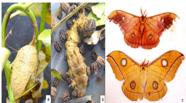
Fig. 4. (a) Cocoon spun on cashew (b) NPV infested 5 th instar larva (c) silkmoths –male (top) and female (bottom).