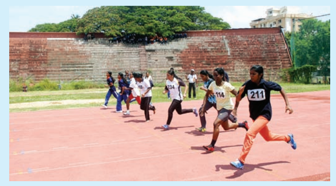
A view from athletic competition