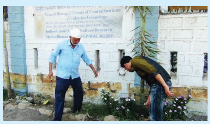
Cleaning of office building and premises of the Centre

June, 2015 by planting tree saplings around the campus and cleaning the office premises.