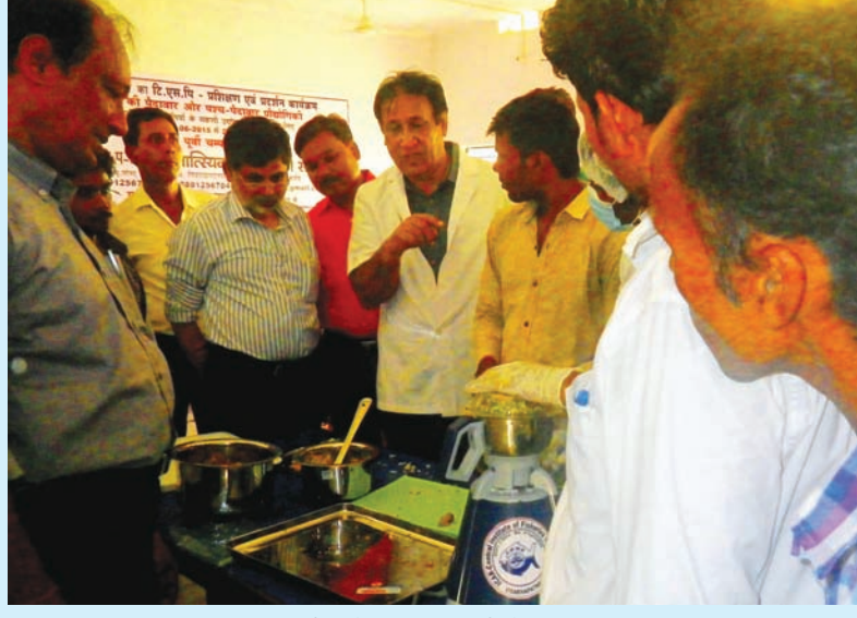
Demonstration of value added fish products

Honourable Prime Minister Shri Narendra Modi envisions that the whole country will be productive when every one is involved in production of some merchandise. Taking this as cue ICAR-CIFT established "Mini-Value Added Fish Product Preparation Facility" for the first time in the