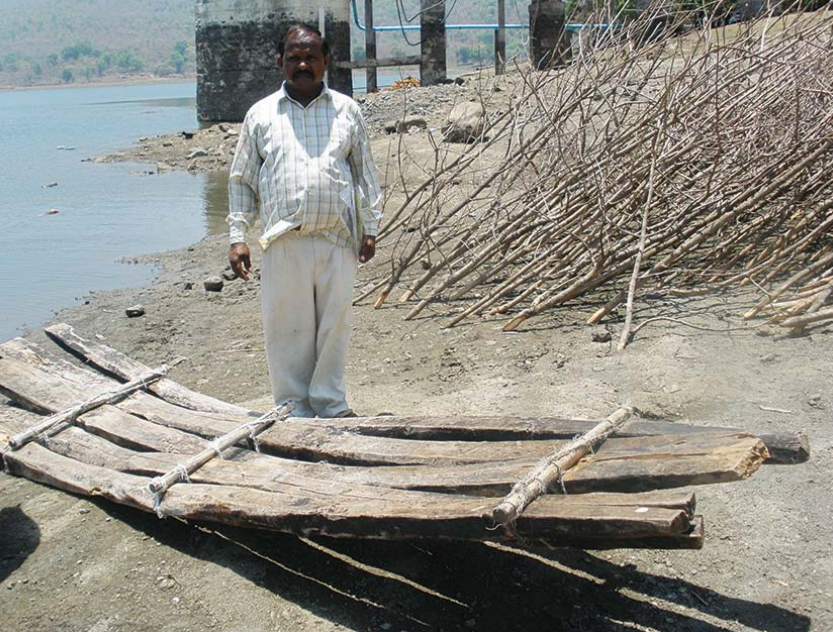
Traditional wooden fishing craft used for fishing by tribal fishermen

M umbai Research Centre of ICAR-CIFT conducted a three days Training cum Transfer of Technology programme to distribute coracles and FRP canoes and to demonstrate value added products for tribal fisherfolk at Usgaon, an inland fishing village in Thane district of Maharashtra during 25-27 April, 2016. Representatives of four tribal fishermen cooperative societies in Thane district viz. Usgaon, Kothare, Shirvanje and Vasai and Tribal women members from three self help groups from Usgaon viz. Bhartiya SHG, Savita SHG and Kranti SHG attended the programme.