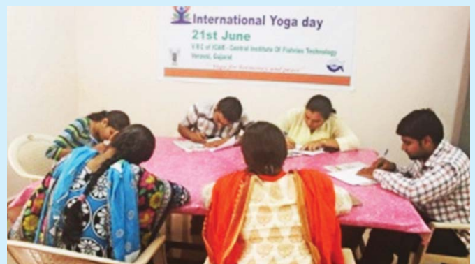
Essay writing competition in progress