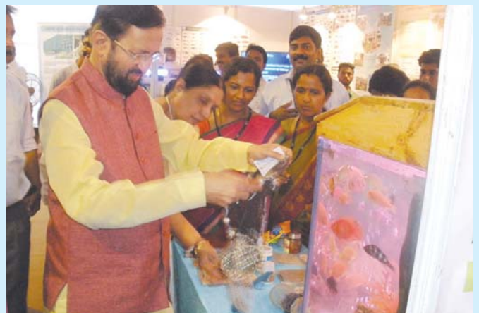
Shri Prakash Javadekar, Minister of State, Ministry of Environment, Govt. of India visiting ICAR- CIFT stall