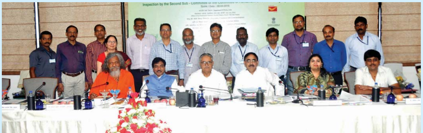
Members of the Committee with ICAR-CIFT officials