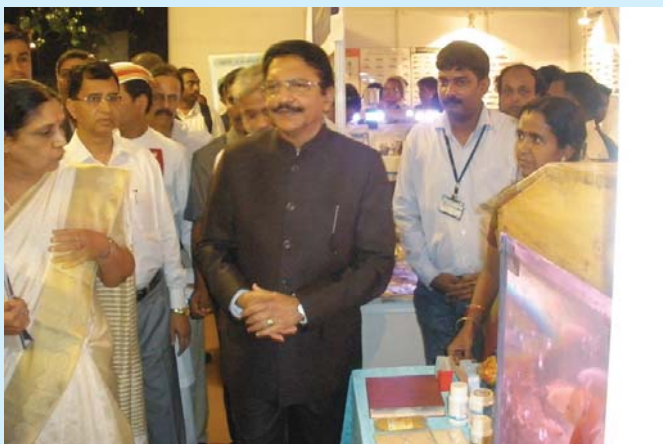
Hon'ble Governor of Maharashtra, Shri C. Vidyasagar Rao visiting ICAR CIFT stall at Mumbai