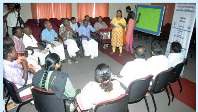
Preparation of seasonal calendar of fishing activity