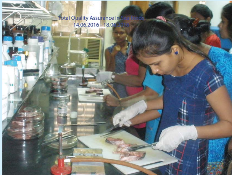
Total quality assurance in seafoods (Mumbai)