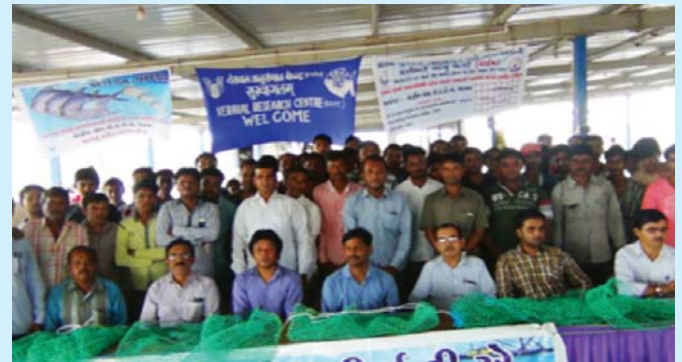
Participants and resource persons