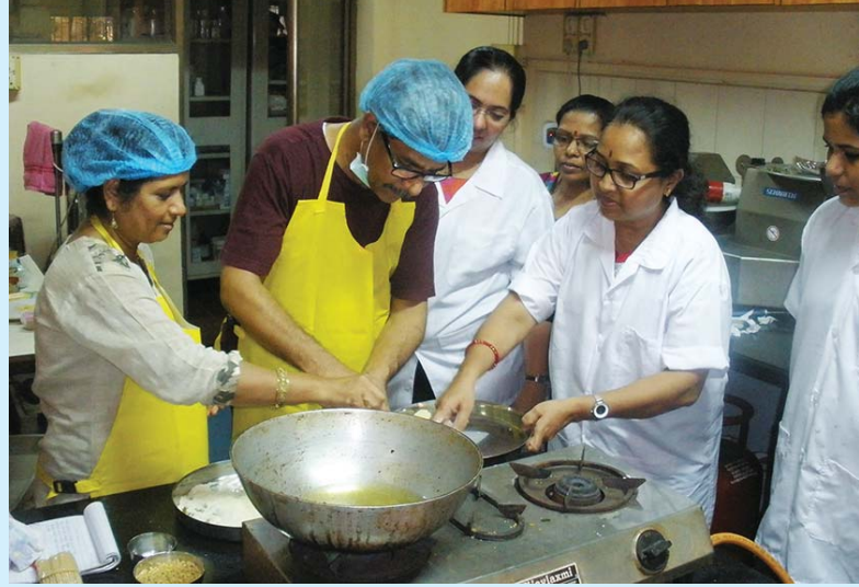
Preparation of value added fishery products (Mumbai)