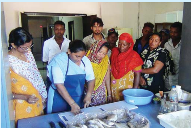
Practical session in progress