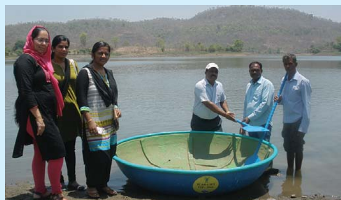
Distribution of coracle