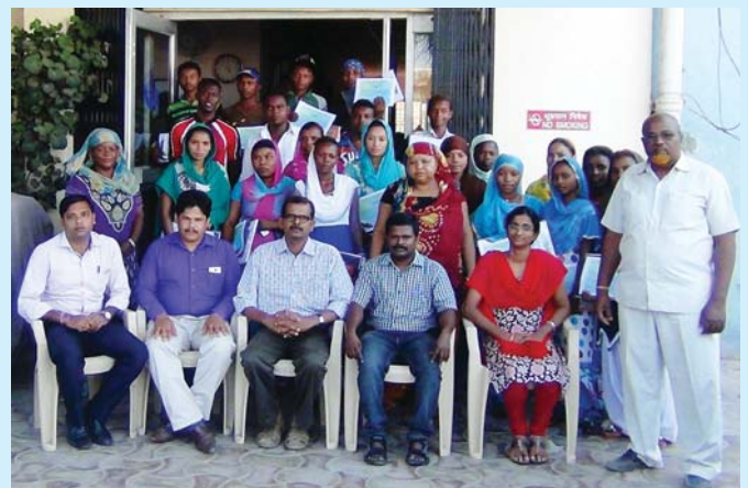
Participants and faculty of the programme