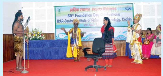
A scene from the entertainment drama