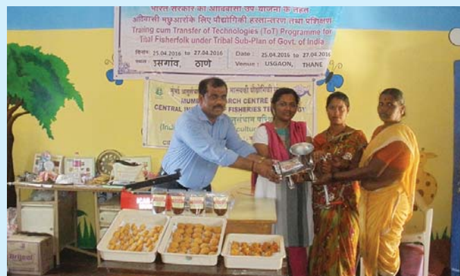
Distribution of meat mincer