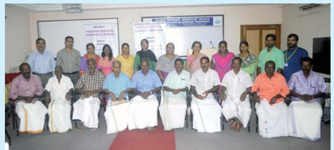
Workshop participants (Alappuzha) with the project staff