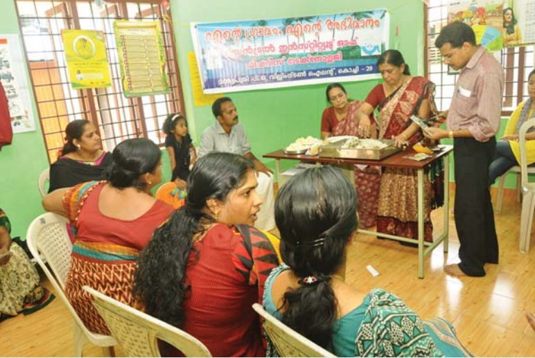
Training in progress at Thakazhi