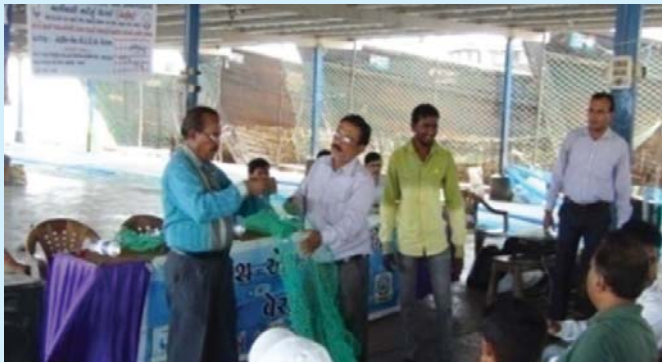
Demonstration in progress