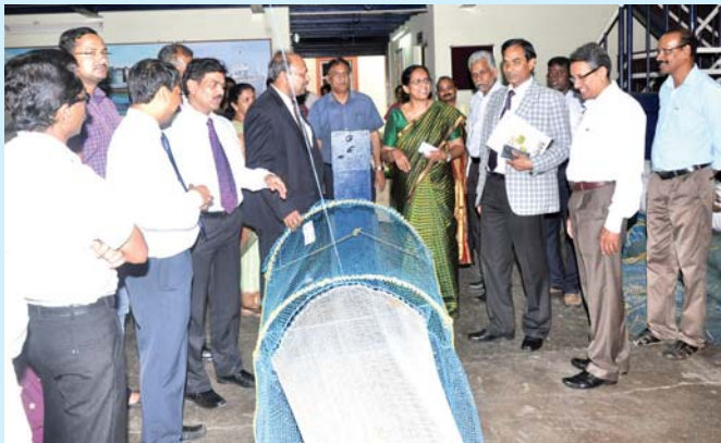
The dignitaries visiting the gear fabrication laboratory