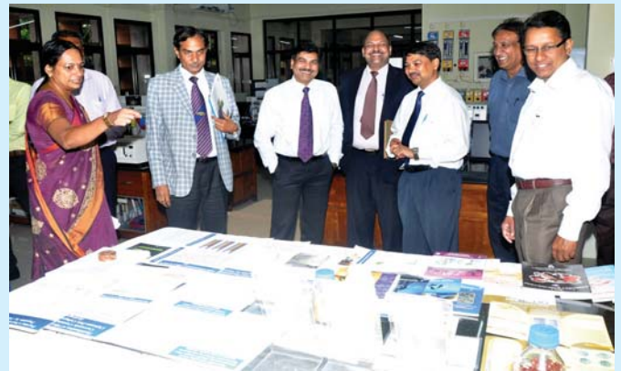
Visit to the Biochemistry and Nutrition laboratory