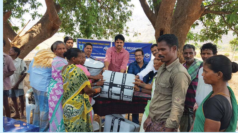
Distribution of insulated fish bag to the tribal fishers

fishers attended the programme. Inputs for responsible fishing such as gillnets, foldable traps and insulated fish bags for maintaining the quality of fish were distributed to the tribal fishers. Shri G. Rajesh, Fisheries Development Officer,