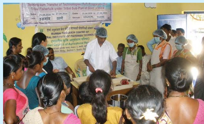
Demonstration of product preparation