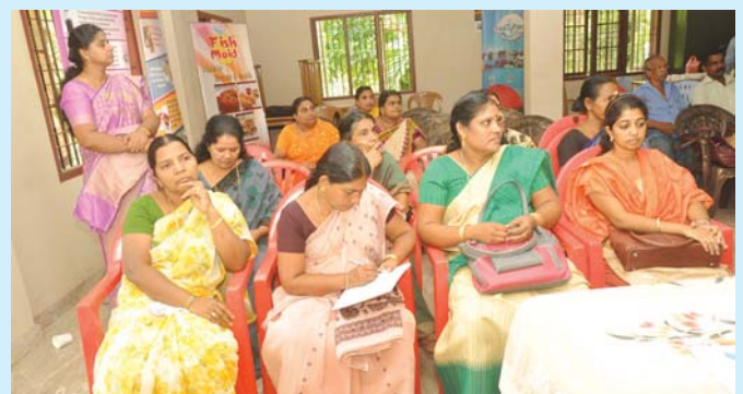
A section of the participants