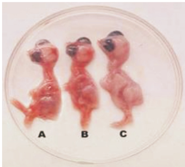
Figure 1 - Specific lesions: Occipital and pedal hemorrhages. (A) Seed-virus-infected embryo showing typical occipital hemorrhage. (B) Passaged (5 th ) virus-inoculated embryo showing mild occipital hemorrhage. (C) Uninoculated control without any occipital hemorrhage.

The revived freeze-dried egg-adapted vaccine virus, which served as seed material for passage in the TC system, possessed high HA (2 10 ) and EID 50 (10 7.5 ) titers. The potency of the seed virus was further confirmed by the appearance of specific lesions in the ECEs; namely, occipital and pedal hemorrhages (Figure 1). No significant (cytopathic) changes were noticed in the CEFCC system for up to three passages. However, the virus presence was confirmed by the observation of specific lesions in the ECEs. Adaptation of the virus in CEFCC was observed (CPE initiation) from the 4 th passage onwards, and the extent of the CPE increased with progressive passages upto the 18 th /final passage of this study (Figures 2A and 2B)