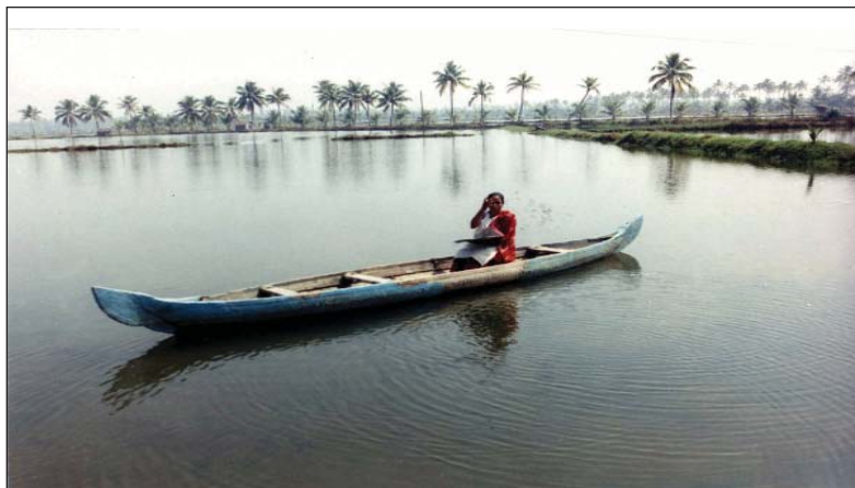
A woman feeding in aquaculture pond, India. Women contribute in almost all activities right from pond preparation, stocking, feeding, and to harvesting