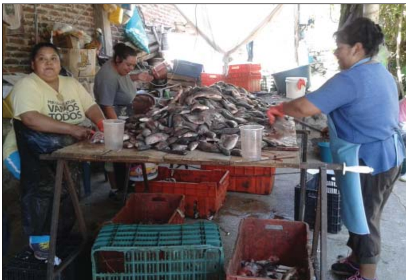
Women filleting in Petatán, Mexico. The sight of women filleting alone or in groups in their courtyards is a common one