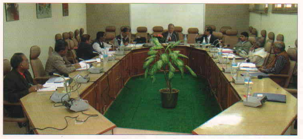
Institute Management Committee meeting in progress

It also approved the budget for X plan, equipment to be purchased and work to be executed besides several other important decisions such as holding of Kisan mela , opening of lac-sale counter etc.