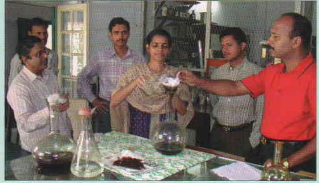
Entrepreneur preparing insulating varnish