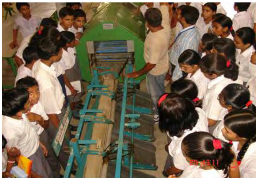
Students being demonstrated food kinnow waxing and grading machines at CIPHET Abohar

About 60 students of 9 th and 10 th from Kendriya Vidyalaya visited CIPHET Abohar on 19 th August 2008. They were shown various laboratories and pilot plant. Students have shown keen interest in various processes and equipments during visit. They were also told the importance of food processing particularly value addition of fruits and vegetables.