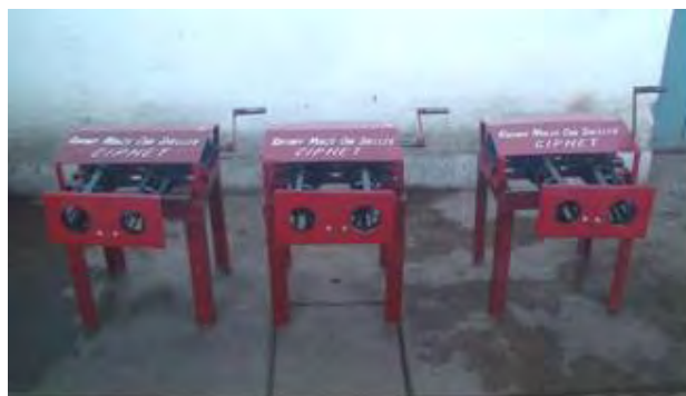
Prototypes of CIPHET rotary maize sheller

As part of the prototype multiplication and testing activity three units of CIPHET rotary maize sheller have been fabricated in CIPHET workshop. These units will be provided to willing entrepreneurs and end users and also to Directorate of Maize Research for use on their farm. This is an effort in the direction to motivate agricultural machinery manufacturers to fabricate low cost processing machines for decentralized processing in production catchments. The capacity of the unit is 130 kg/h. The cost of the unit is Rs. 4000.00 excluding packaging and forwarding charges.