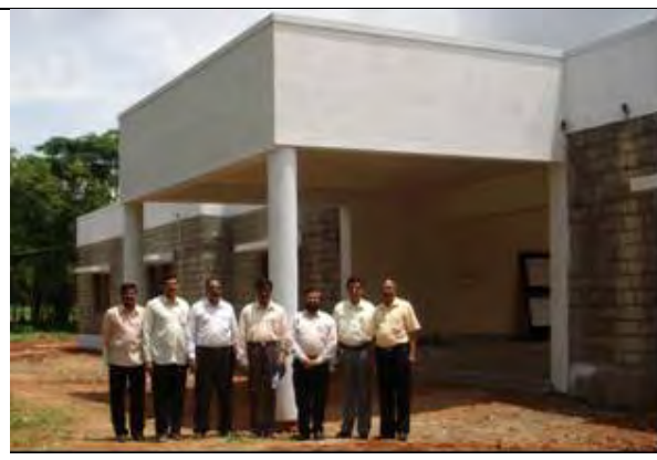
The front view of the CIPHET-UAS cluster building