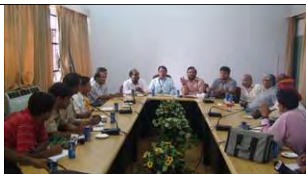
Press Conference after the programme