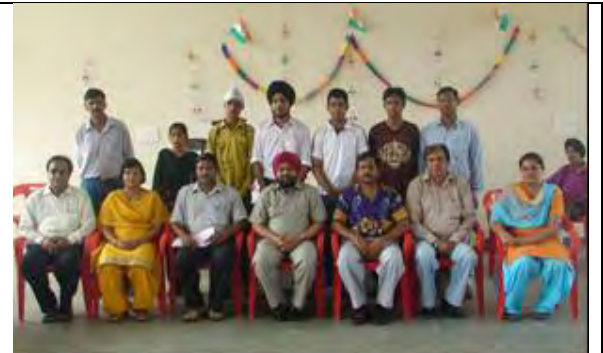
Meritorious students of employees (Standing)