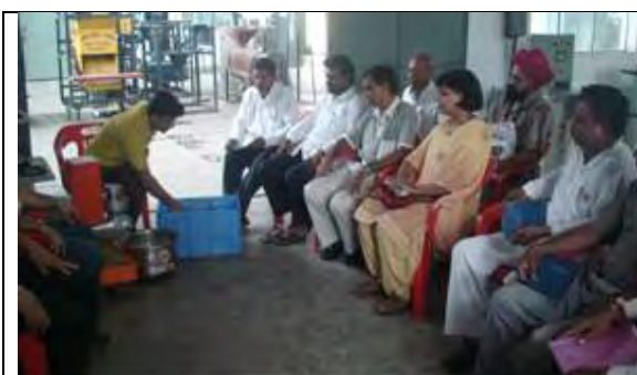
Demonstration of Chili Processing