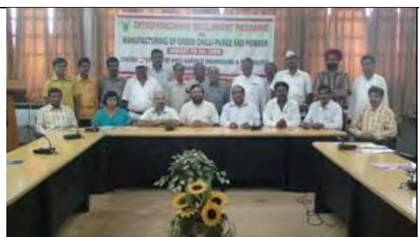
Faculty and participants of EDP on Chili processing