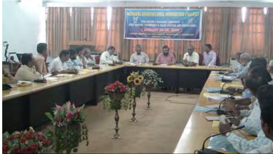
NAIP stakeholders meeting in progress