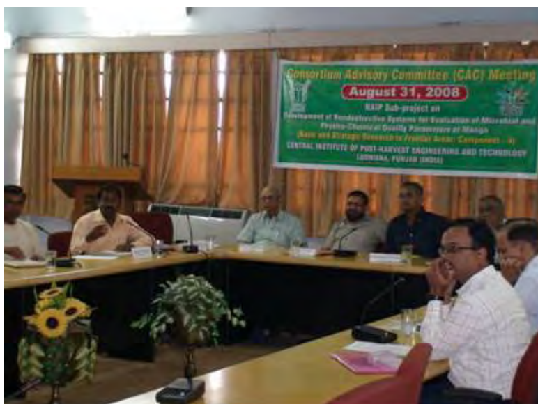
CAC meeting in progress for the project on Non-destructive Systems for Evaluation of Microbial and Physico-chemical Quality Parameters of Mango