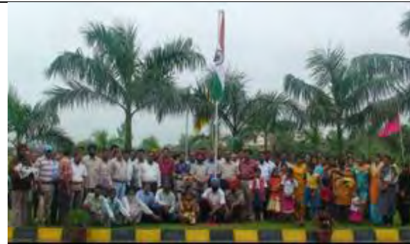
Flag Hoisting on Independence day