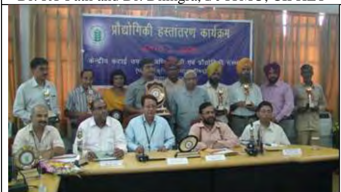
Technology developer employees and entrepreneurs with the chief guest