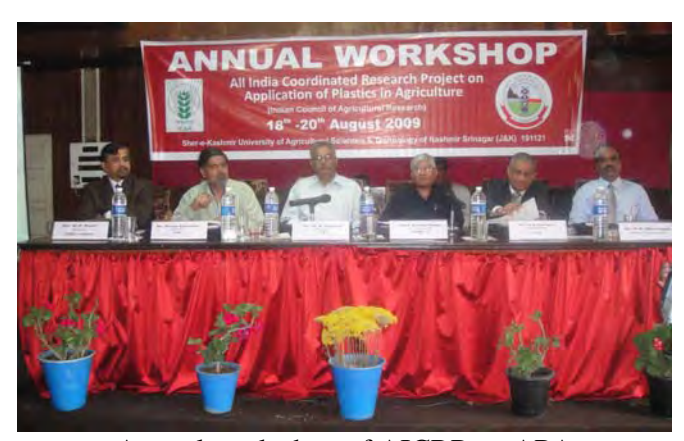
Annual work shop of AICRP on APA