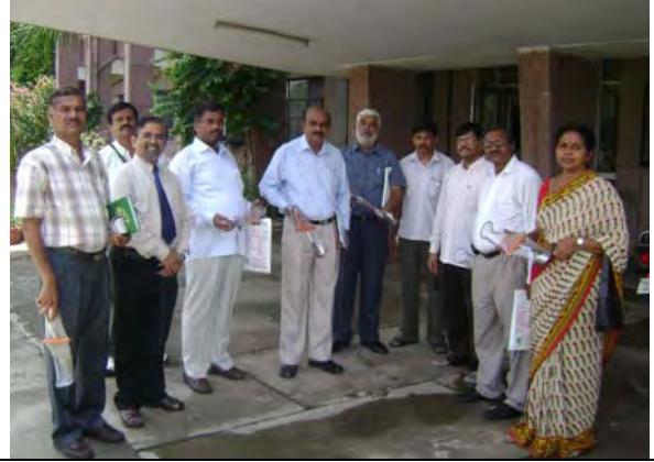
Visitors with CIPHET developed hand tool for banana comb cutting