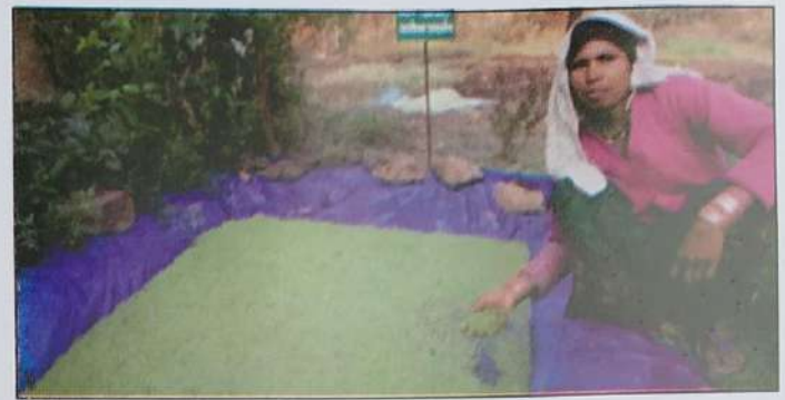
Azola production activity at Bhatapara