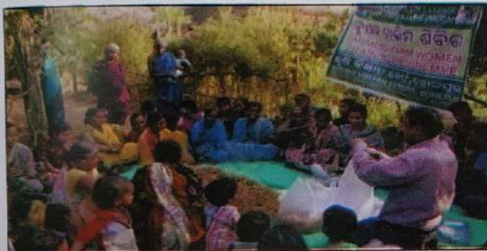
Training activity at Sonepur