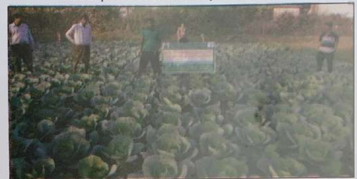
Vegetable production activity at Sonepur