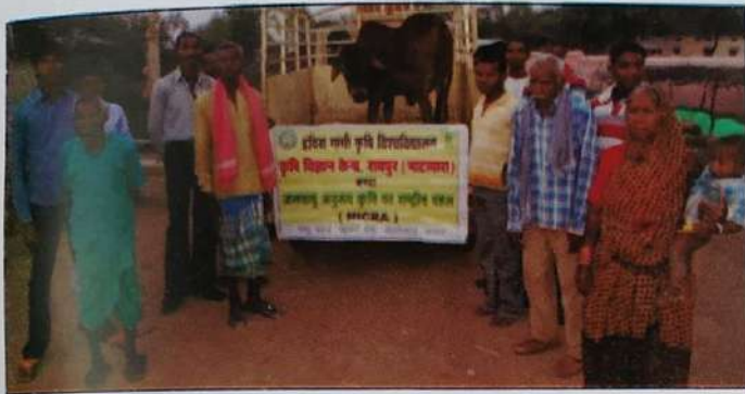
Animal Health camp at Bhatapara