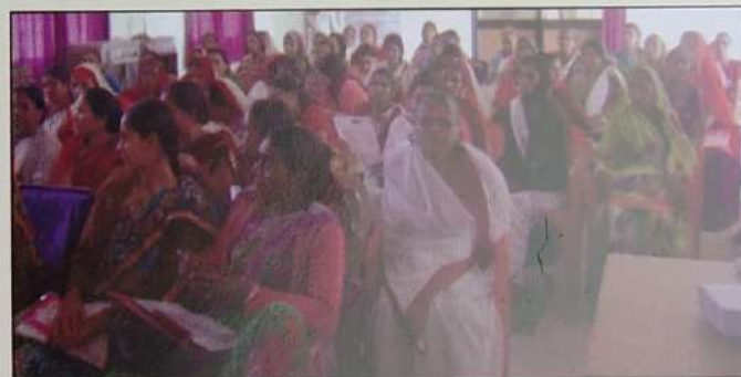
Womens Day Celebration at KVK Badwani

International women's day was celebrated on 8th March 2014 at KVK administrative building Kalukheda in which 75 farm women & Anganvadi worker of Jaora and Piploda block of Ratlam district participated in the programme. Different aspects related to women empowerment were discussed with the participants