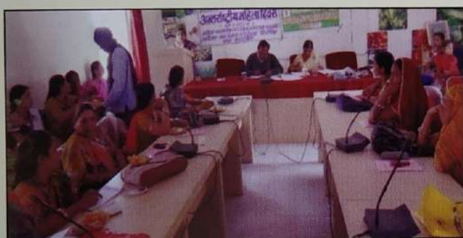
Womens Day Celebration at KVK Ratlam