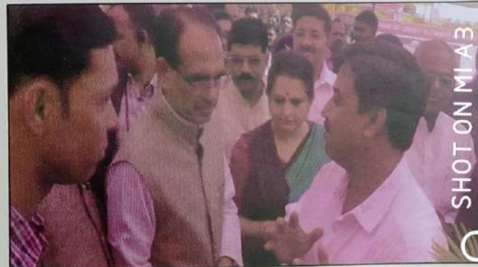
Sh. Shivraj Singh Chauhan, Hon'ble CM, Madhya Pradesh interacting with Scientists of KVK Burhanpur at Kisan Mela