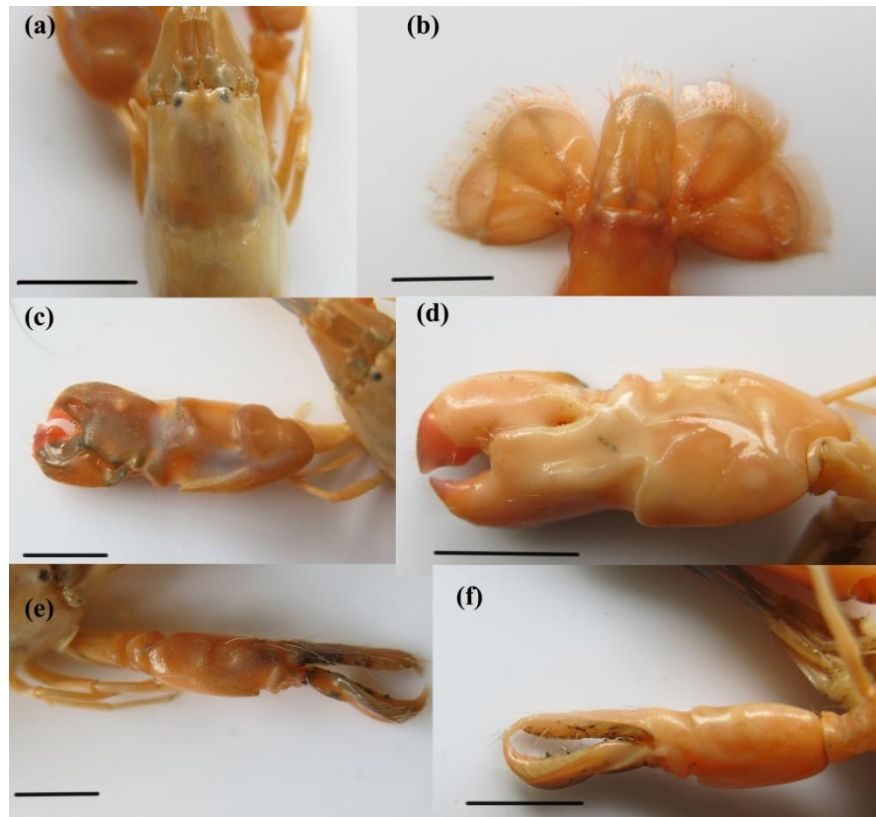
Fig. 2 — Species characters (Male, CL: 16 mm) (a) Dorsal view of rostral appearance, (b) Dorsal view of telson, (c) Dorsal view of major chela, (d) Ventral view of major chela, (e) Dorsal view of minor chela, (f) Ventral view of minor chela [Scale bar equal to 10 mm]