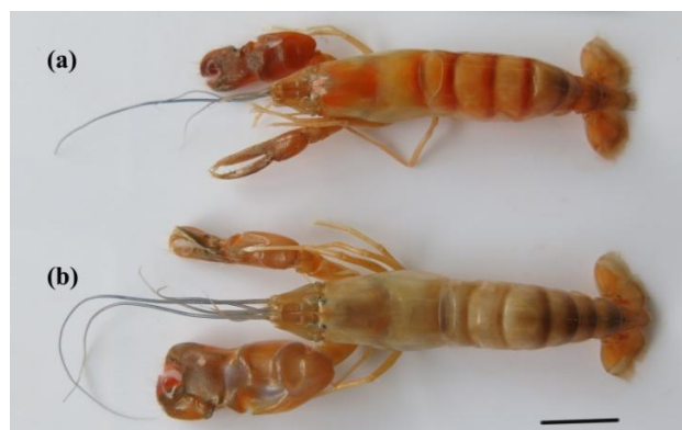
Fig. 1 — Alpheus euphrosyne de Man, 1897: Female specimen CL: 15 mm (a), Male specimen CL: 16 mm (b) [Scale bar equal to 10 mm.]

Alpheus eurydactylus De Man, 1920: 109 [type locality: Java] 18