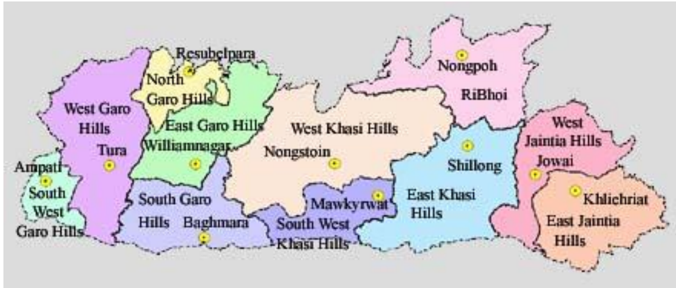
Location map of East Jaintia district Annexure I