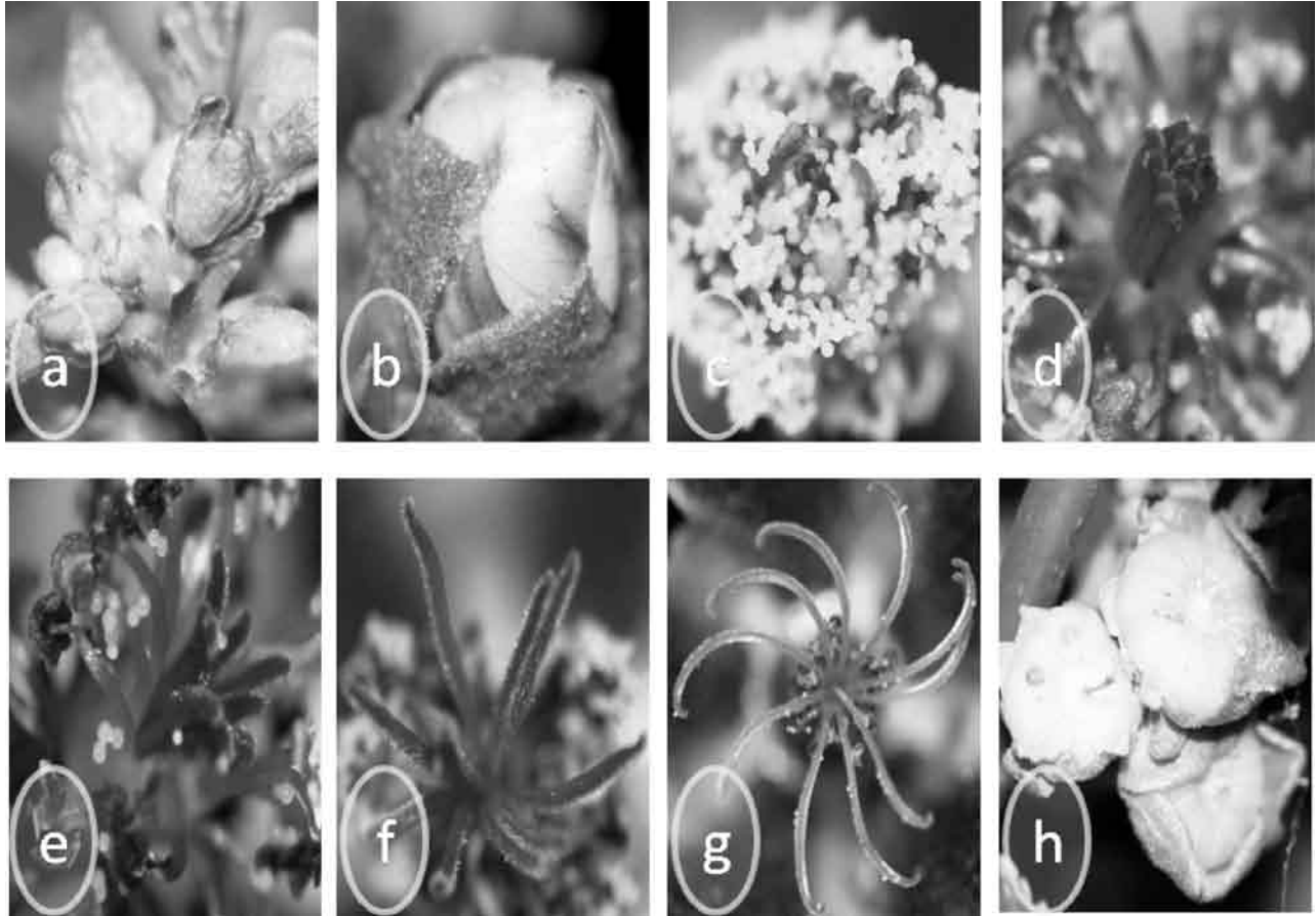
Fig. 3. Flower developmental stages of Malva sylvestris . (a) flower bud initiation (b) flower bud formation (c) un-protruded style below pollen grains, (d) style emergence, (e) stigma emergence, (f) formation of style curvature, (g) receptive stigma, and (h) schizocarp formation after fertilization.

depression in the Australian annual Hibiscus trionum var. vesicarius (Malvaceae). Australian J. Bot. 54 : 27-34.