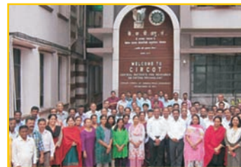
ICAR-CENTRAL INSTITUTE FOR RESEARCH ON COTTON TECHNOLOGY, MUMBAI