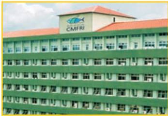
ICAR-CENTRAL MARINE FISHERIES RESEARCH INSTITUTE KOCHI, KERALA