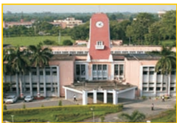
GOVIND BALLABH PANT UNIVERSITY OF AGRICULTURE AND TECHNOLOGY, PANTNAGAR, UTTARAKHAND