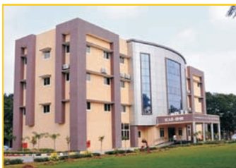
ICAR-INDIAN INSTITUTE OF MILLET RESEARCH HYDERABAD