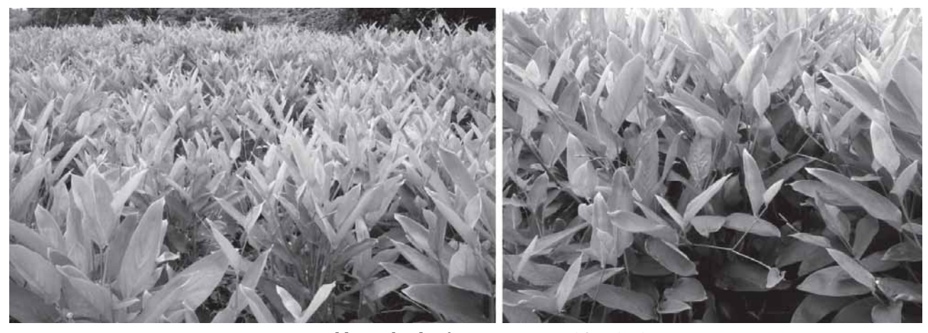
Fig.1. Field genebank of arrowroot at ICAR-CTCRI

checked in an agarose gel and then quantified by measuring the OD at 260 nm. OD at 280 nm was also recorded to check the purity of DNA. Purity of DNA sample was calculated from OD at 260/280 ratio.