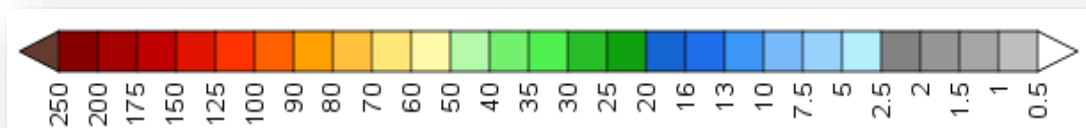
Figure:2. Precipitation forecast for 13 to 21 Aug 2020.

Disclaimer: The predictability of weather depends on many dynamic factors. The success of Agromet advisories provided here depends on the accuracy of the forecasts. In no event will India Meteorological Department (IMD) and Indian Council of Agricultural Research (ICAR) be liable to the user or any third party for any direct, indirect, incidental, consequential, special or exemplary damages or lost profit resulting from any use or misuse of the information on this bulletin.