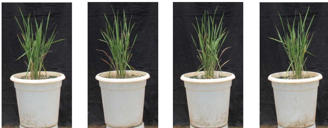
Fig. 1: Images taken from four direction of a single plant

Note: The sign “-” in the above table indicates missing observation (not available).