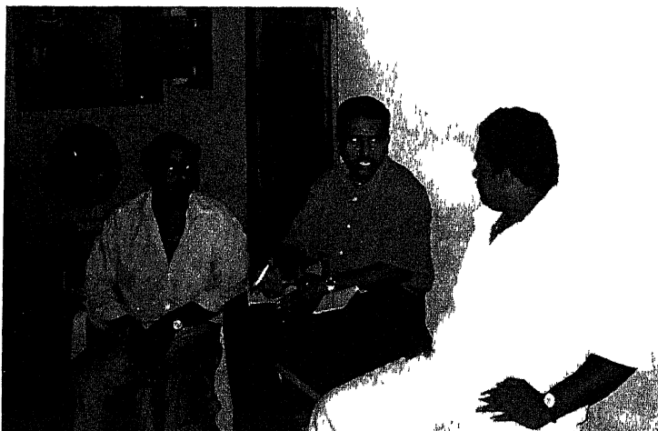
Scientist investigator with office bearers of shrimp farmers association

Registration of the association as a legal body under relevant government provisions will strengthen its activities. Even credit, insurance and licenses may be issued only to the association, which has holistic approach for development of sustainable aquaculture in the farm cluster. Financial assistance may be given to such groups for developing infrastructure like wastewater treatment plants, cold storage facilities etc. Farmers' representatives from the association may be included in the District and State level committees of the Aquaculture Authority to share their views in the planning process. Besides village level associations, there may be an active district level farmers committee and a dynamic farmers' federation at state level which can take care of the interests of shrimp farmers and function as an influential body. Accordingly the shrimp farmers associations should be