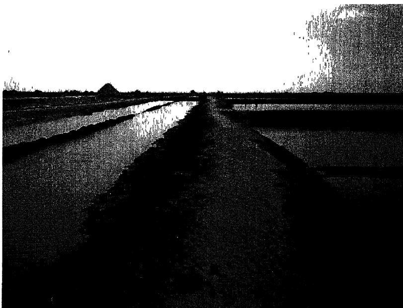
Common infrastructure - inlet canal

The association help its members to obtain licenses from the Aquaculture Authority by providing necessary documents obtained from revenue authorities, prepare their applications, and submit them to the District Committee and follow-up for their clearance. It adjudicates the disputes among members amicably through discussion and persuasion. It has close