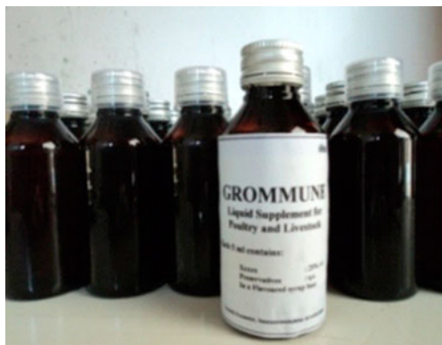
Figure 1. Grommune tonic prepared from M. citrifolia fruit juice.

Group D: tonic 15 ml up to 4 weeks; 30 ml 5–8 weeks daily in water per 30 birds