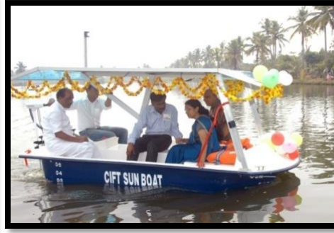
Fig.1. Rubber wood canoe Fig.2. Solar-powered boat useful for aquaculture etc