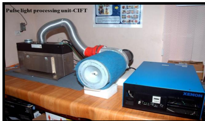
Fig.5. High pressure processing unit Fig.6. Pulse light processing unit