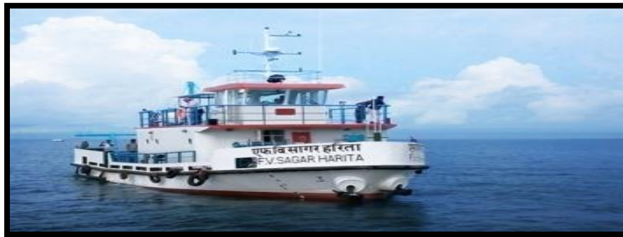
Fig.3.Sagar Haritha': Energy efficient green fishing vessel