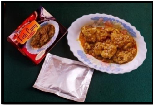
Fig.7. Fish curry in retortable pouches