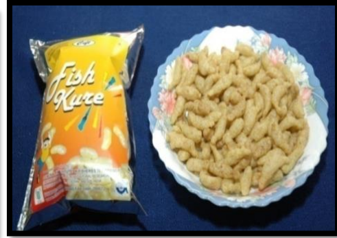
Fig.8. Extruded fish snack