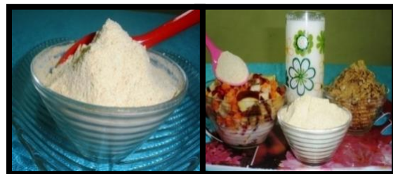
Fig.11. Collagen peptide from fish scale and Nutritional mix formulated by CIFT