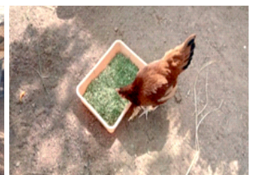
Hen feeding on Moringa leaf powder