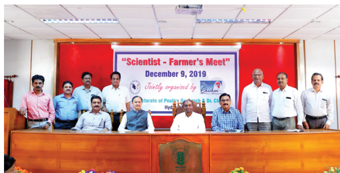
Scientists Farmers' Meet

The Directorate organized a “Scientists- Farmers' Meet” on 9th December 2019 with an aim to understand the issues and solutions related to egg and chicken meat consumption. The event was organized in collaboration