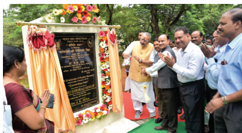
Hon'ble Minister unveiling the foundation stone