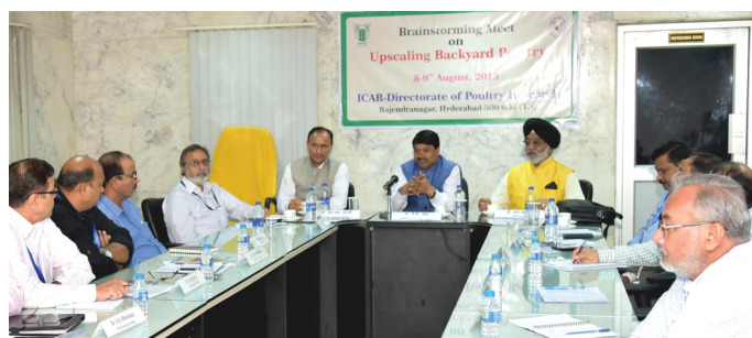
Dignitaries at the Meeting