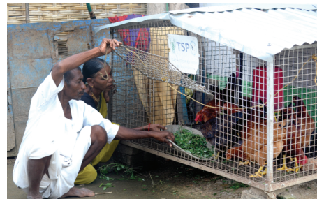
Farmer couple in Adilabad dt.