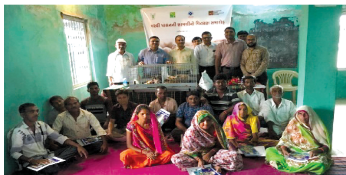
Director and other dignitaries with beneficiaries