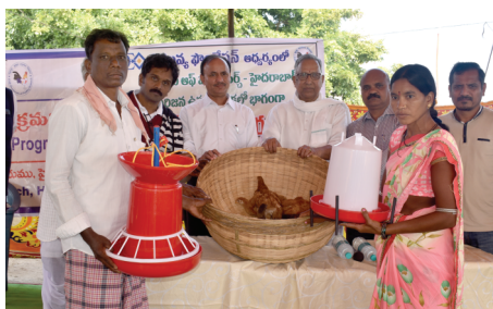
Input distribution in Adilabad dt.