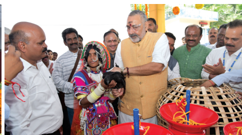
Hon'ble Minister distributing Kadaknath chickens to tribal woman farmer

Shri Giriraj Singhji interacted with tribal and scheduled caste farmer beneficiaries and distributed Kadaknath and Improved Aseel chickens along with other inputs under the Scheduled Caste Sub Plan and Tribal Sub Plan. During his interaction with the farmers, the Minister stressed upon rearing more number of low input birds under cluster mode with involvement of entrepreneur at village level. Shri Giriraj Singhji urged the scientists to develop suitable models incorporating measures for minimizing the feed cost such as vermicomposting and moringa cultivation for efficient rearing of low input birds to achieve the target of doubling the farmers' income. He also stressed the need of making clusters of farmers in certain locations of the country, who are being benefited by the varieties developed by the institute.