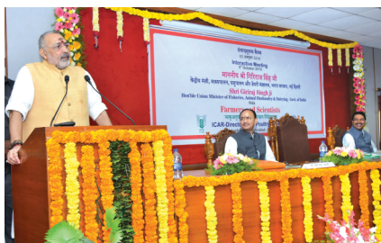
Hon'ble Minister interacting with farmers and Scientists