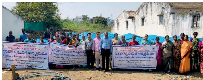
Input distribution in Telangana