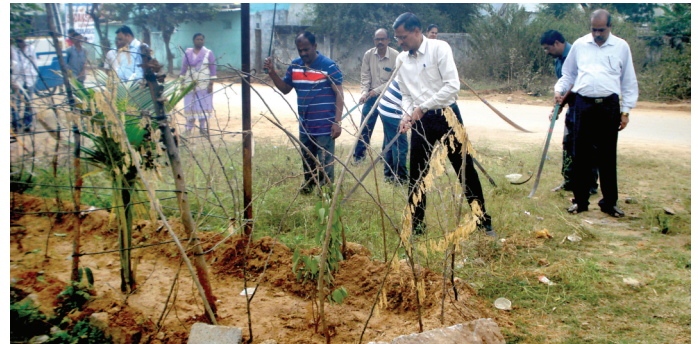
Cleaning activity at village