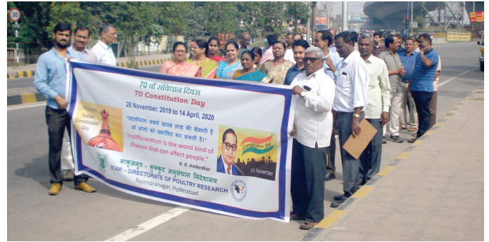
Constitution Day celebration-Rally by staff

Swachhata, compost preparation, minimizing the use of plastics etc.