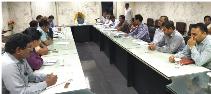
Half-yearly IRC Meeting