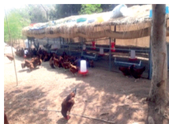
Night shelter for hens