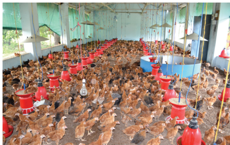
Mother unit at Uttoor, Adilabad dt.

The Directorate carried out TSP work in Adilabad district, Telangana as identified by the Govt of India and ICAR for implementation of Tribal Sub Plan. One training program was organized during the period where 21 farmers including women were trained on poultry farming. Each farmer was provided with 10-20 birds, feeders, drinkers, 25-40 kg feed and some essential medicines. Technical inputs and suggestions were provided to the farmers by the DPR scientists and technical officers from time to time. Periodically, scientists visited the farmers and evaluated the performance of the birds and collected the feedback.