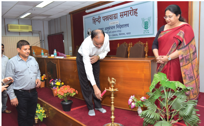
Hindi Pakhwada celebration

The Directorate conducted the quarterly meetings of Official Language Implementation Committee on 22-08-2019 and 17-12-2019, in which different issues related to effective implementation of Hindi Language in office were discussed. The Directorate also conducted two Hindi workshops on 7-09-2019 and 18-12-2019 for upgrading the Hindi skills of staff in day to day official work. The Directorate also celebrated "Hindi Pakhwada" celebrations during 03-16 September 2019 and Hindi Day on 16th September