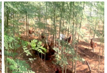
Hens foraging in Moringa plantation