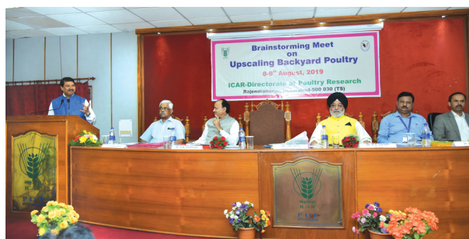
DDG (FS&AS) addressing the participants