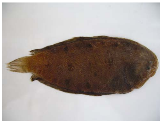
Fig. 2— A. kobensis