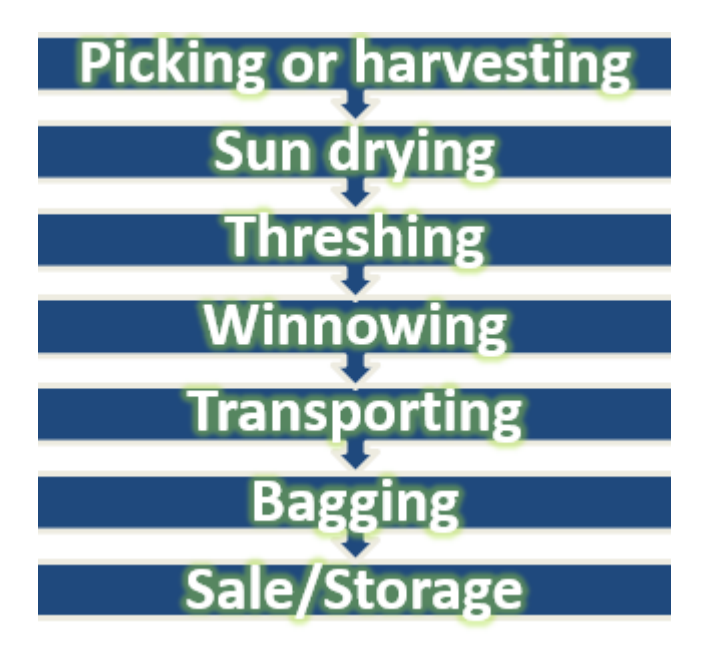
Fig. 2: Unit operations inharvest and post-harvest management of Cowpea

harvested once after all the beans mature (harvest moisture: 11.83-34.67%). The unit operations in processing of the crop are given in fig. 2.