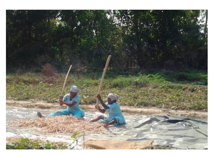
Fig. 4: Threshing of cowpea pods

cowpea or non-chemical protection such as Triphal, Neem leaves. During the study season, the yield of cowpea varied from 0.34–3.48 t/ ha among sampled farmers (Manohara et al , 2020) and reported yield of 1.44 t/ ha for local cowpea germplasm grown on research farm. The 100 grain weight of the dried cowpeas varied from 18-33g (due to variability in the local germplasm (Manihara et al., 2020 have reported varying 100 seed weights of <16-22.9 g in Goa, while Kamara et al.also reported 15-21g in West African Savannas)