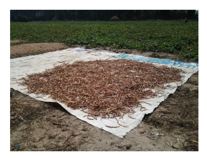
Fig. 3: Sundrying of harvested cowpea pods

The beans are sun-dried (Figure 3) and threshed manually by beating with sticks (Figure 4) or treading by feet. One of the farmers used a multi-crop thresher. The common methods of storage were in woven plastic bags, airtight plastic/metal cans with coating of mixture of boric powder @1g/ 2kg of cowpea and cooking oil @1g/ 2.5 kg of