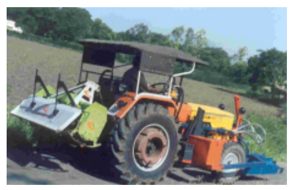
Fig.1. Tractor operated cotton stalk shredder cum insitu applicator

The tractor operated commercially available chain drive, 42 blade, GES make rotavator is selected as in situ applicator for incorporation of shredded cotton stalks in the field.